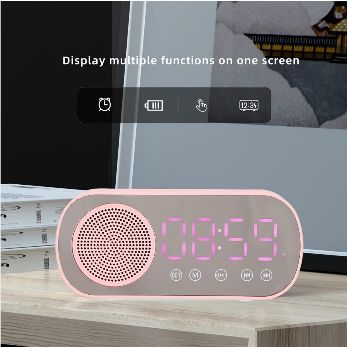
Figure 7: The LED display showing multiple functions and indicators, including time, battery level, and Bluetooth status.