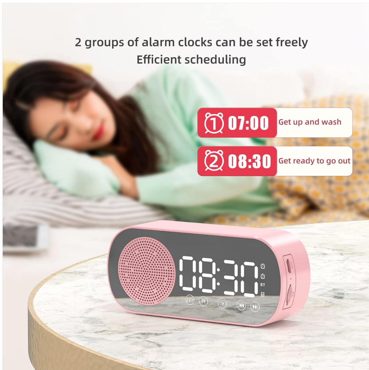
Figure 4: The alarm clock illustrating the dual alarm feature with two distinct alarm settings.