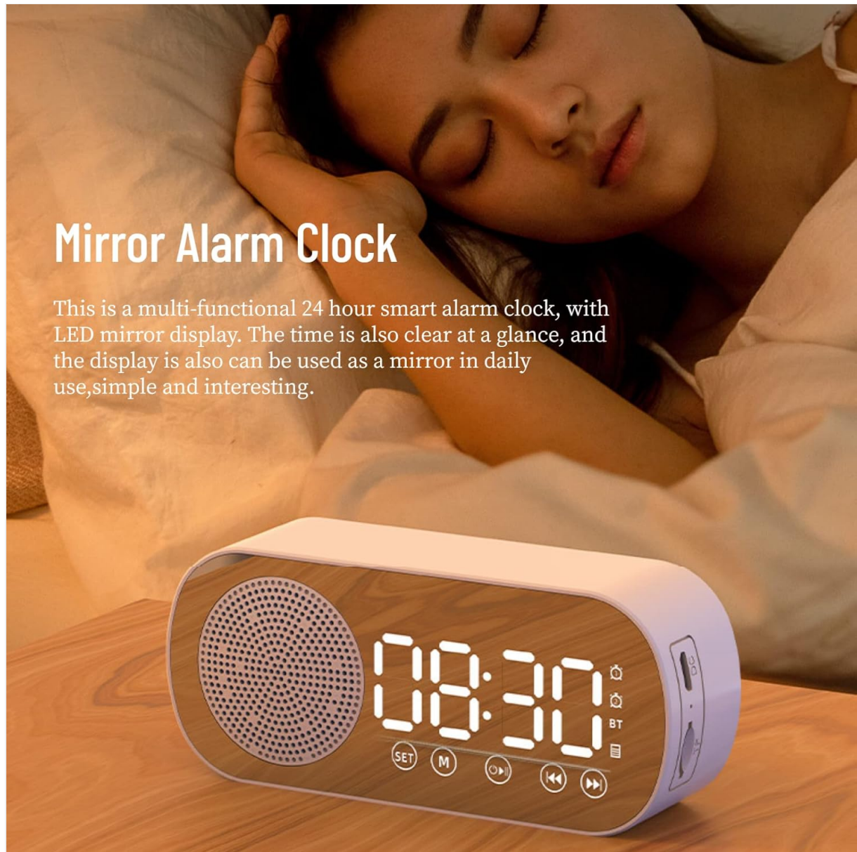
Figure 6: The alarm clock's LED display also functions as a mirror.

The front panel of the device features an LED display that shows the time and other information. When not actively displaying information, the surface can be used as a mirror.