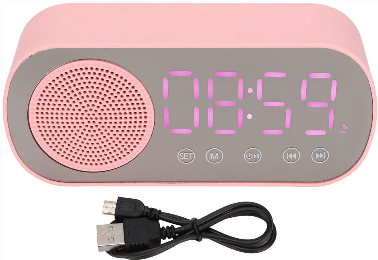
Figure 3: The alarm clock and its Micro USB charging cable.

The battery indicator on the LED display will show charging status. A full charge typically takes a few hours.