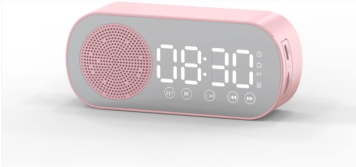
Figure 1: Front view of the Jectse Bluetooth Speaker Alarm Clock, showing the speaker grille, LED display, and control buttons (SET, M, Play/Pause, Previous, Next).

Refer to the image below for an overview of the device's components and controls.