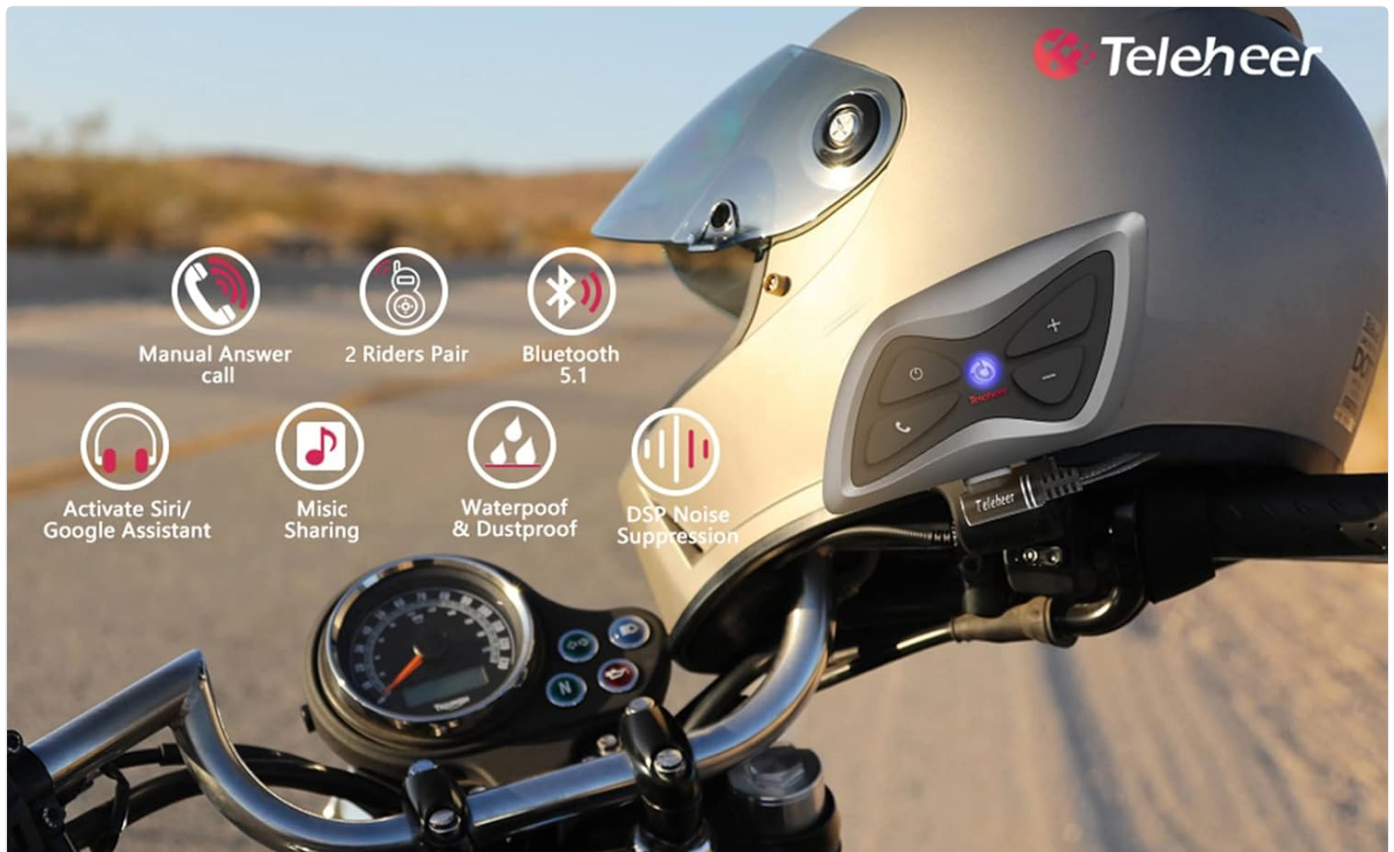
Image: A WGP Teleheer T6 Plus headset unit mounted on the side of a motorcycle helmet. This image demonstrates the typical installation position of the headset on a helmet, showing its compact design and how it integrates with the helmet's exterior. The control buttons are visible, indicating ease of access for the rider.

5. Connect Cables: Plug the speaker/microphone cable into the Type-C port on the main headset unit.