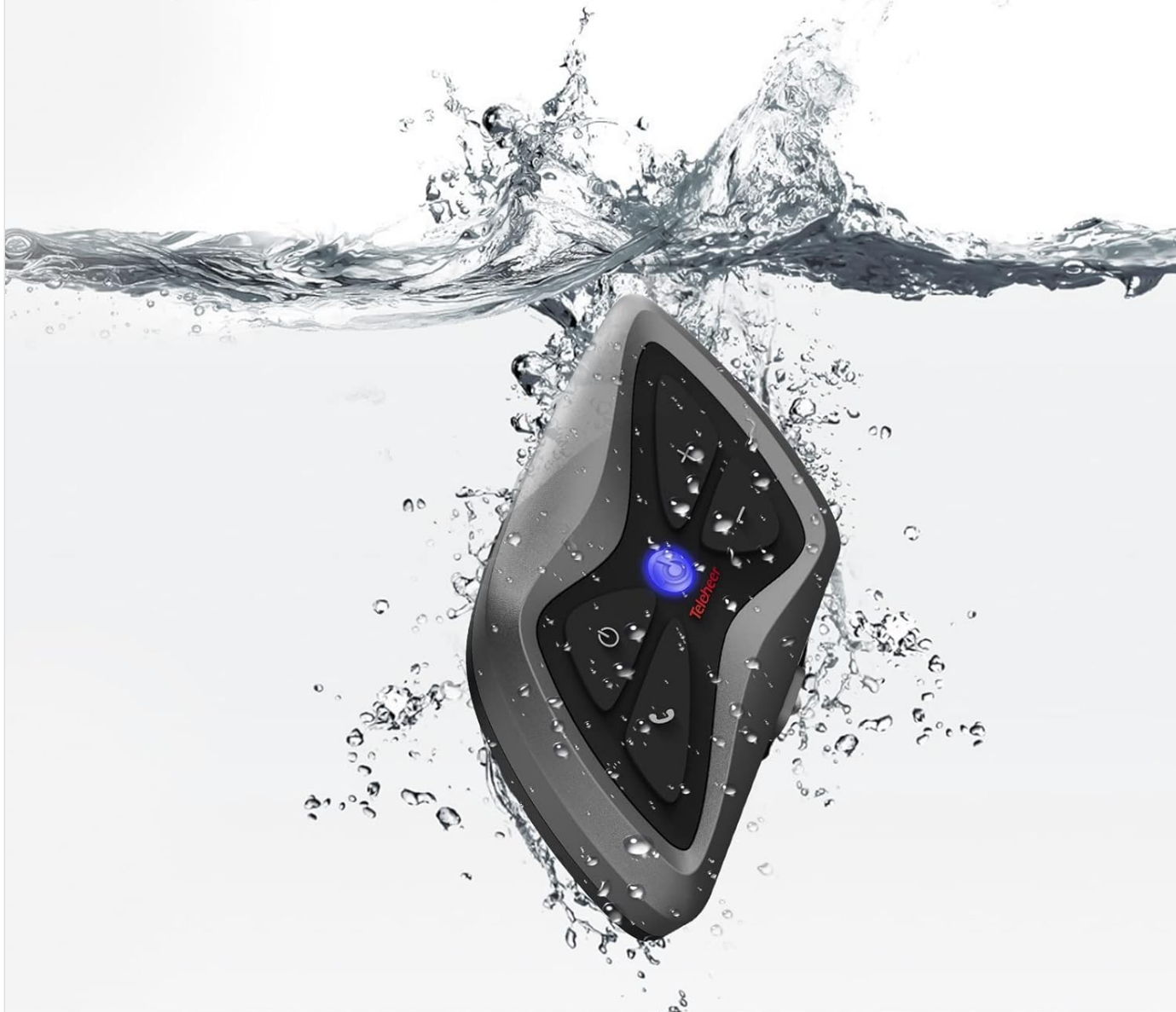
Image: A WGP Teleheer T6 Plus headset unit partially submerged in water with splashes, demonstrating its IP65 waterproof rating. The image emphasizes the device's ability to withstand water exposure, making it suitable for various weather conditions during riding.

Jet-proof type Directly affected by water jets in any direction without harmful effects