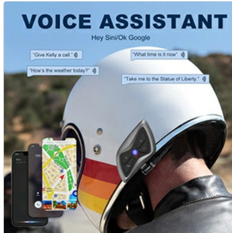
Image: A graphic depicting the voice assistant feature of the Teleheer T6 Plus, showing a helmeted rider interacting with their phone via voice commands like "Hey Siri" or "Ok Google". This illustrates the hands-free convenience for navigation, calls, and other smartphone functions while riding.