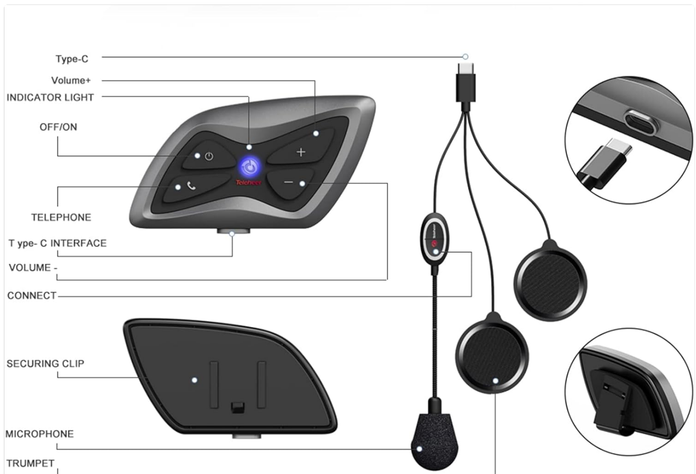
Image: A detailed diagram illustrating the components of the WGP Teleheer T6 Plus headset, including the main unit with its Type-C port, indicator light, and control buttons (OFF/ON, Volume+, Volume-, Telephone, Connect). It also shows the securing clip, microphone, and trumpet (speakers), providing a clear visual guide to the parts included and their connections.