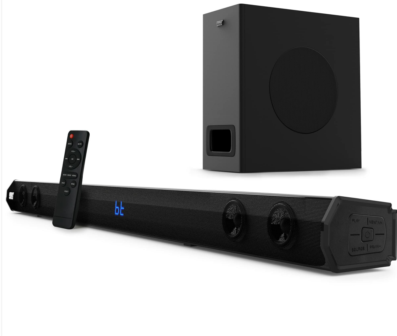
Image 1: Pyle PSBV28HB 2.1 Channel TV Soundbar Speaker System with soundbar and wireless subwoofer.