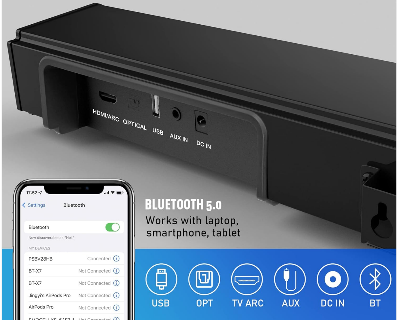
Image 3: Rear view of the soundbar showing HDMI/ARC, Optical, USB, AUX IN, and DC IN ports.