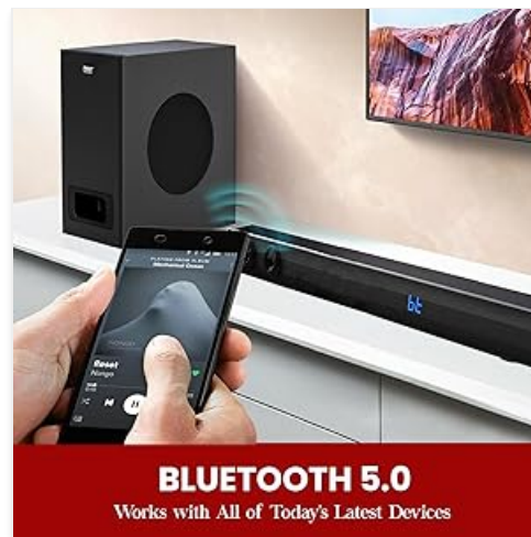
Image 8: A smartphone displaying Bluetooth settings, showing the "PSBV28HB" device available for connection.