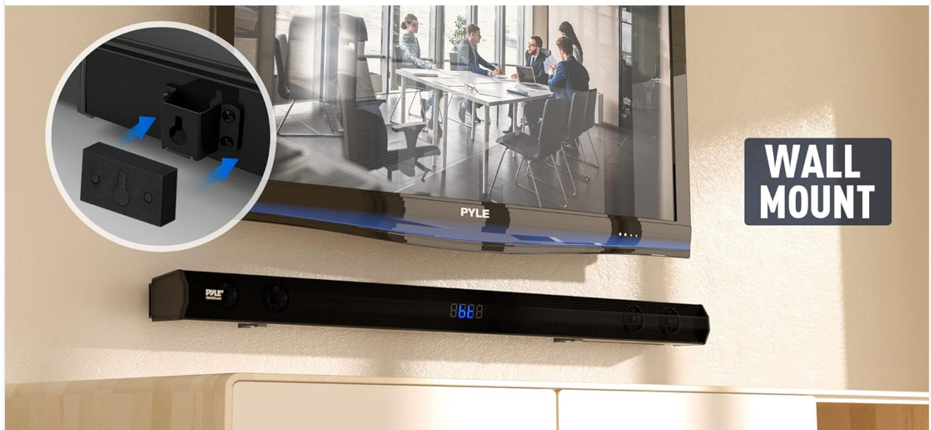
Image 6: Visual representation of the two installation methods: standing on a surface and wall-mounted.