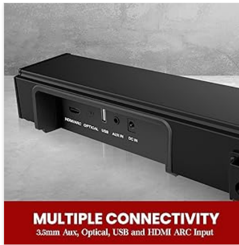
Image 7: Close-up of the soundbar's rear panel highlighting the HDMI ARC, Optical, USB, and AUX IN ports.