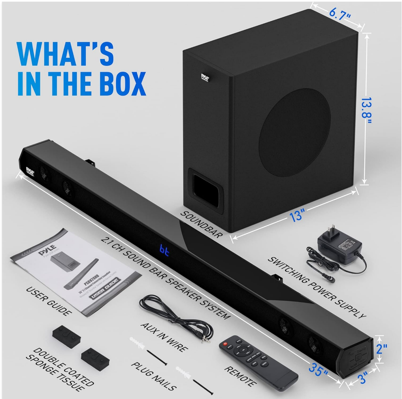
Image 2: Contents of the Pyle PSBV28HB package, including soundbar, subwoofer, remote, cables, and power adapter.