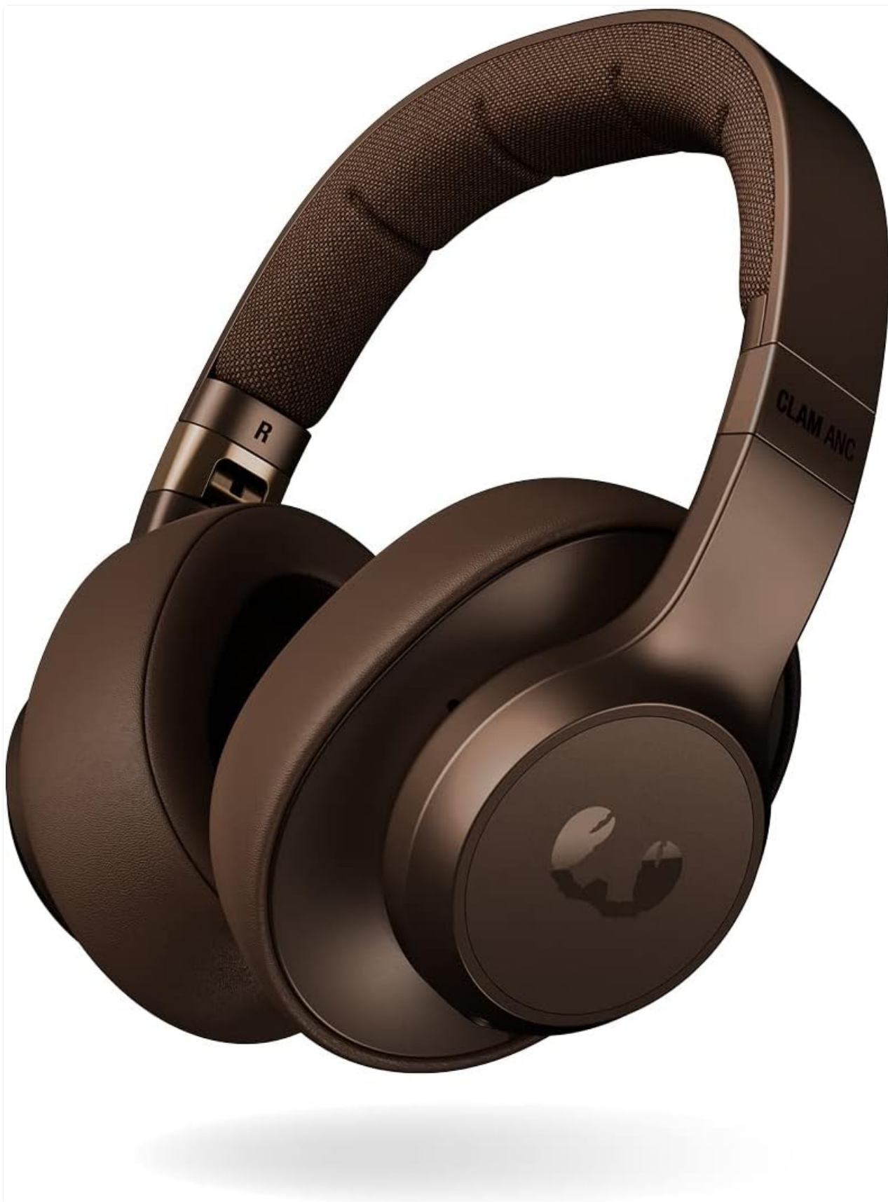
Image: Fresh 'n Rebel Clam ANC Bluetooth Headphones in Brave Bronze, showcasing the sleek design and over-ear cups.