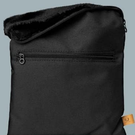
Image: A visual representation of the Fresh 'n Rebel Clam ANC headphones, charging cable, audio cable, and carrying pouch, as typically found in the product packaging.