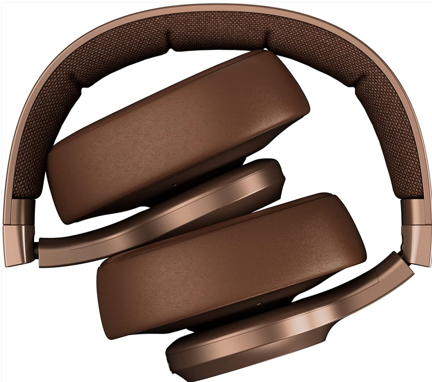
Image: The Fresh 'n Rebel Clam ANC headphones shown in their folded position, demonstrating their compact design for easy storage and portability.