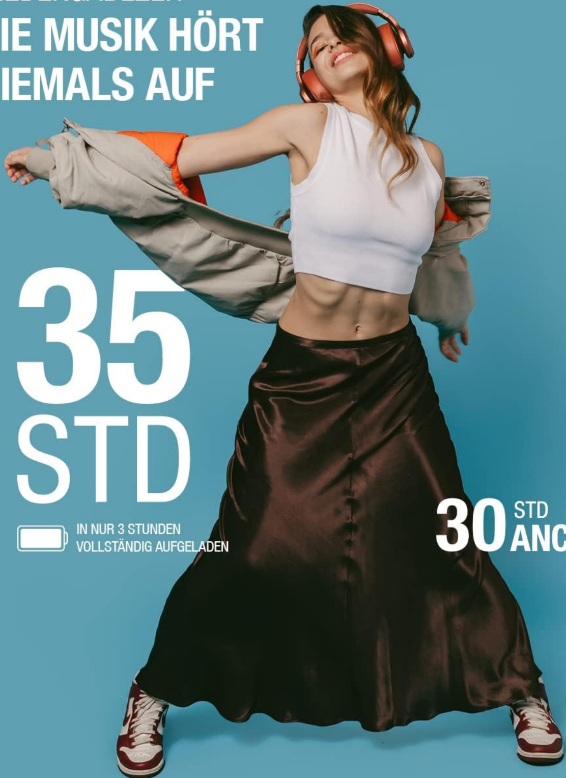
Image: A graphic illustrating the impressive battery life of the Clam ANC headphones, indicating up to 35 hours of wireless playtime without ANC and 30 hours with ANC enabled, with a full charge in 3 hours.