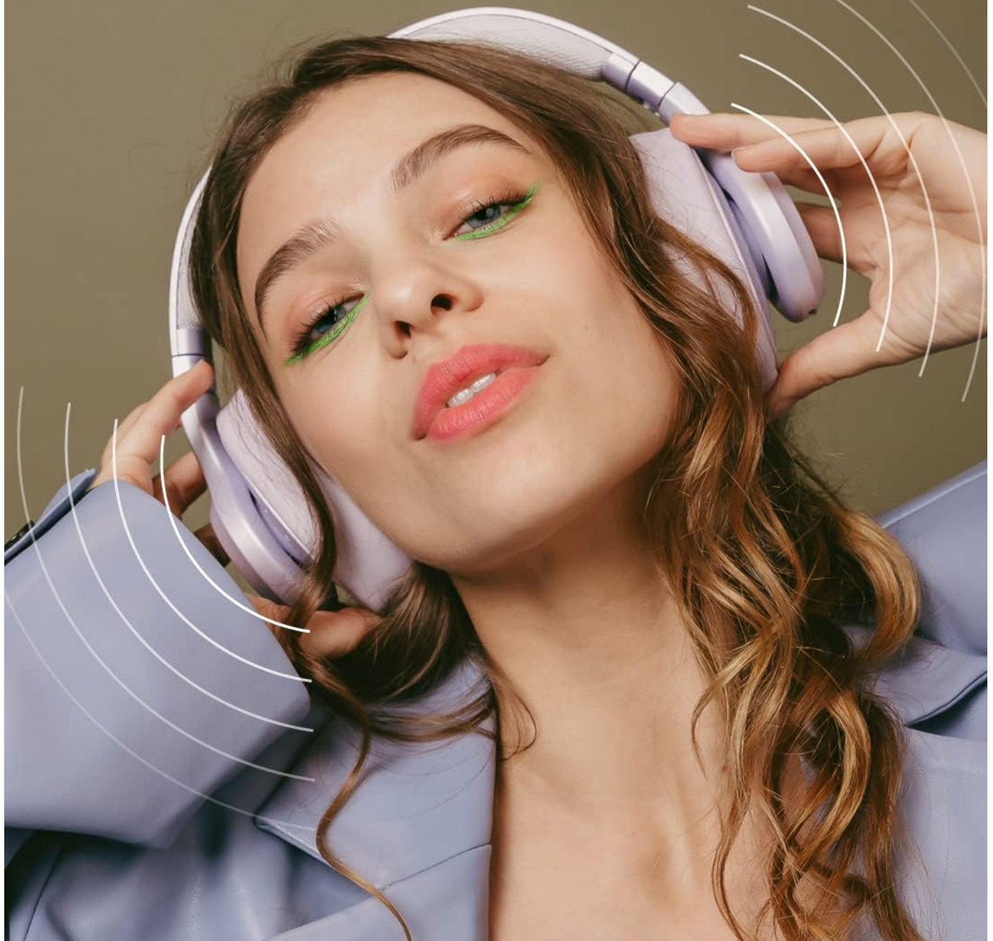
Image: A graphic highlighting the high-quality audio experience of the Clam ANC headphones, featuring Qualcomm aptX technology for superior sound with deep bass, delivered through 40mm drivers.