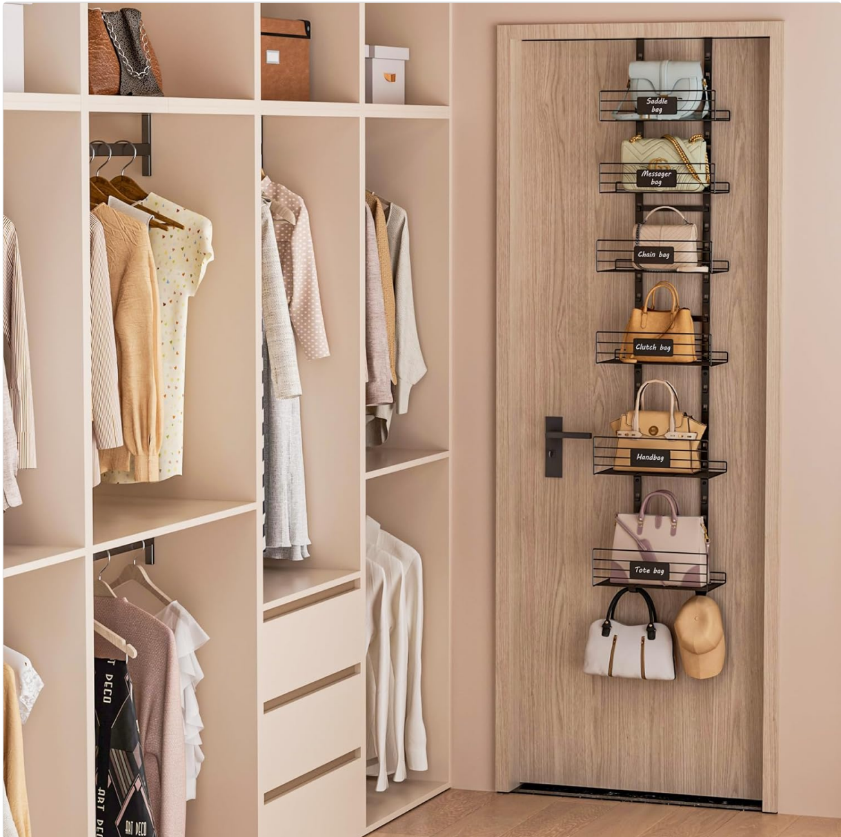
Image 1.2: The organizer mounted on a closet door, demonstrating its space-saving design within a bedroom setting.