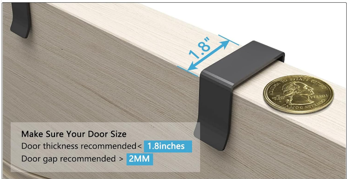
Image 4.1: Visual guide for checking door thickness and gap before over-door installation.