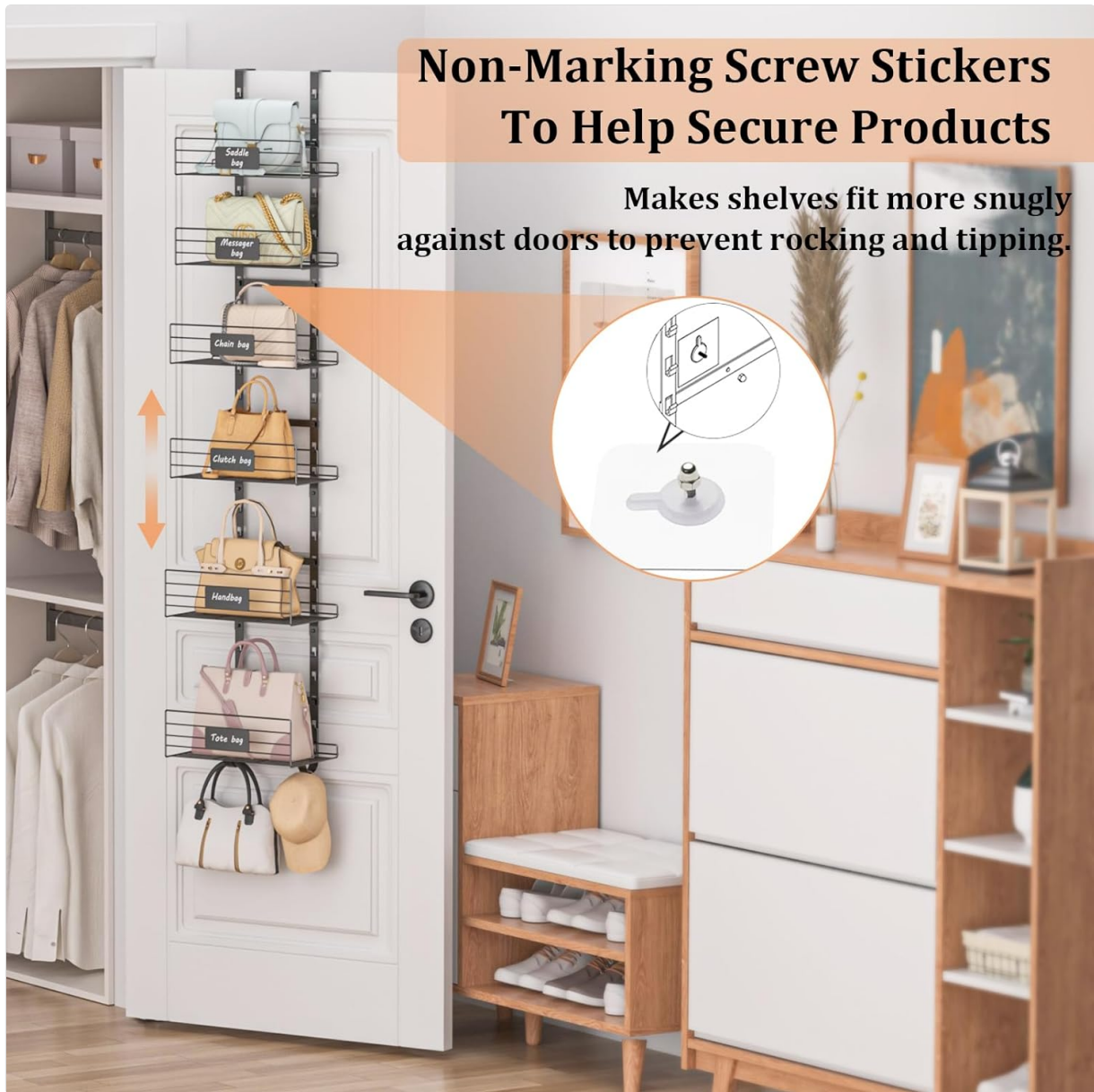
Image 4.2: Illustration of non-marking screw stickers used to stabilize the organizer against the door.

Makes shelves fit more snugly against doors to prevent rocking and tipping.