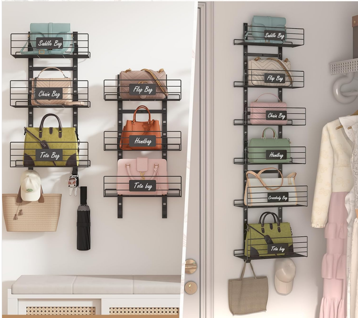
Image 4.3: The organizer configured as a single over-door unit and as two separate wall-mounted units, demonstrating versatility.