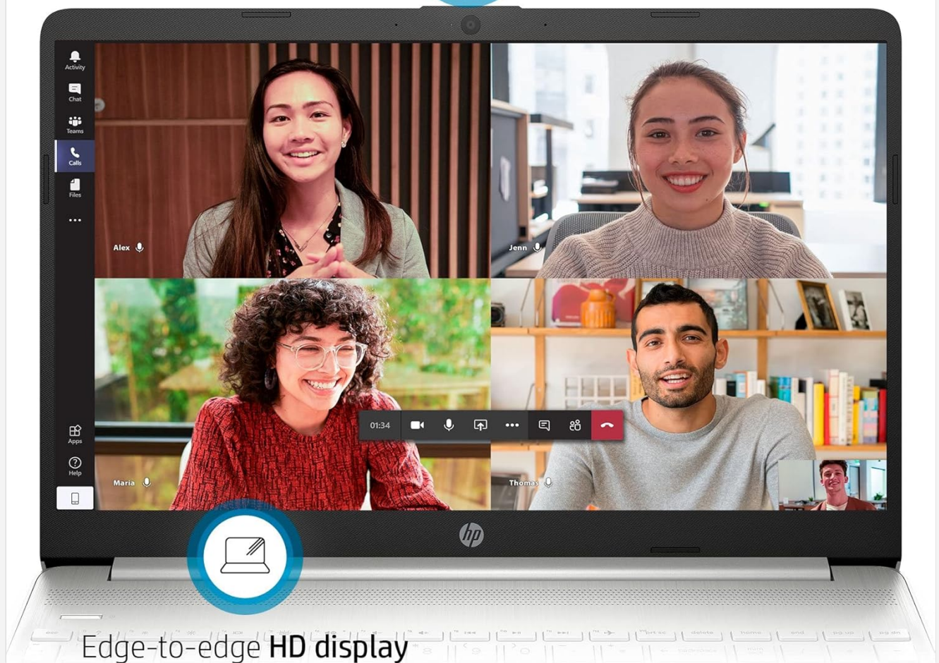
Image: The HP True Vision 720p HD camera with dual array digital microphones, positioned above the edge-to-edge HD display, shown during a video conference.

The integrated HP Wide Vision 720p HD camera with dual array digital microphones is suitable for video calls and online meetings. You can access it through applications like Microsoft Teams, Zoom, or the built-in Camera app in Windows.