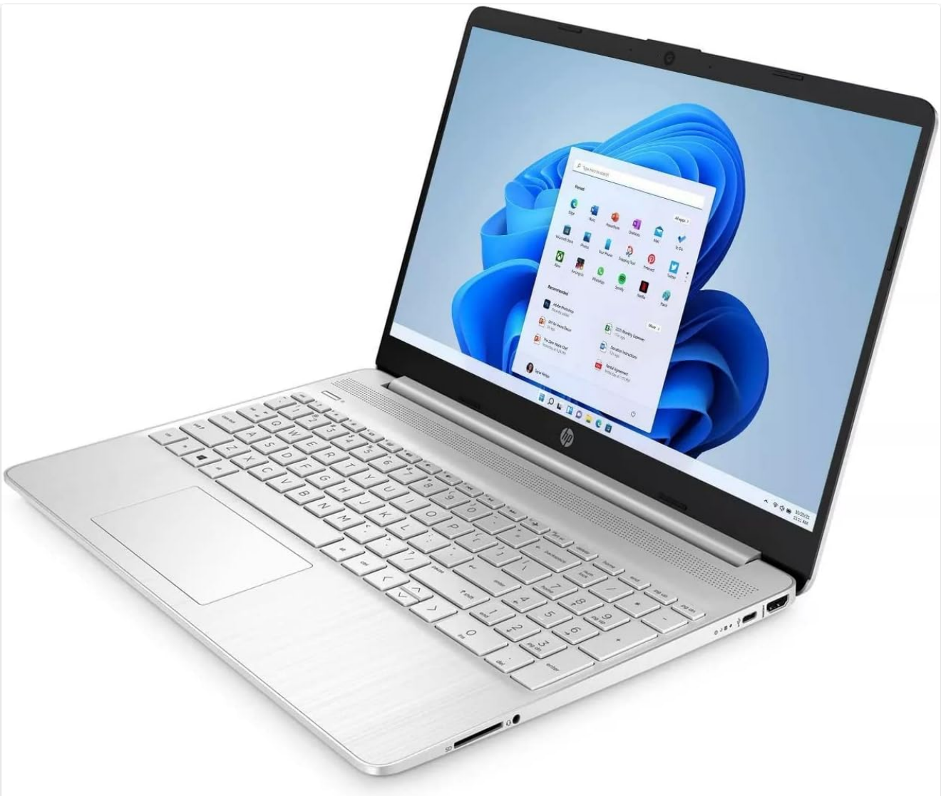
Image: The HP laptop with its full-size keyboard, numeric keypad, and HP Imagepad, displaying the Windows 11 interface.

The laptop features a full-size keyboard with a numeric keypad and an HP Imagepad for navigation. Refer to the Windows 11 documentation for specific gestures and shortcuts.