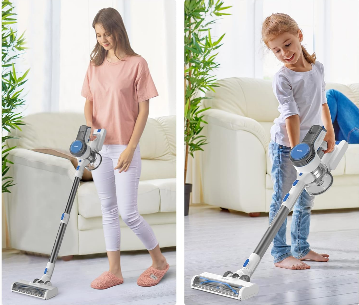
Figure 6: Retractable pole for adjustable length.