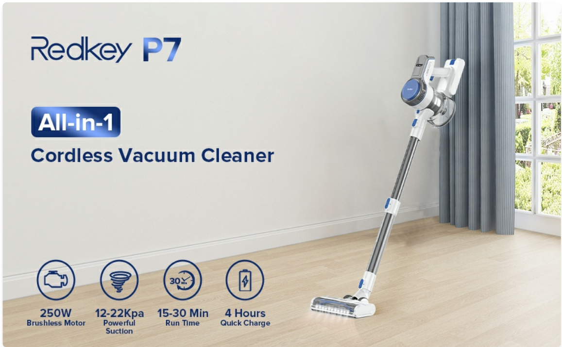
Figure 2: Powerful 22000Pa suction across various floor types.