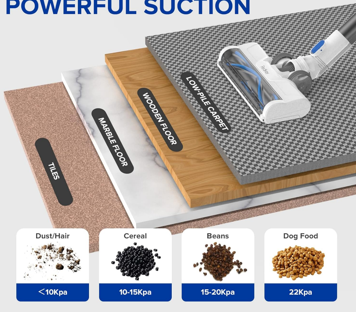
Figure 1: Redkey P7 Cordless Stick Vacuum Cleaner and accessories.