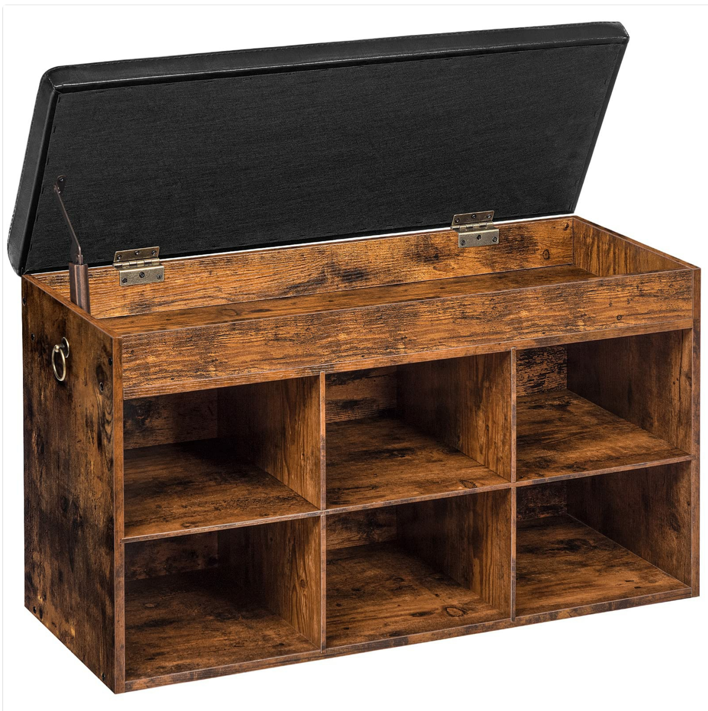
Image: The HOOBRO BF80HX01 Shoe Storage Bench, featuring a padded top, six shoe compartments, and a rustic brown finish, positioned in an entryway.