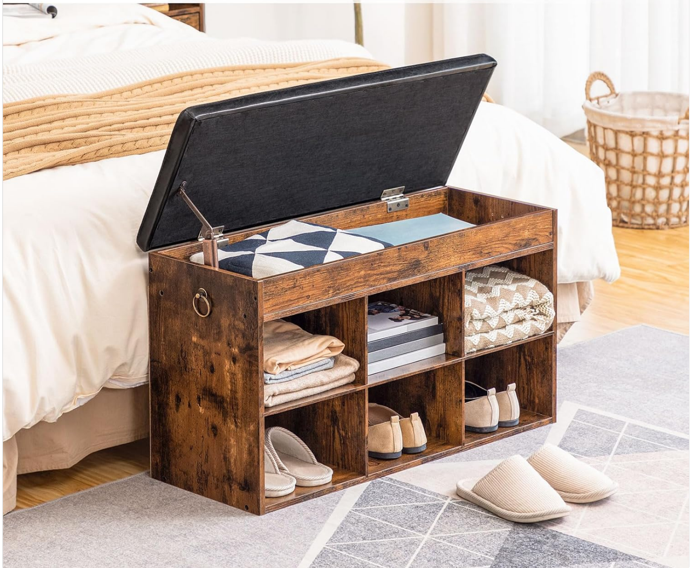
Image: The shoe storage bench with its top lid open, showcasing the hidden compartment suitable for socks, towels, or other small items, in a bedroom setting.

The hidden space below the top for socks, towels or other small items.