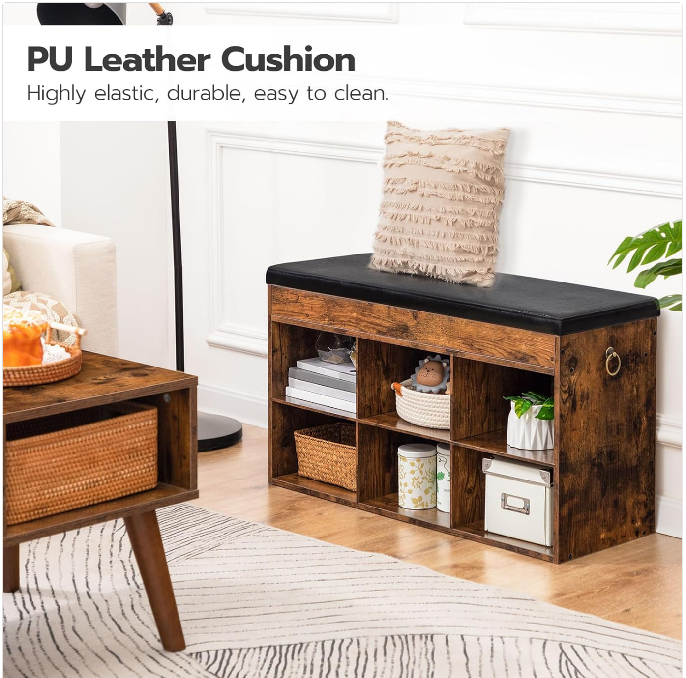
Image: The HOOBRO BF80HX01 Shoe Storage Bench featuring its highly elastic, durable, and easy-to-clean PU leather cushion.