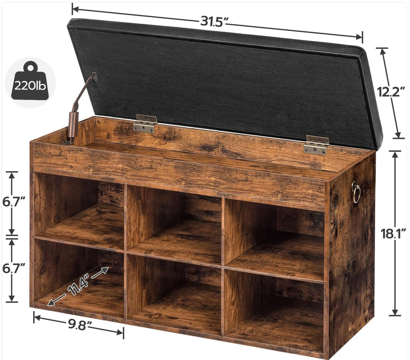
Image: Detailed diagram illustrating the dimensions (31.5"L x 12.2"W x 18.1"H) and the 220lb weight capacity of the bench.