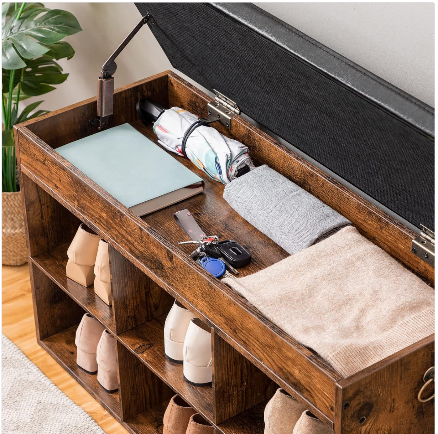
Image: A detailed view of the hidden storage space beneath the flip-open top, showing it used for an umbrella, a book, keys, and folded textiles.