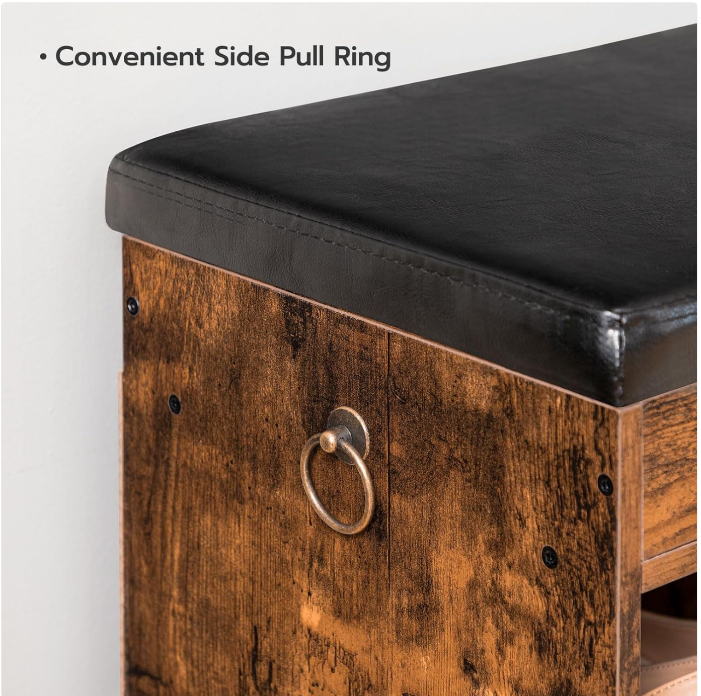
Image: A close-up of the metal pull ring located on the side of the bench, designed for easy repositioning.