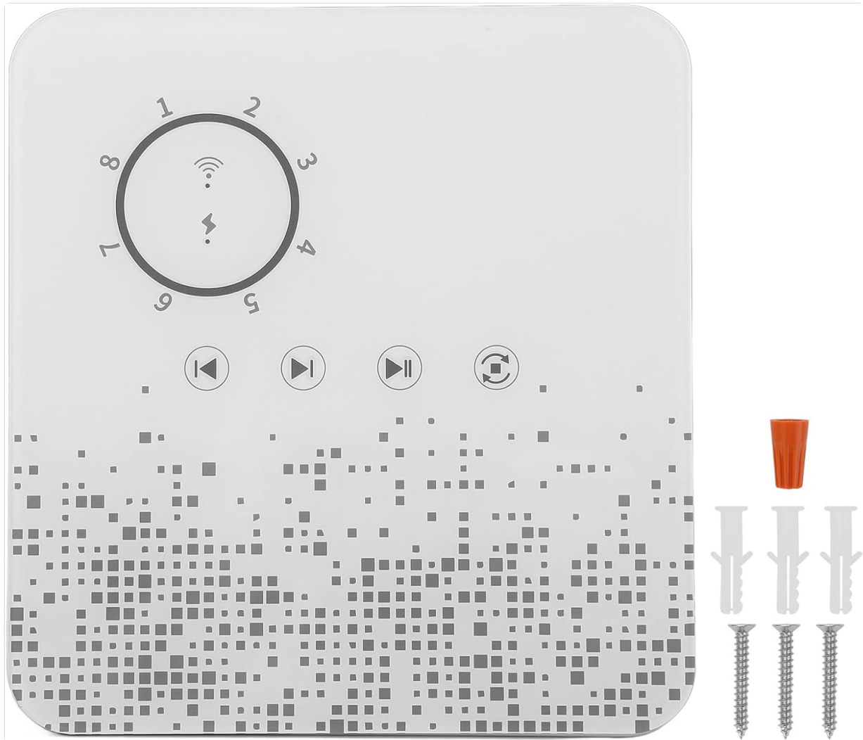
Image: The Sonew 8 Zones Smart Sprinkler Controller shown with its included wiring, screws, and expansion tubes.