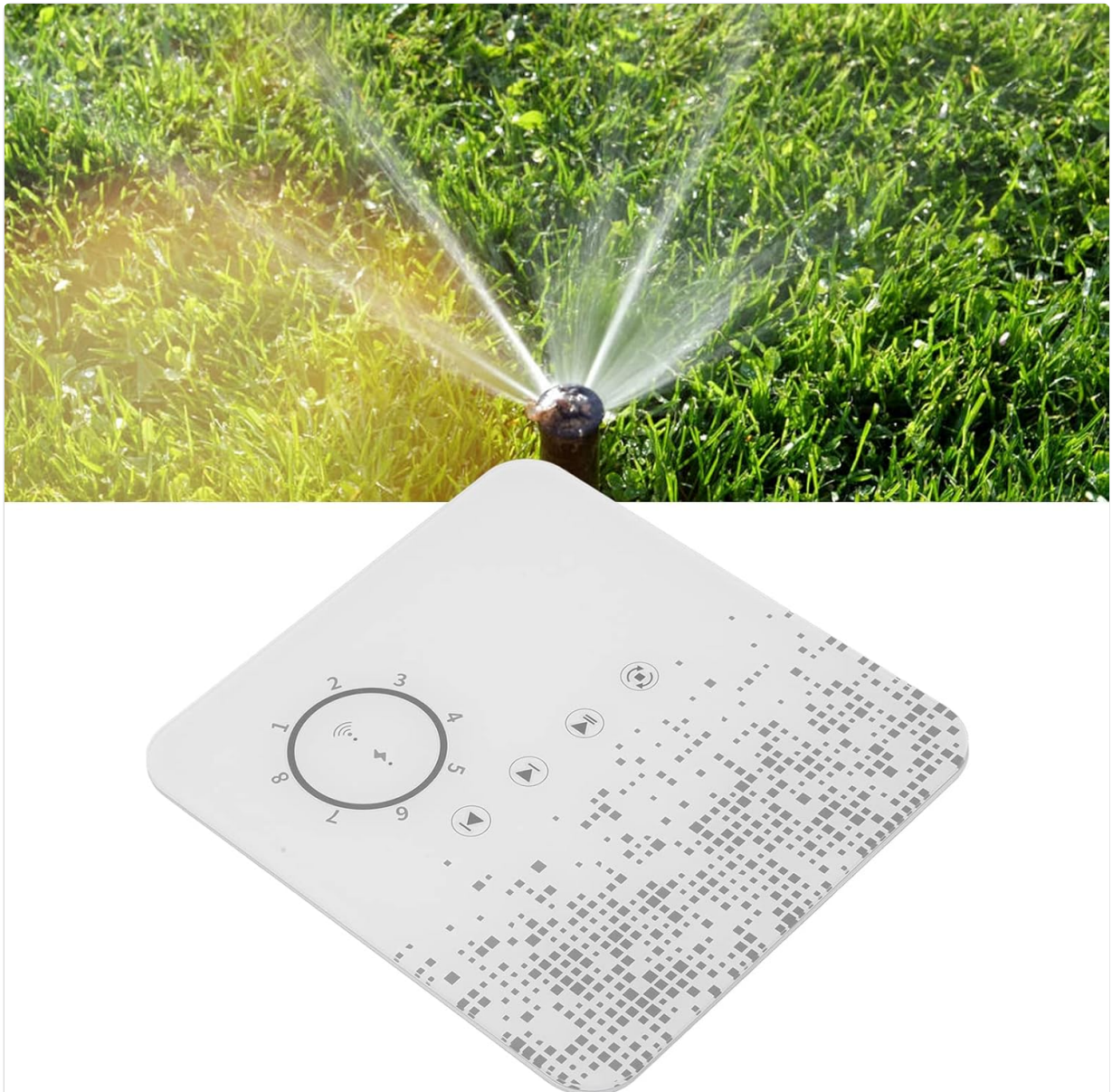
Image: The Sonew Smart Sprinkler Controller positioned in a garden, with a sprinkler actively watering the lawn in the background, demonstrating its intended use.