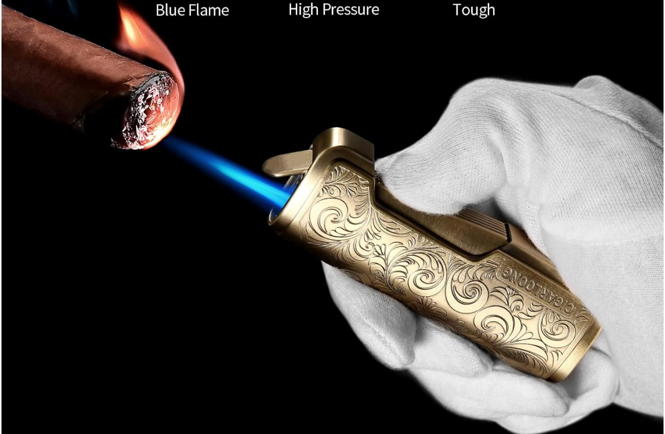
Image 3.3: The lighter producing a strong, concentrated blue jet flame for lighting cigars.

Your browser does not support the video tag.