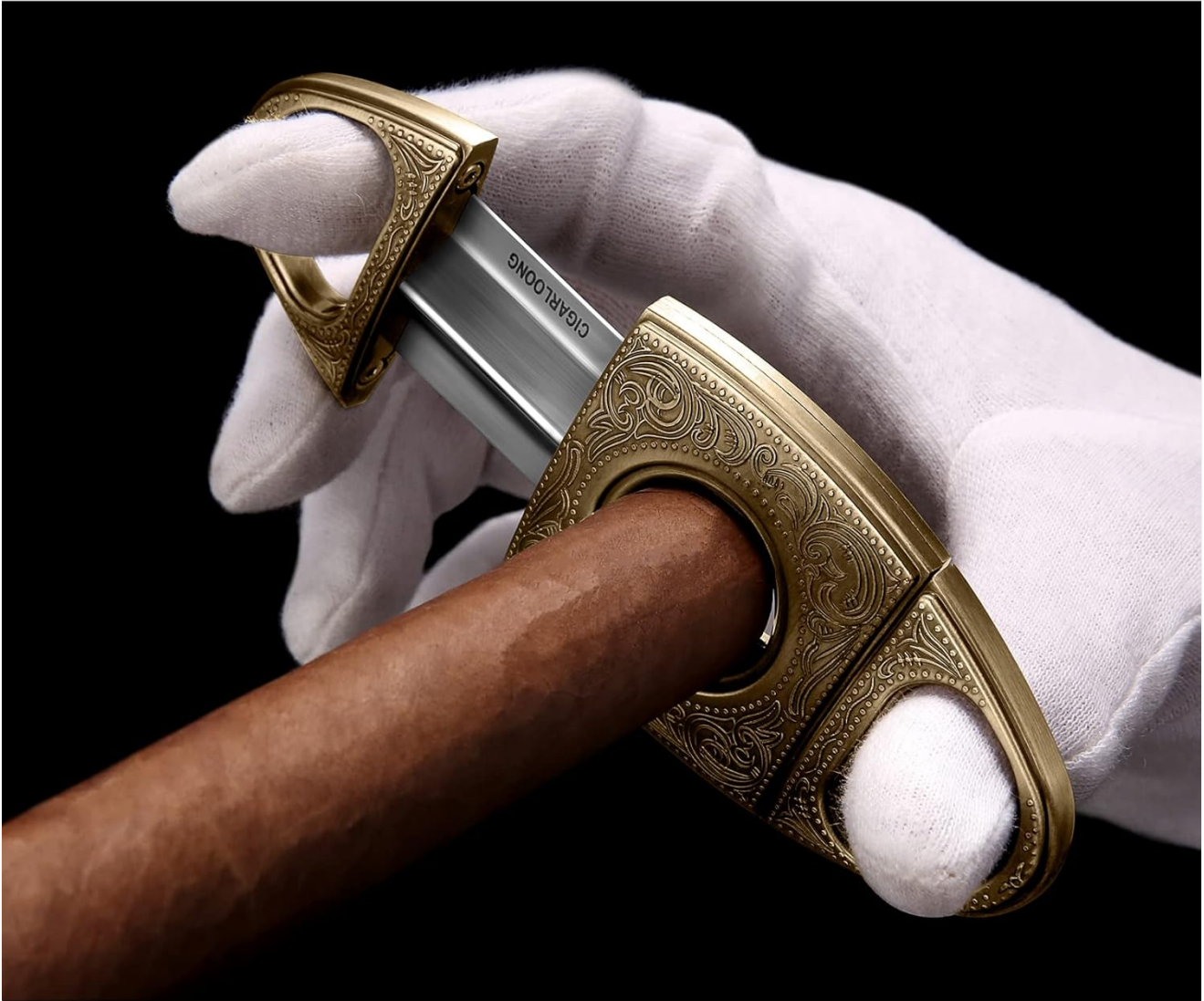
Image 3.2: Demonstrating the use of the V-cut cigar cutter on a cigar, suitable for diameters up to 23mm.

The pull tab opens, suitable for cutting cigars with a diameter of less than 23mm.