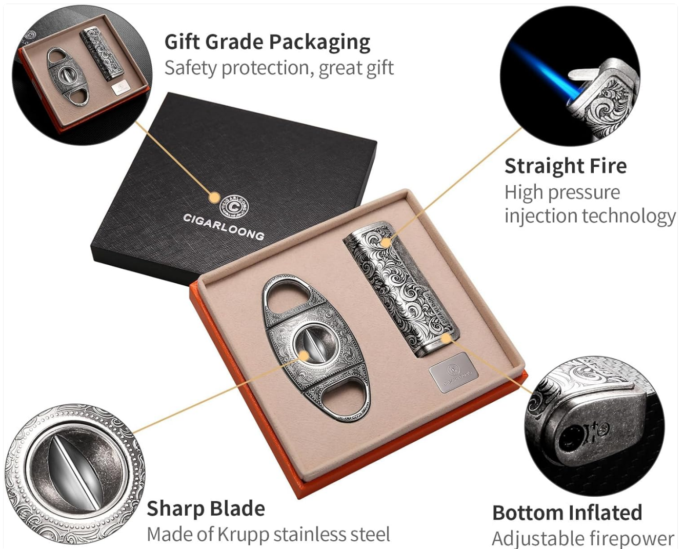
Image 1.1: The CIGARLOONG Cigar Cutter and Lighter Set, presented in its gift packaging.