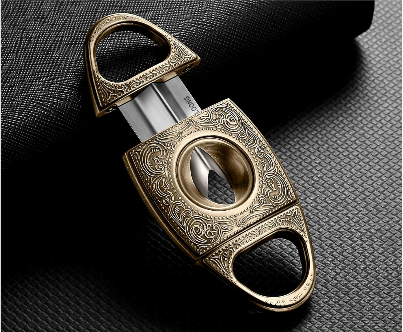
Image 3.1: The sharp stainless steel V-cut blade of the cigar cutter.

Using stainless steel blades, it is sharp and smooth, and the cut surface is flat.