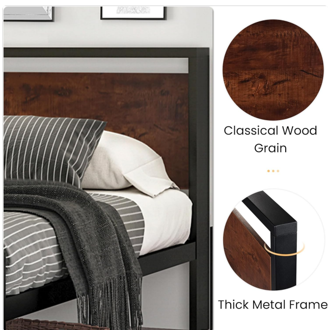
Image: Detail view highlighting the classical wood grain finish of