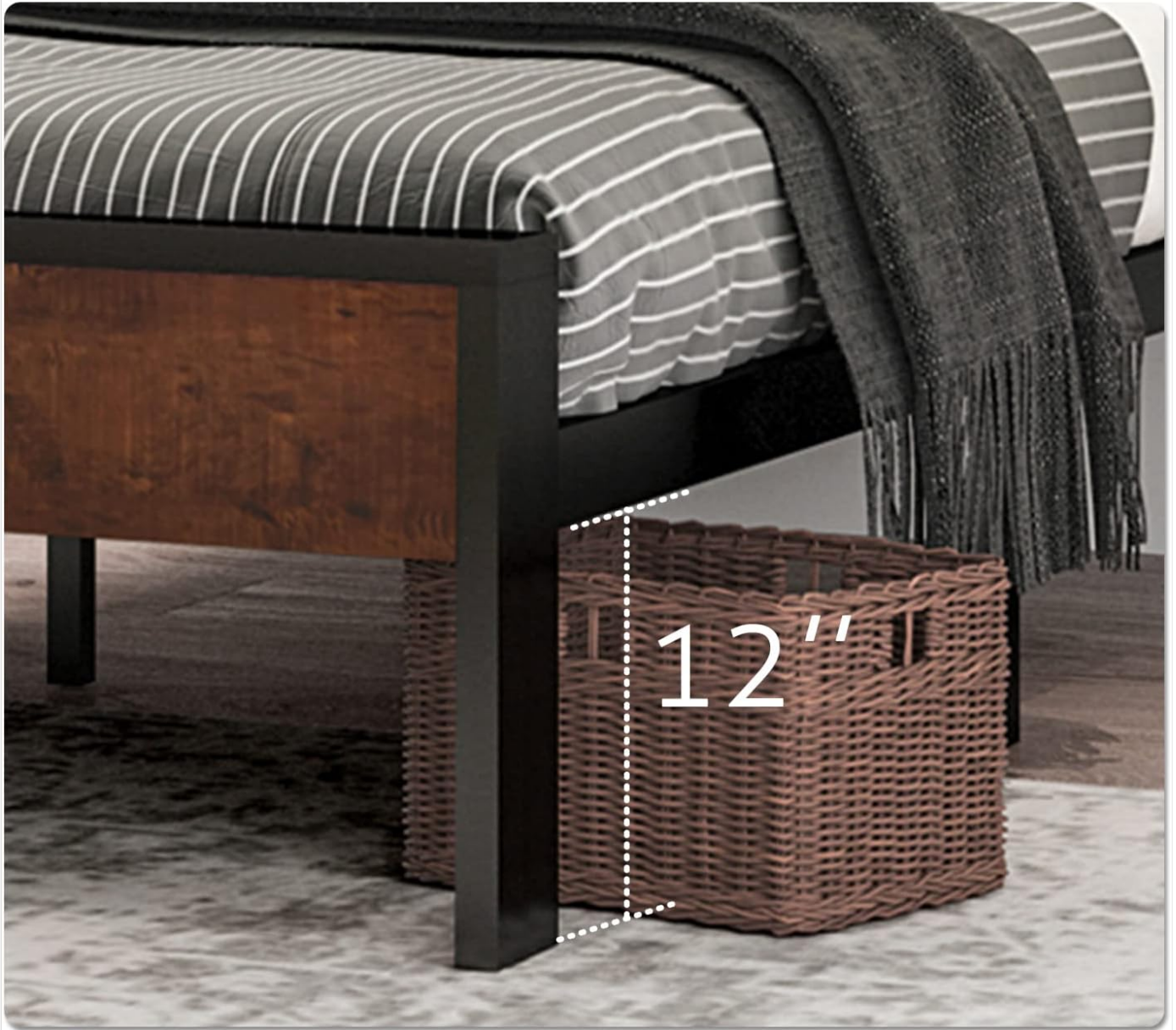
Image: A visual representation of the 12-inch under-bed clearance, demonstrating the ample space available for storage solutions like baskets.