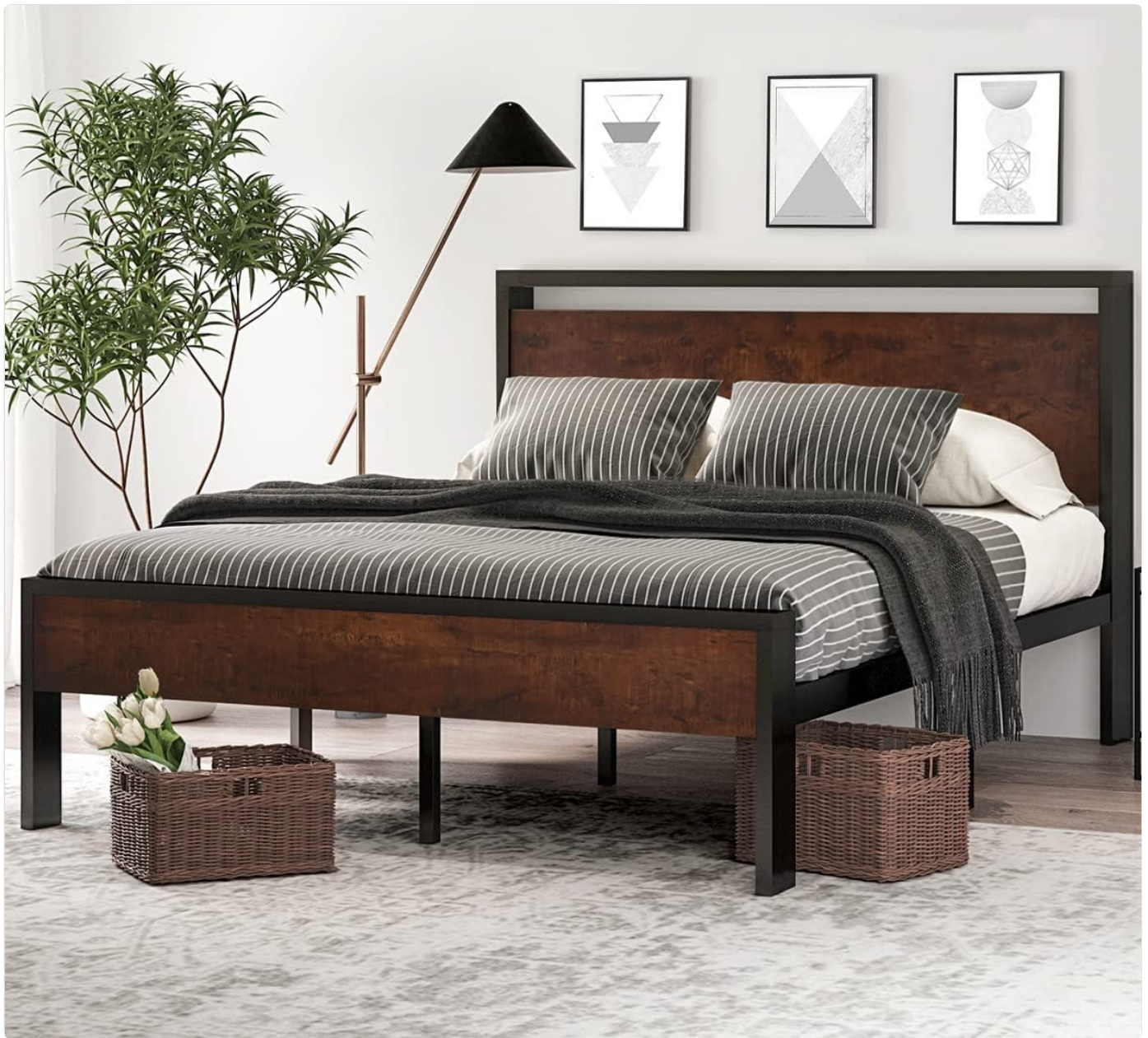
Image: The SHA CERLIN Queen Size Metal Platform Bed Frame in a bedroom setting, showcasing its mahogany wooden headboard and footboard, and black metal frame.