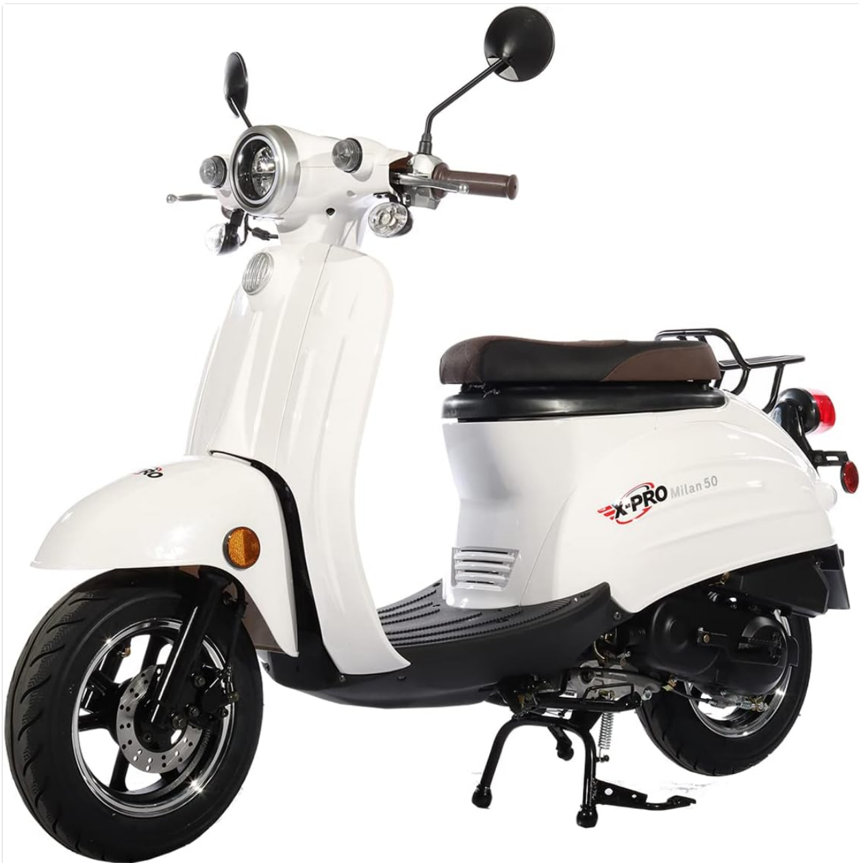
Image: A full side view of the X-PRO Milan 50 50cc Moped, showcasing its design and components.