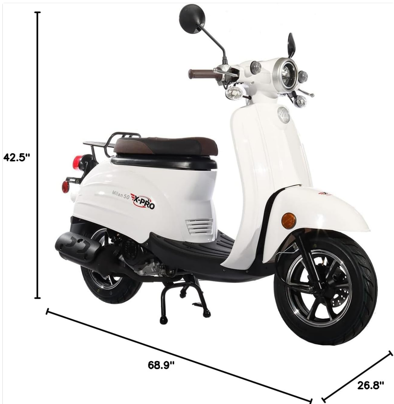
Image: The X-PRO Milan 50 Moped displaying its overall length, width, and height dimensions.