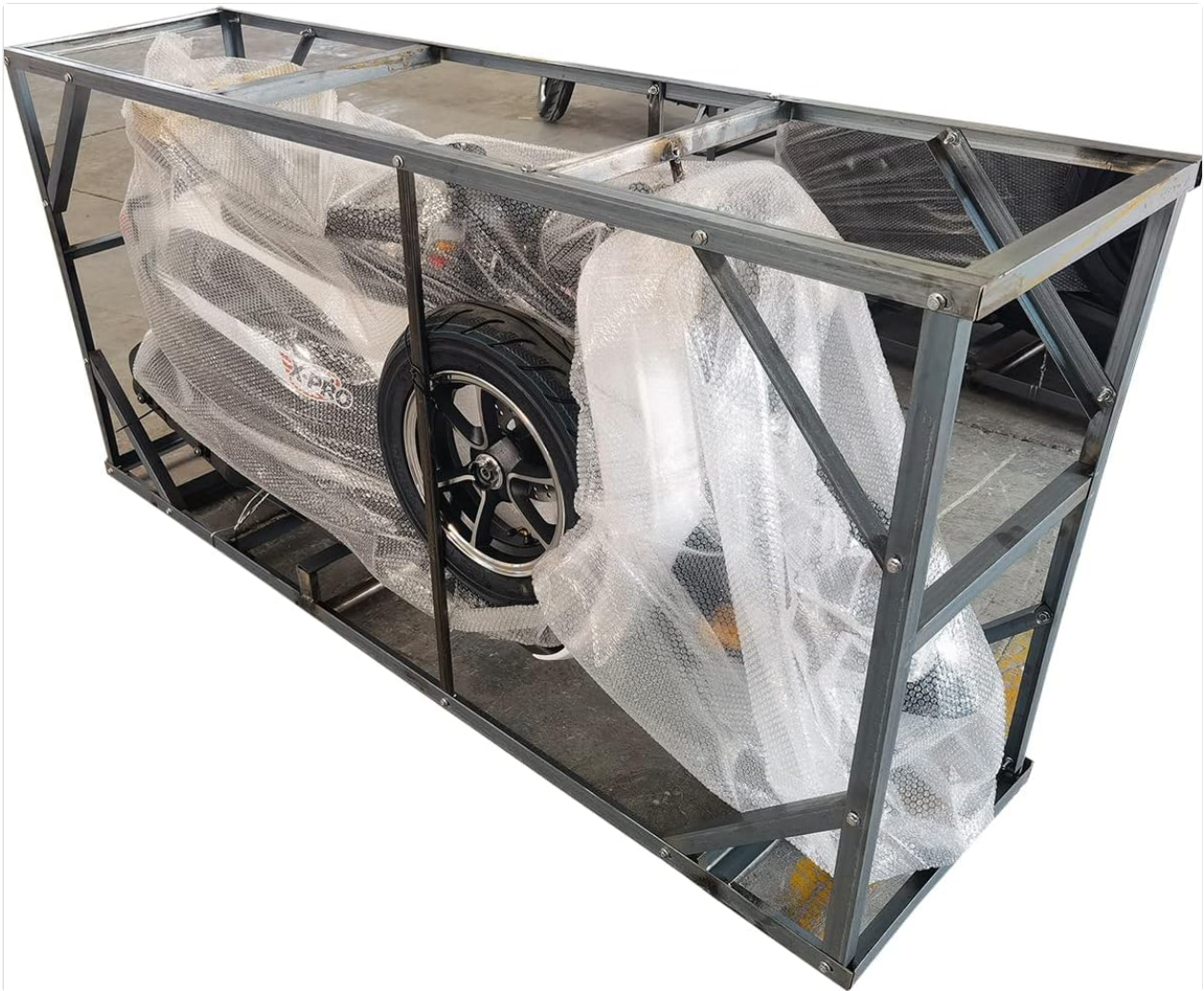
Image: The X-PRO Milan 50 Moped as it appears inside its metal shipping crate, indicating the initial packaging condition.