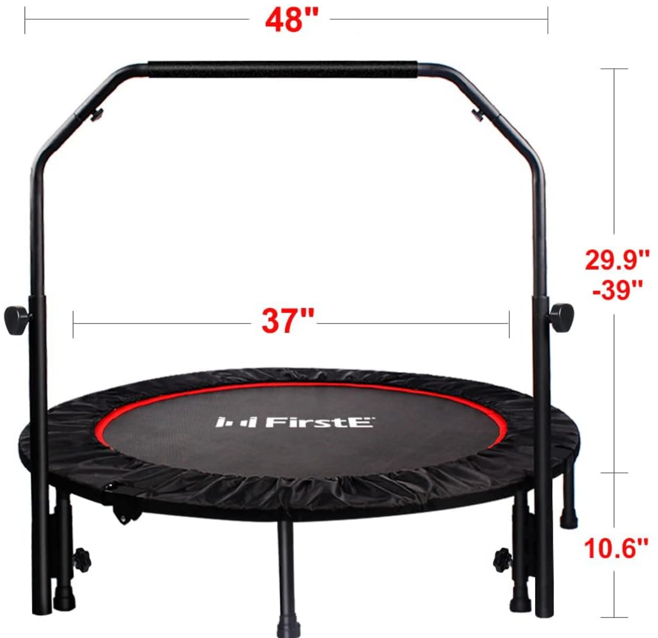
Image: A visual representation of the trampoline's overall dimensions and the four adjustable height settings for the handrail.