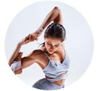
30 Minutes Yoga