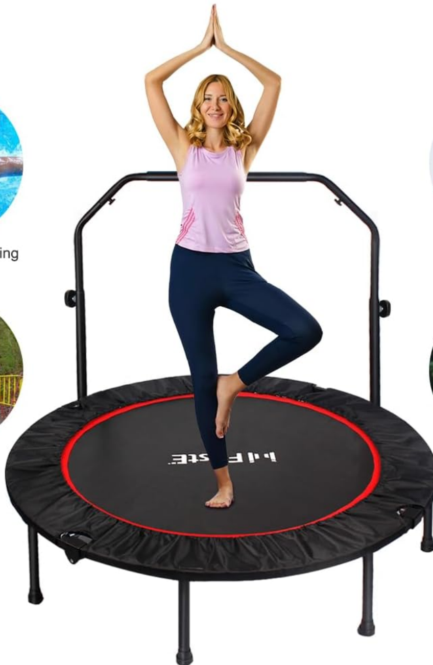
Image: An infographic illustrating the efficiency of a 10-minute trampoline workout compared to other forms of exercise.