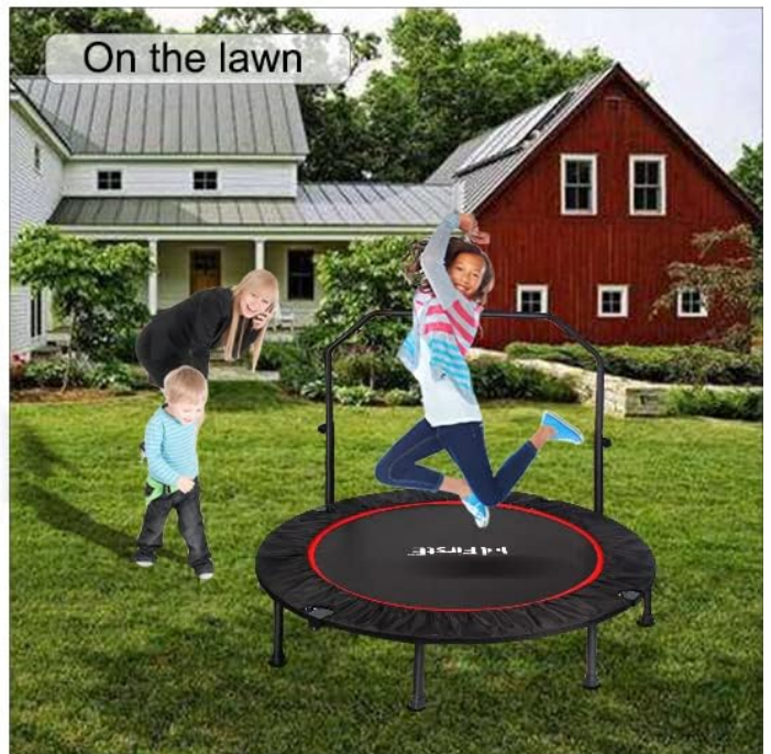
Image: A collage demonstrating the trampoline's versatility for use in different indoor and outdoor environments.