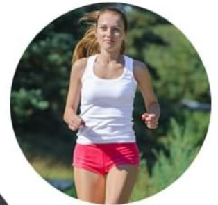
60 Minutes Running