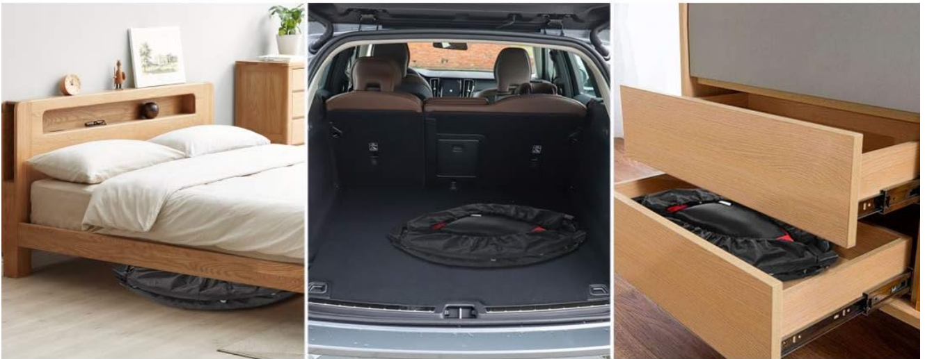
Image: The trampoline in its folded state, demonstrating its compact size for easy storage in various locations.