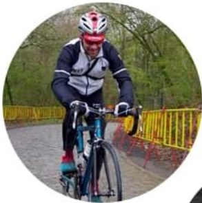
30 Minutes Cycling