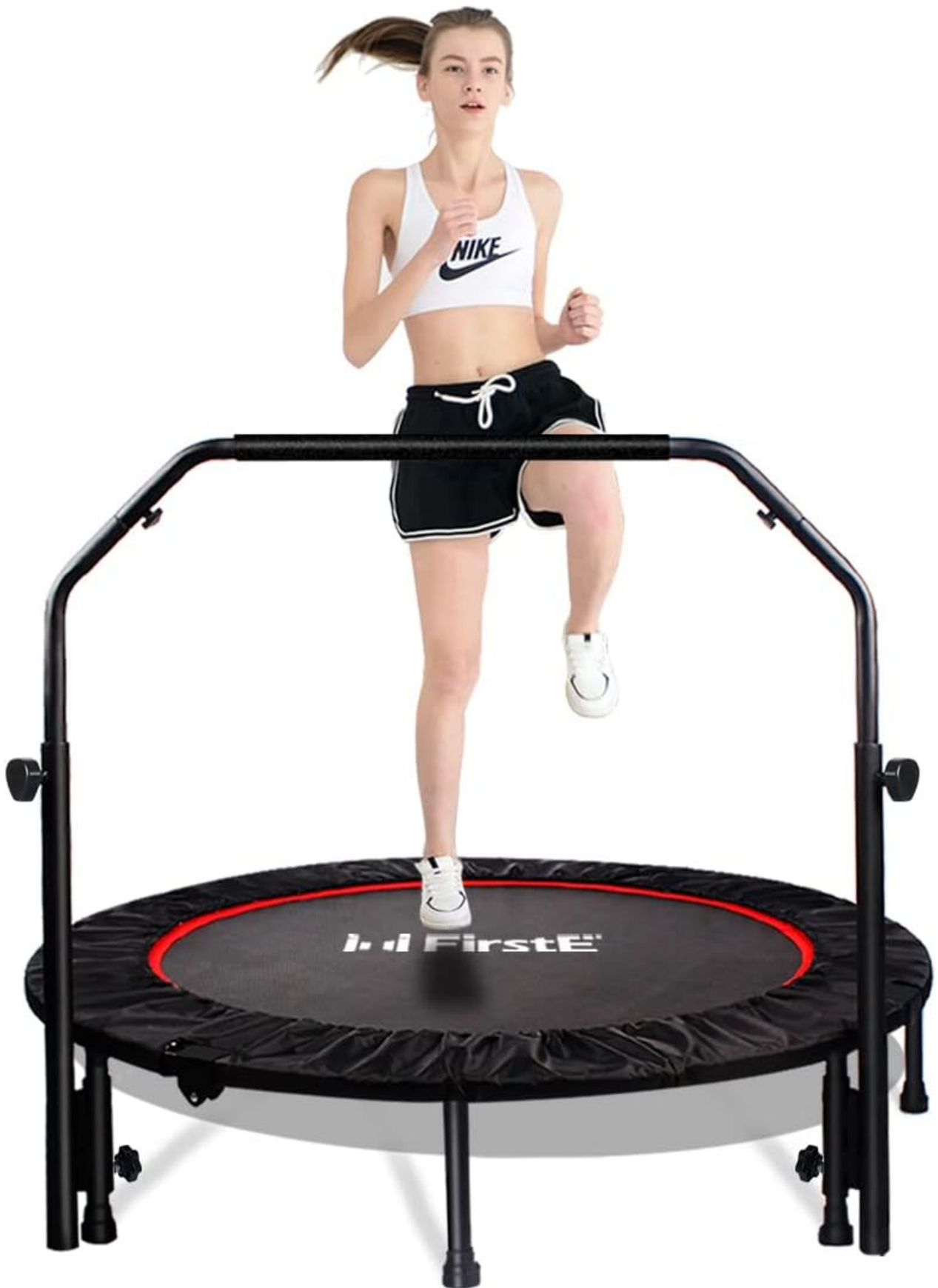
Image: The FirstE 48" Foldable Fitness Trampoline in its fully assembled state, featuring a black jumping mat with red trim and an adjustable foam handrail.