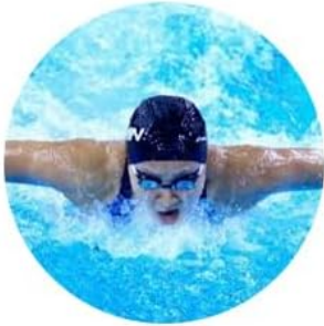
20 Minutes Swimming