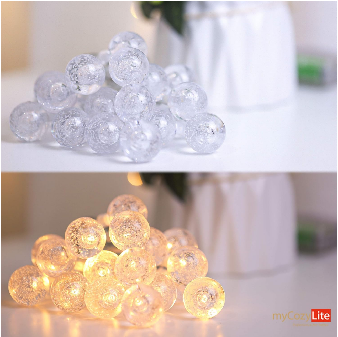
Image: A pile of crystal globe lights, showing their appearance when unlit and when illuminated with warm white light.