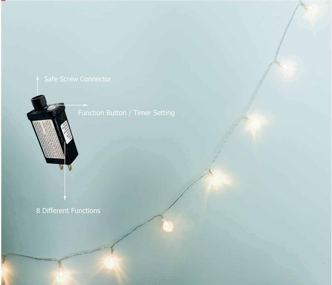
Image: The plug-in transformer with the function button and safe screw connector for extending the lights.

IP44 Class waterproof plug string lights, indoor and outdoor compatible