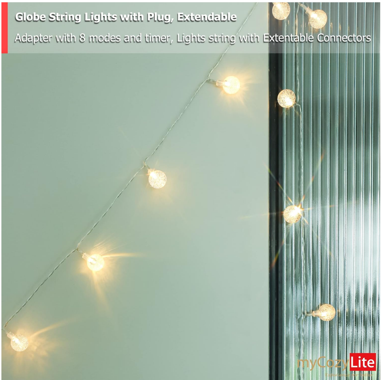
Image: myCozyLite LED String Lights draped across a room, providing warm illumination.

Adapter with 8 modes and timer, Lights string with Extentable Connectors