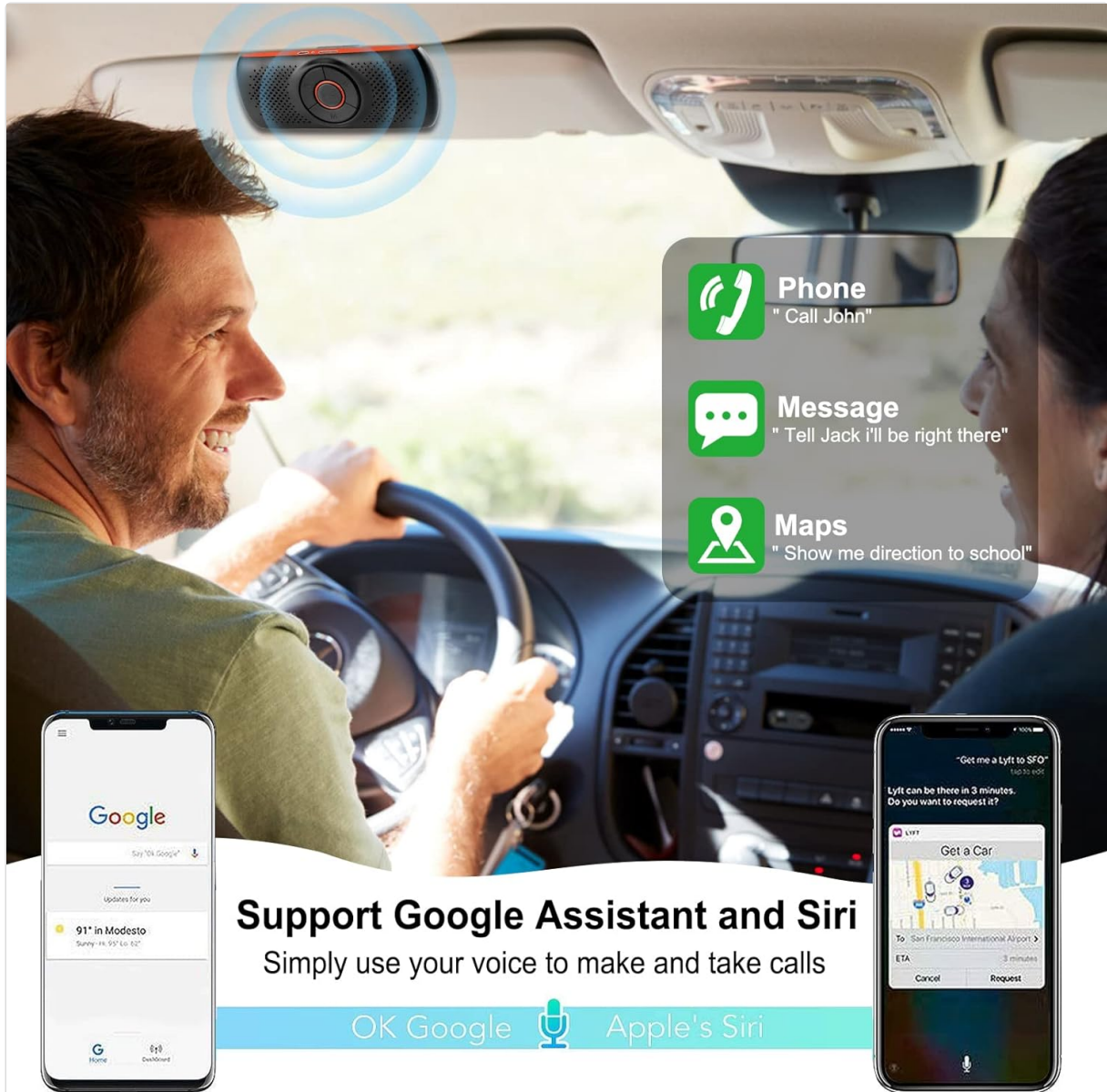
Image: Illustrates using voice commands with Google Assistant and Siri via the speakerphone.