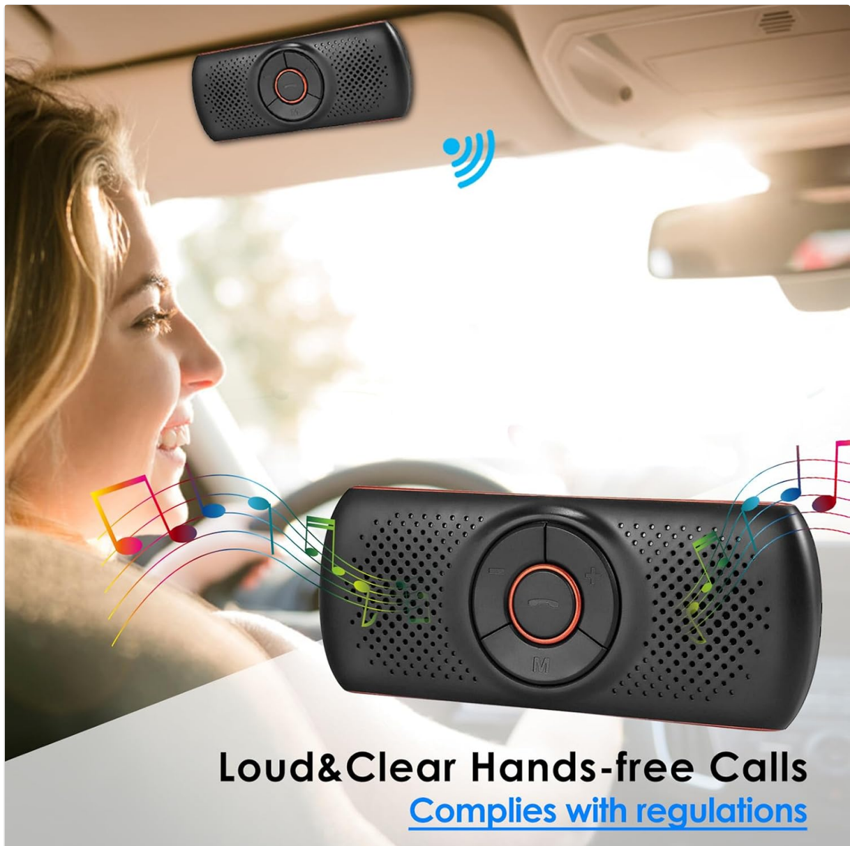
Image: Driver using the NETVIP Bluetooth Car Speaker for hands-free communication.