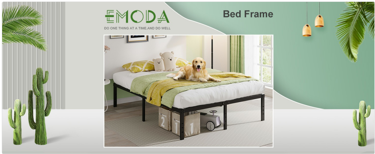
Image: Reinforced Structure for No Shake. Crafted from ultra-durable steel, this bed frame offers a strong and sturdy structure, ensuring long-lasting durability.