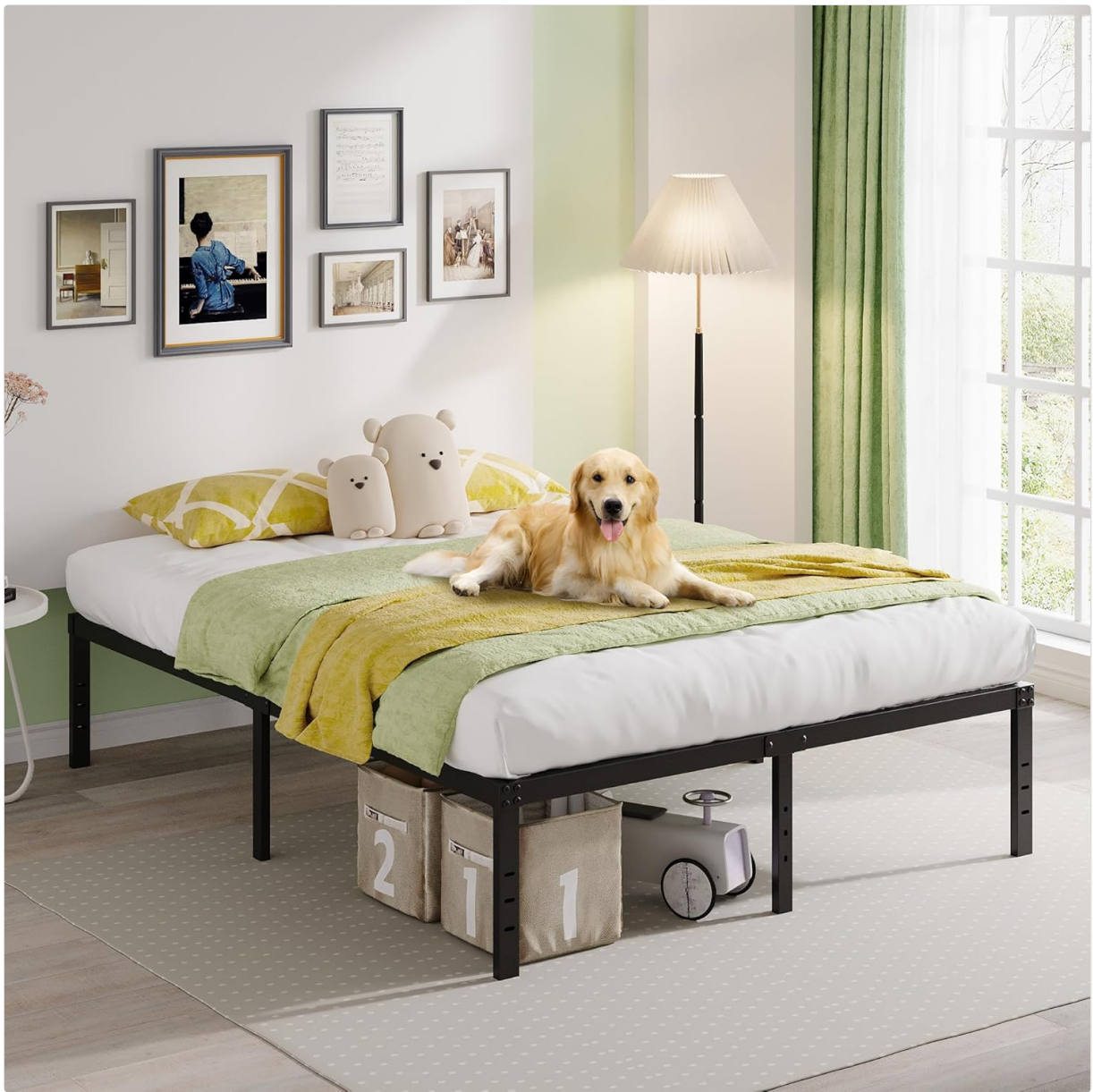
Image: The EMODA bed frame with a mattress, illustrating the generous under-bed storage capacity.