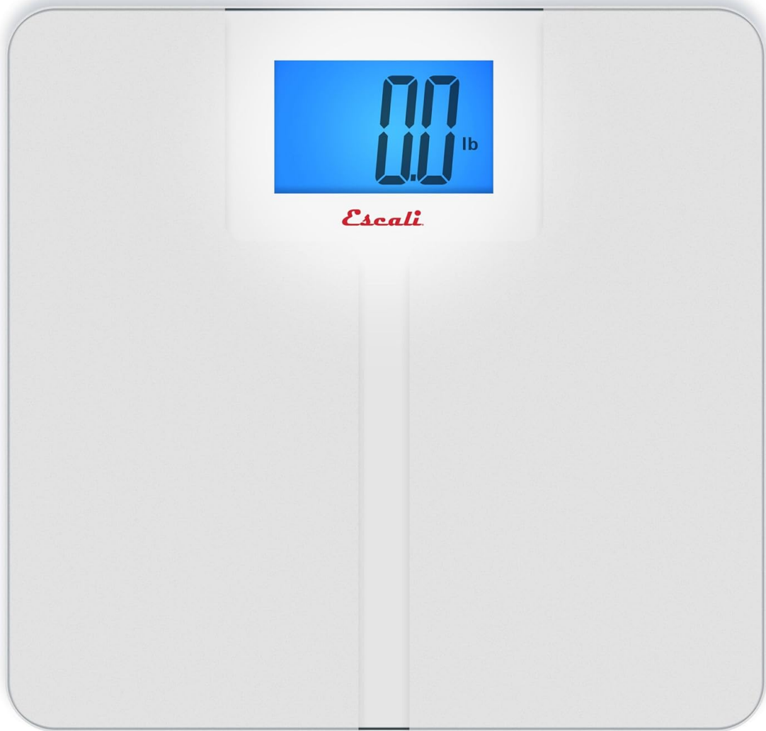
Angled view of the Escali High Capacity Digital Bathroom Scale, highlighting its sleek design and glass surface.