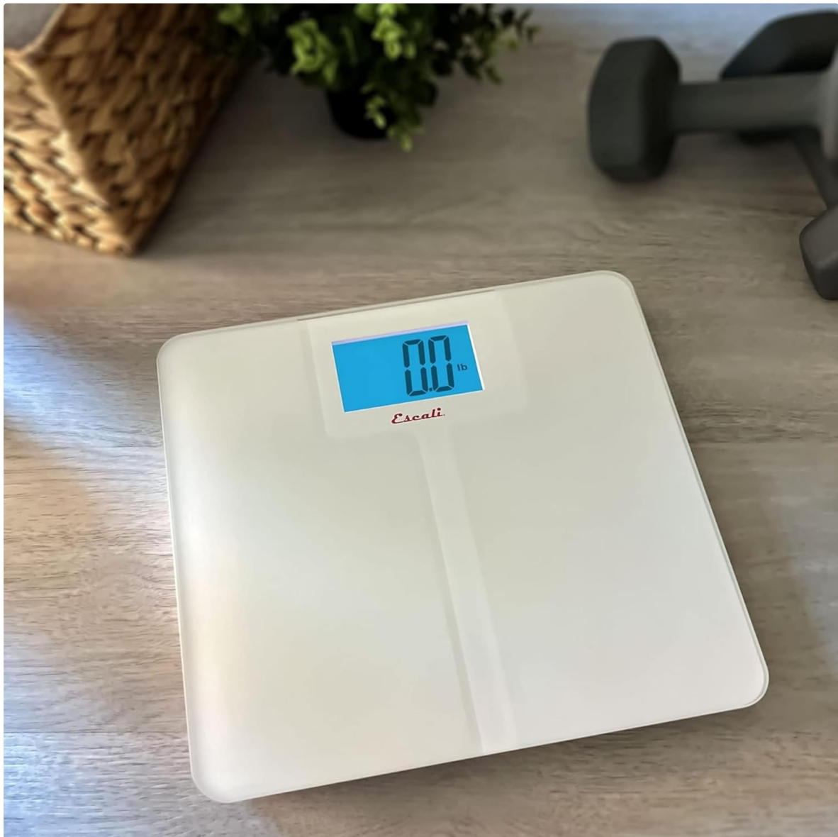
The Escali scale shown alongside fitness accessories like a dumbbell, emphasizing its role in health tracking.