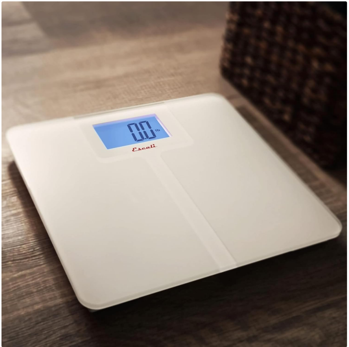
The Escali scale positioned on a wooden floor in a bathroom setting, demonstrating its aesthetic integration.