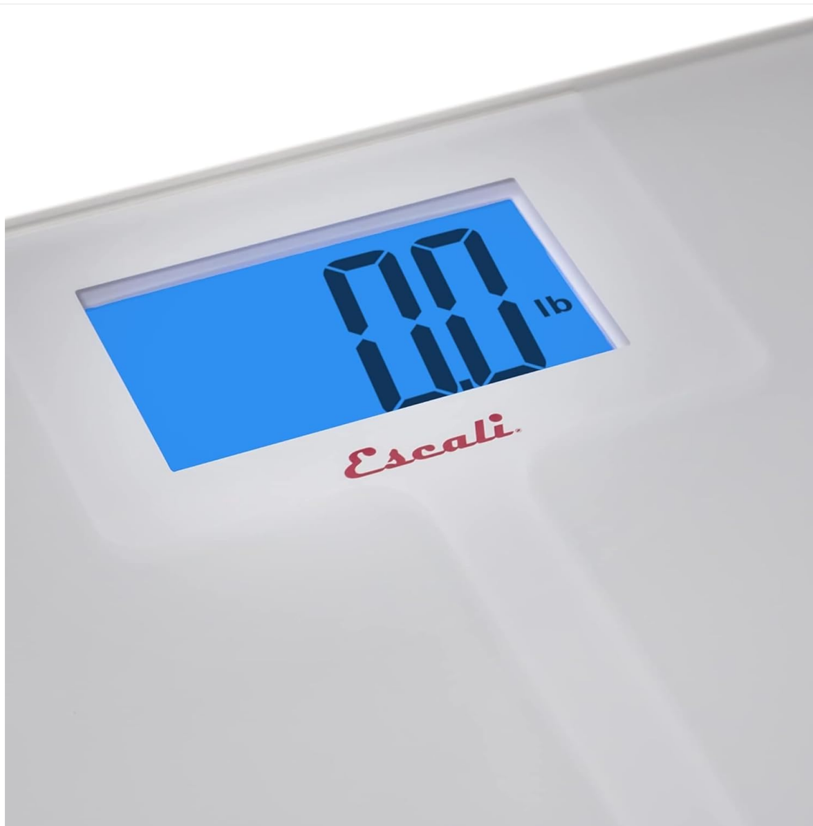
Close-up of the scale's digital display, showing the "0.0 lb" reading and the Escali logo.