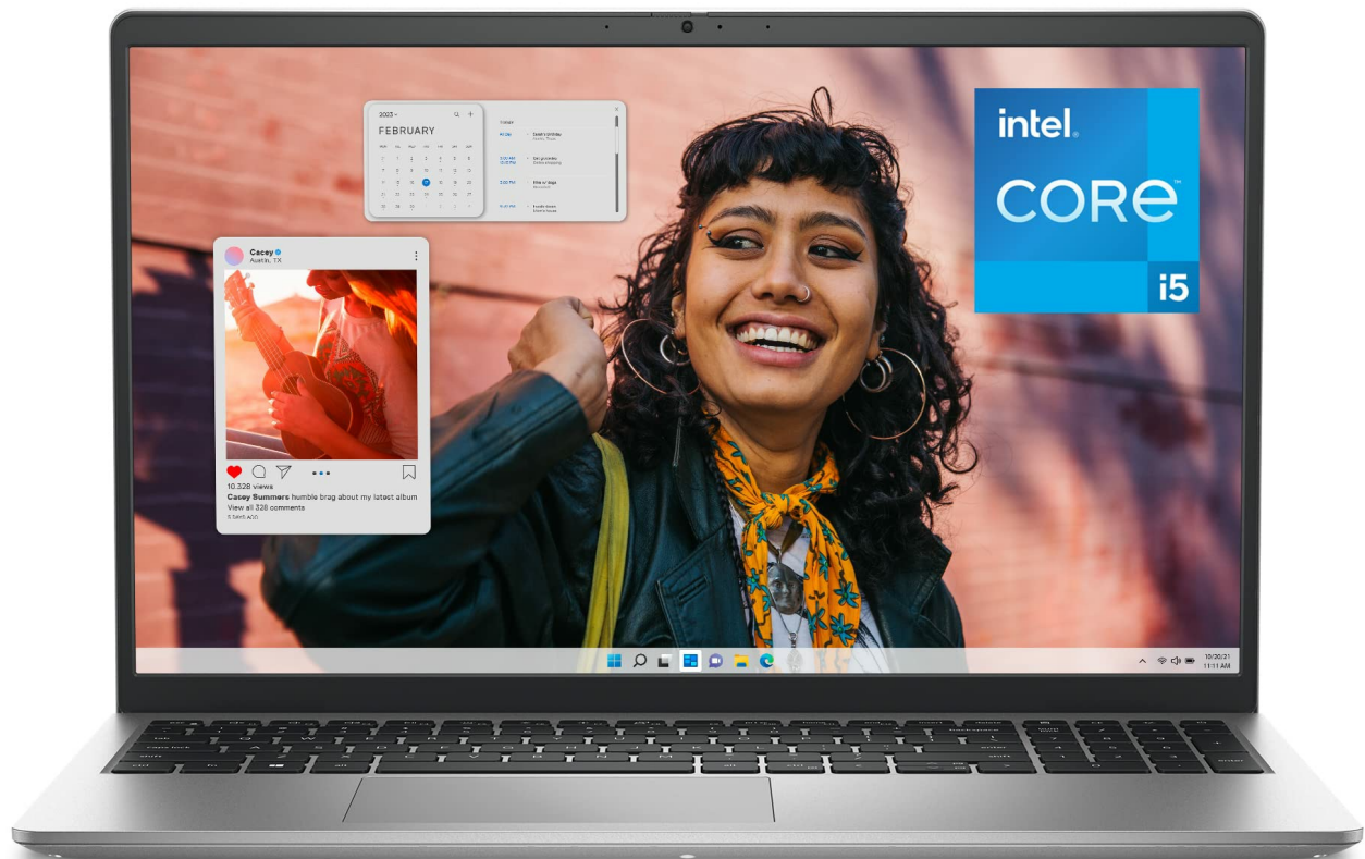
Figure 2.3: The Dell Inspiron 15 3530 Laptop in an open position, showcasing its sleek design and display. This image represents the laptop's adaptability in various usage scenarios.