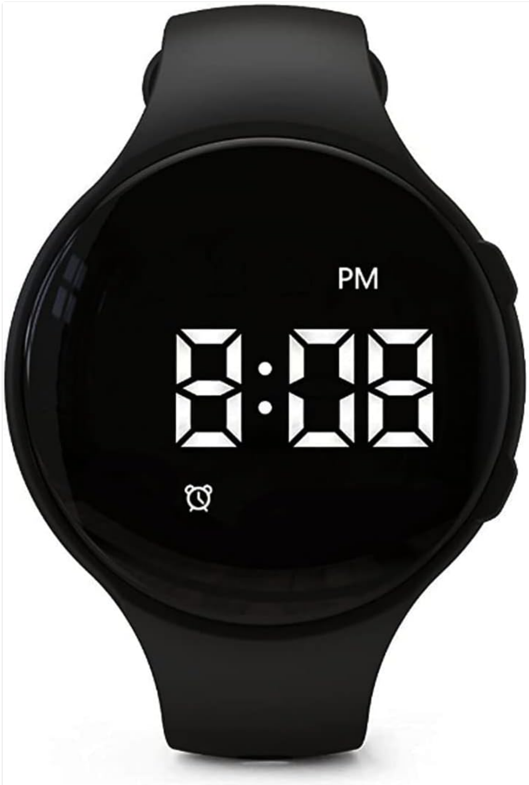
Figure 1: Front view of the e-vibra Vibrating Alarm Watch, showing the digital display with the time 8:08 PM and an alarm icon.