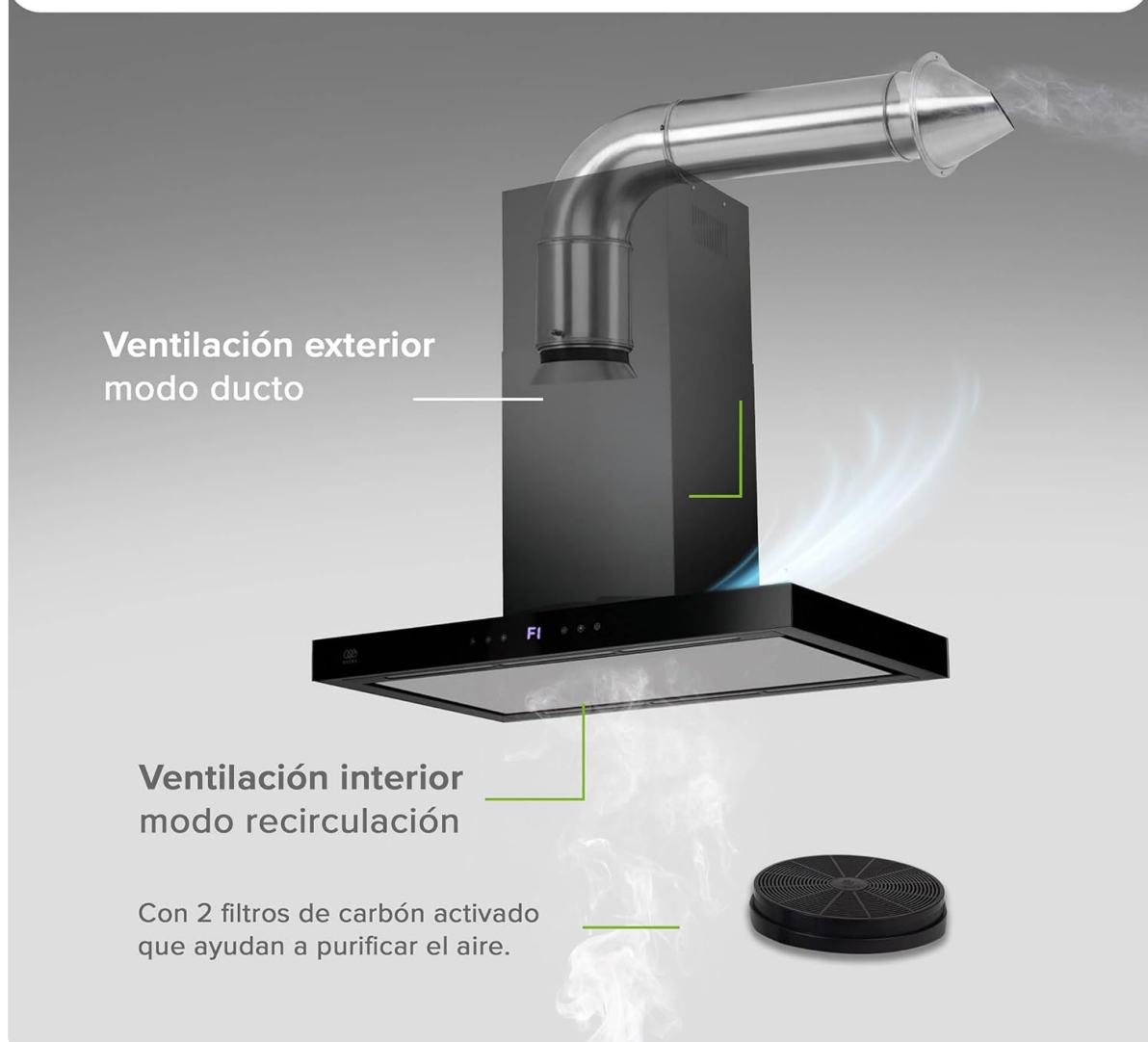
Image: Diagram illustrating the two ventilation modes for the AVERA range hood: exterior ventilation (duct mode) and interior ventilation (recirculation mode) with activated carbon filters for air purification.