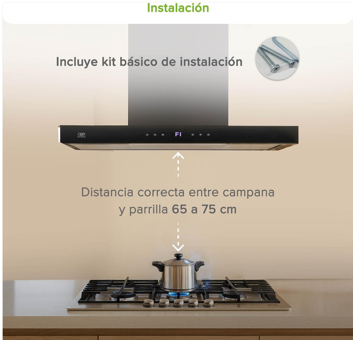
Image: Illustration showing the recommended installation distance of 65 to 75 cm between the AVERA CEN90B island range hood and the cooking range below it. A basic installation kit is also shown.