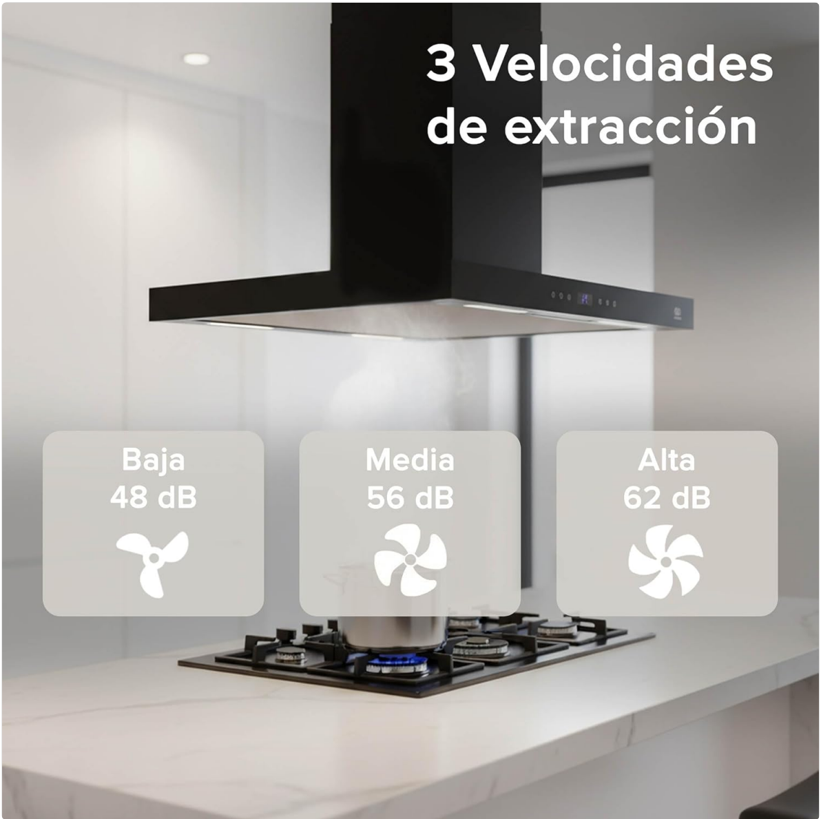
Image: Diagram illustrating the three extraction speeds of the AVERA CEN90B: Low (48 dB), Medium (56 dB), and High (62 dB), shown above a cooking range.