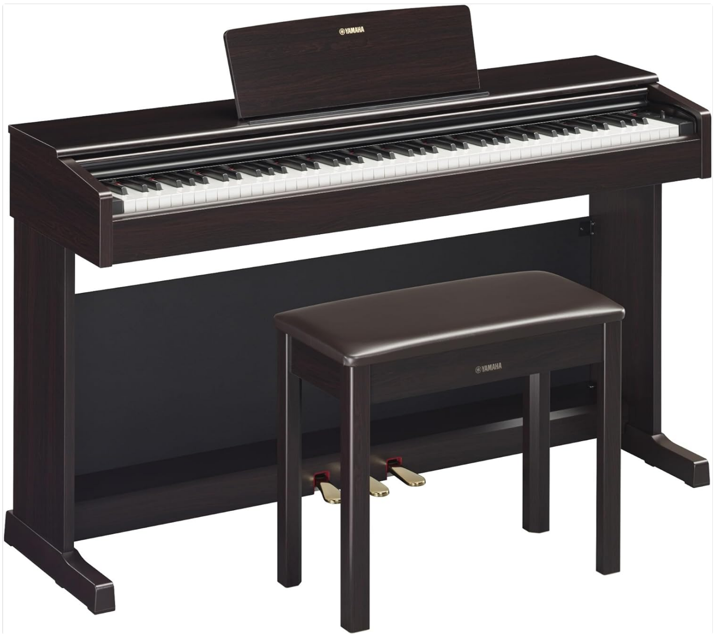
Figure 2.1: The Yamaha Arius YDP-145 Digital Piano in Dark Rosewood, fully assembled with its matching bench.