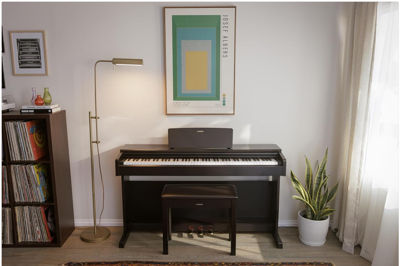
Figure 2.2: The YDP-145 integrated into a home environment, showcasing its classic upright design.