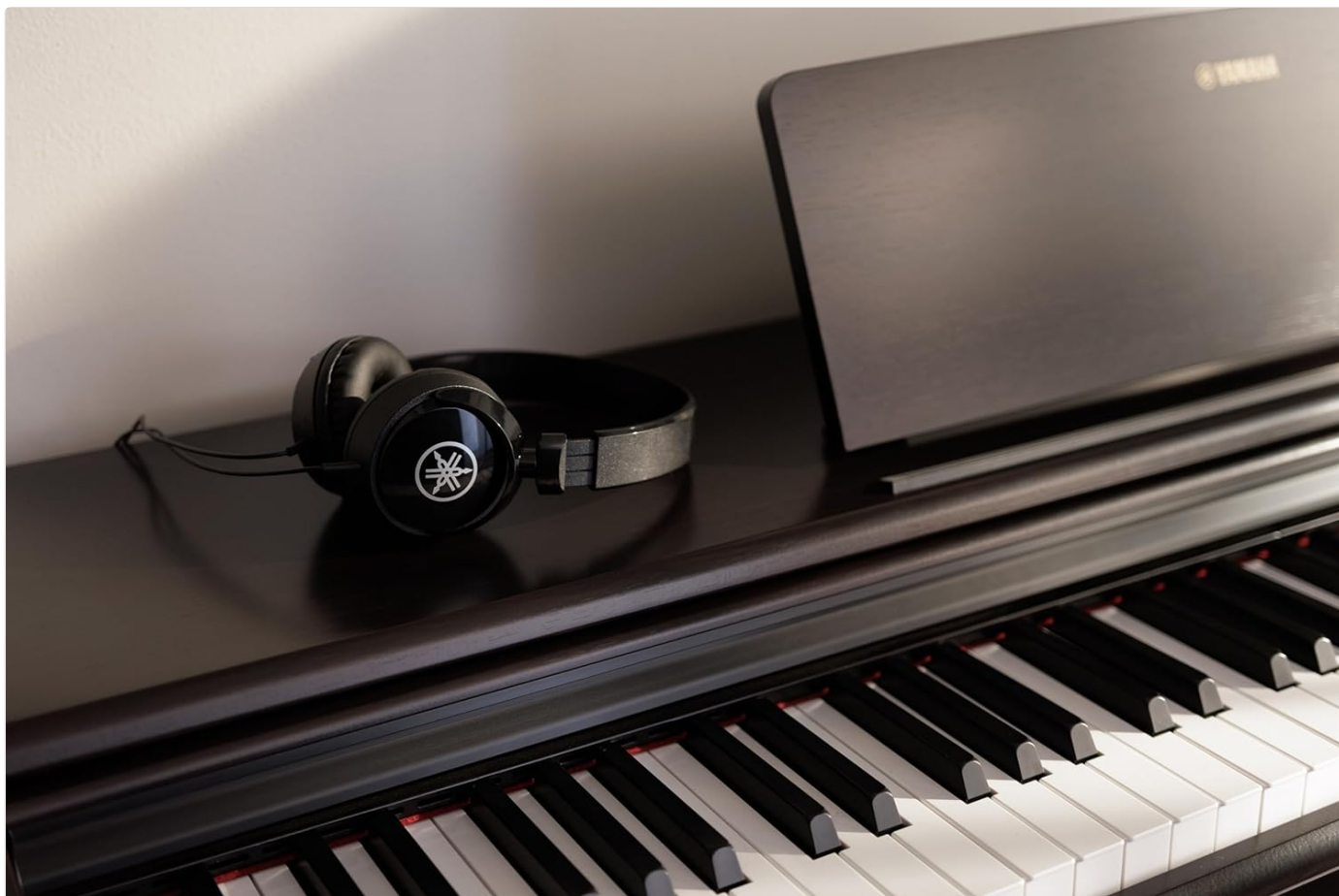
Figure 3.3: Headphones on the piano, indicating the option for private practice.