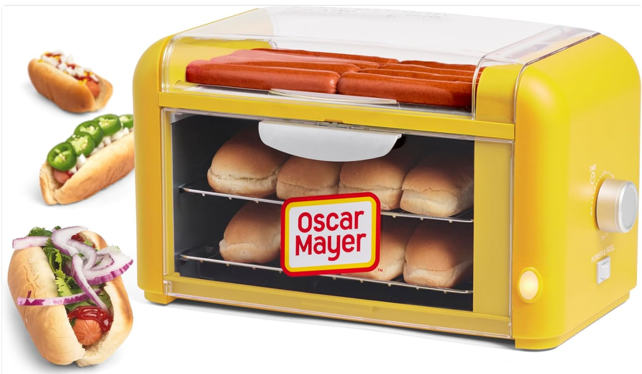
Nostalgia Oscar Mayer Hot Dog Roller and Bun Toaster Oven in yellow, with hot dogs cooking on top and buns warming below. Three prepared hot dogs with various toppings are shown on the left.

The Nostalgia Oscar Mayer Extra Large Countertop 8 Hot Dog Roller and Bun Toaster Oven provides a convenient and enjoyable way to prepare hot dogs and warm buns. This appliance is designed for ease of use, featuring five stainless steel grill rollers for cooking hot dogs and two non-stick warming racks for buns, all controlled by an adjustable timer.