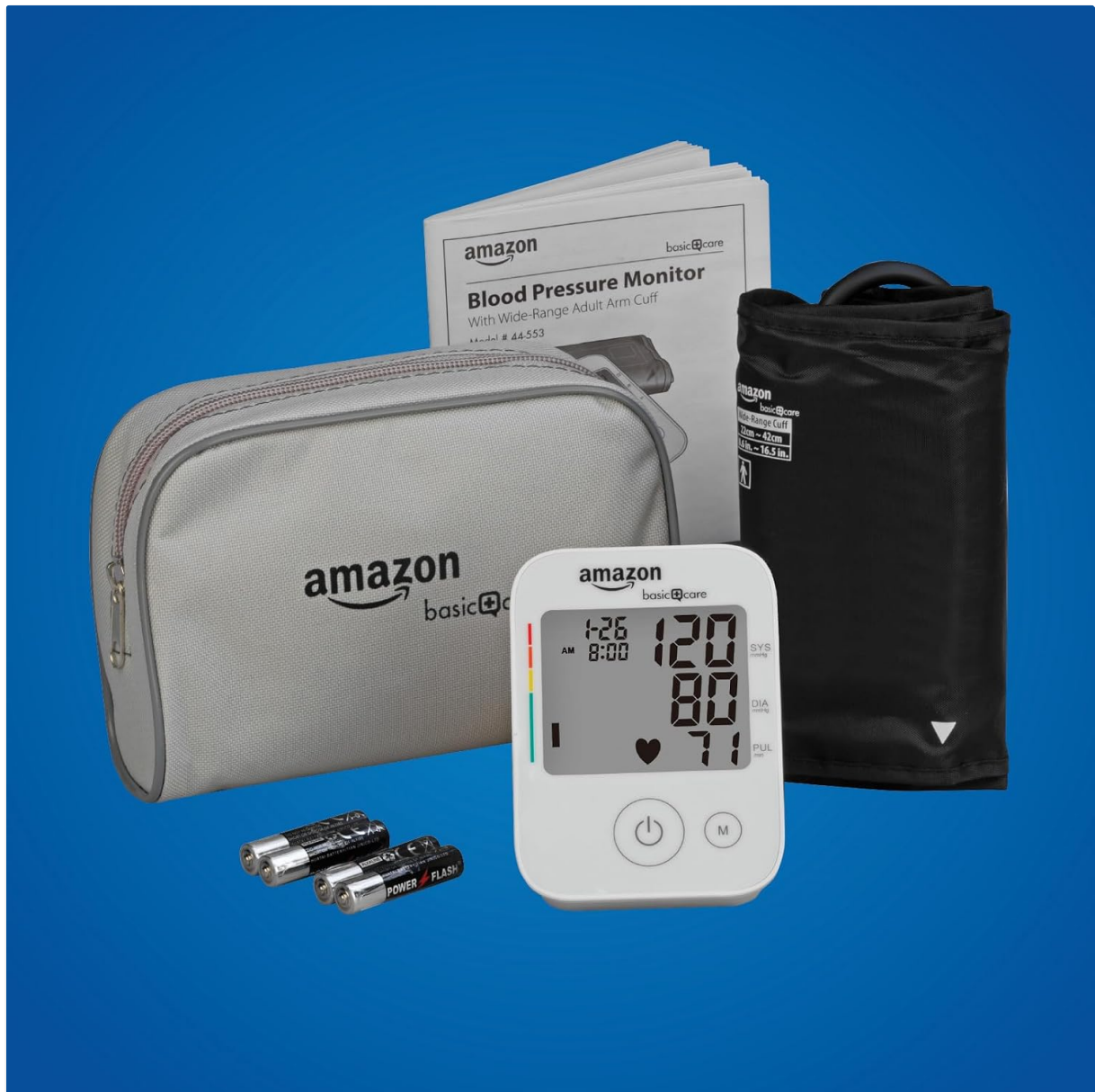
Image: Contents of the Amazon Basic Care Blood Pressure Monitor package, including the monitor, arm cuff, batteries, and storage case.