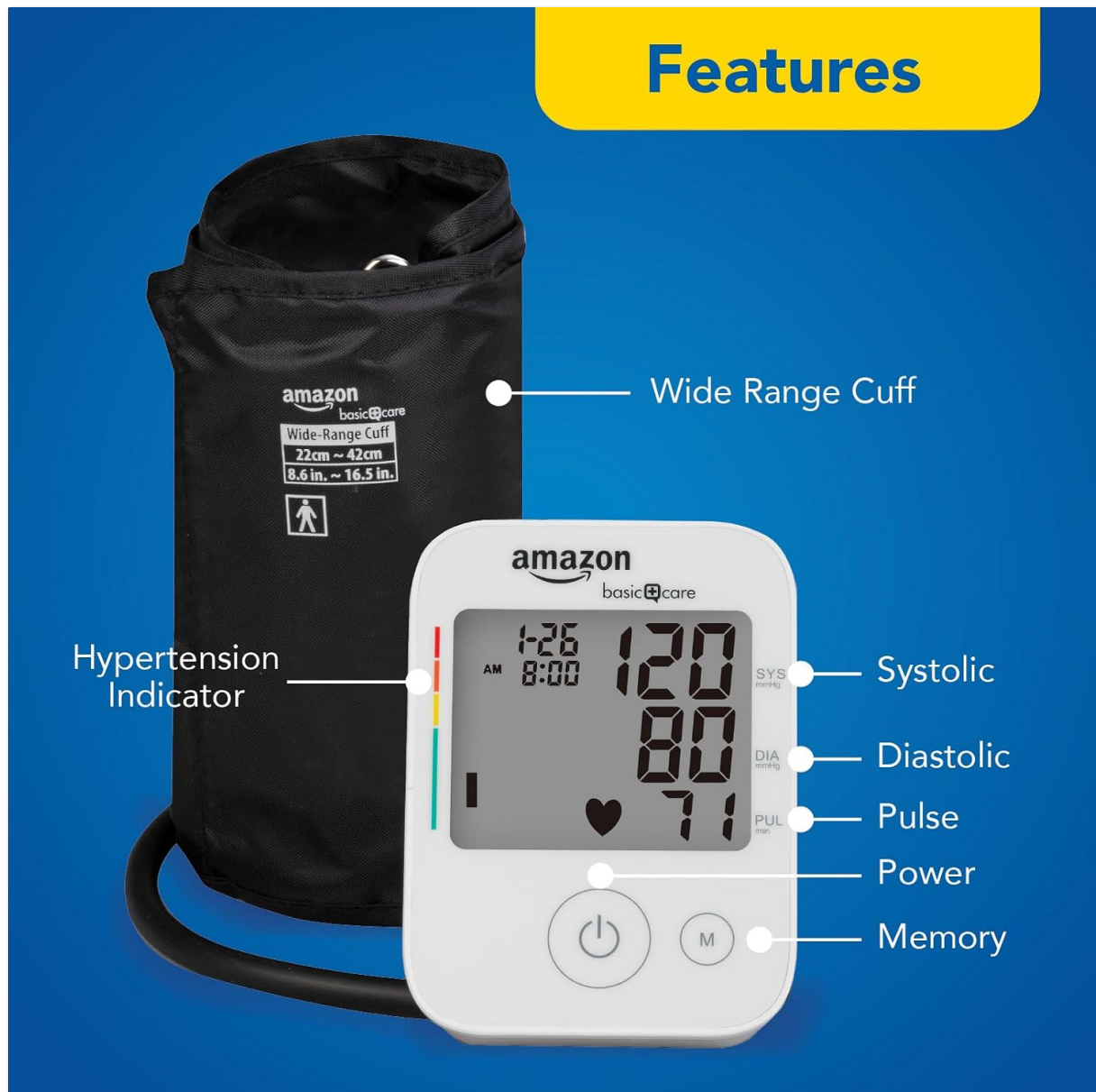
Image: Key features and display elements of the blood pressure monitor.