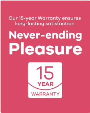
Image: Satisfyer's 15-year warranty statement.

Satisfyer offers a 15-year warranty on the Double Flex, ensuring long-lasting satisfaction and product quality. For warranty claims, technical support, or any inquiries regarding your Satisfyer Double Flex, please contact Satisfyer customer service through their official website or the contact information provided in your product packaging.