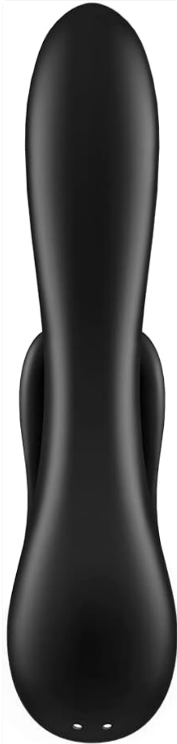
Image: The underside of the Satisfyer Double Flex, highlighting the magnetic charging contacts.