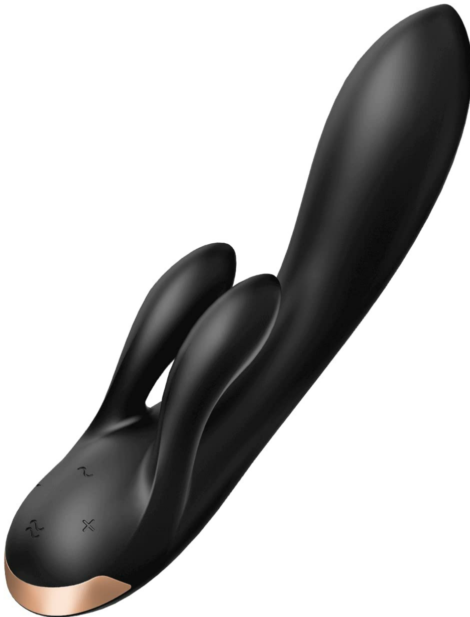
Image: The Satisfyer Double Flex vibrator, showcasing its flexible design and app compatibility.