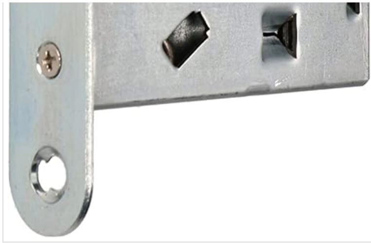
Figure 3: A detailed side view of the mortise lock, highlighting the faceplate and the latch mechanism.