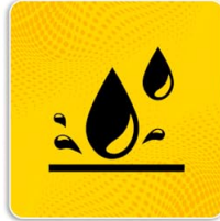
Image: An icon representing water resistance, indicating the neckband's ability to withstand splashes.