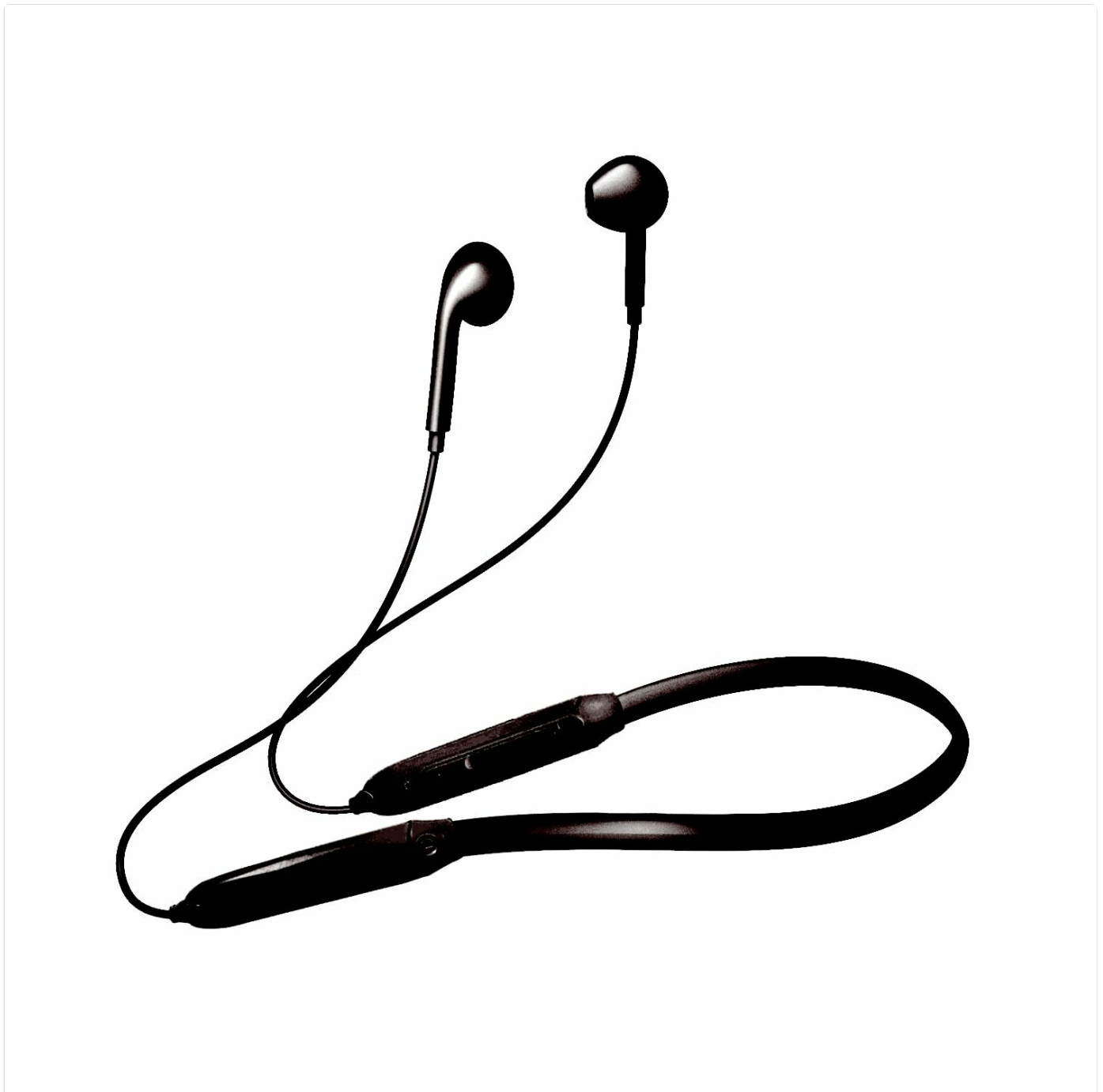
Image: The DUDAO U5B Wireless Bluetooth Neckband, showcasing its design with earbuds and neckband.