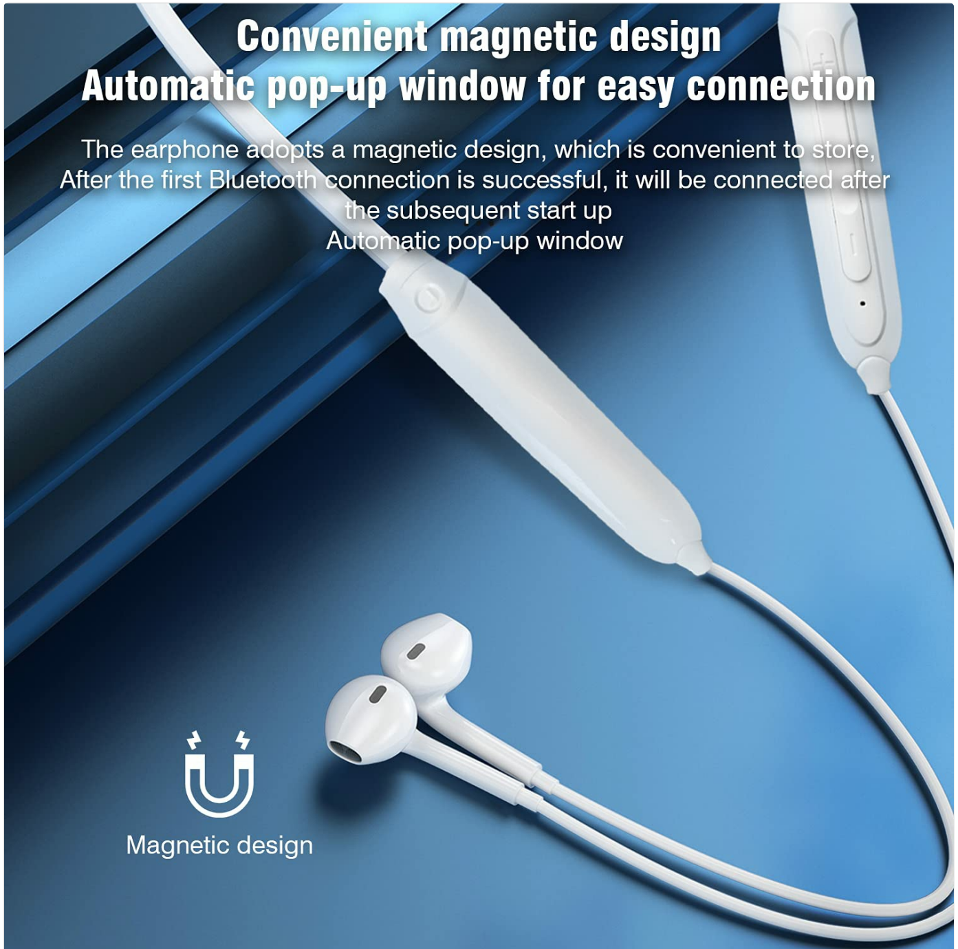
Image: Close-up of the DUDAO U5B neckband highlighting its magnetic design for convenient storage and automatic connection feature.

The neckband features a convenient magnetic design for easy connection. After the initial successful Bluetooth connection, it will automatically connect to your device upon subsequent power-ups if Bluetooth is enabled on your device.