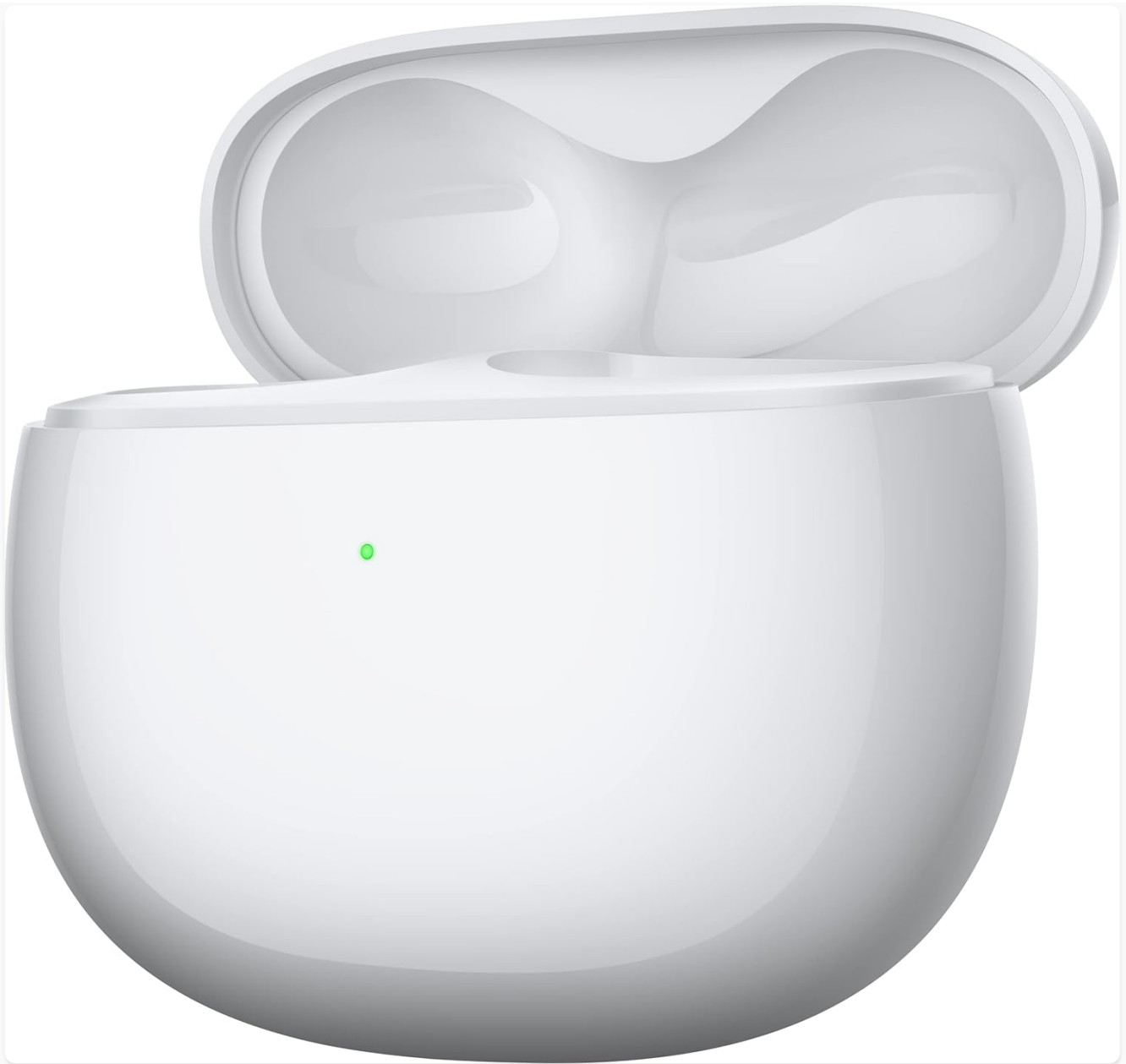
Image: The open white charging case for Xiaomi Buds 3, showing the internal compartments for the earbuds and the charging indicator light.