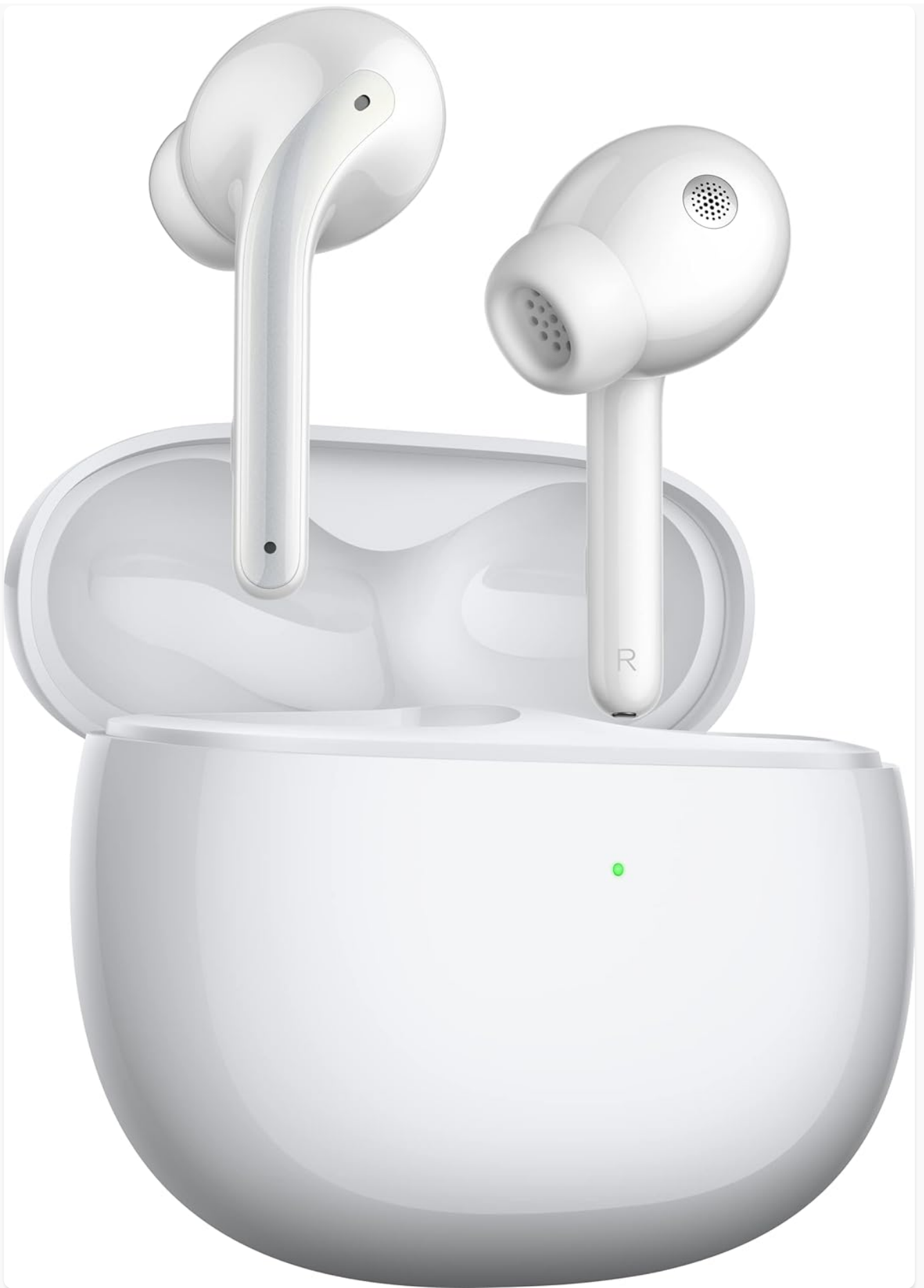
Image: Xiaomi Buds 3 earbuds resting in their open white charging case, displaying the left and right earbuds clearly.