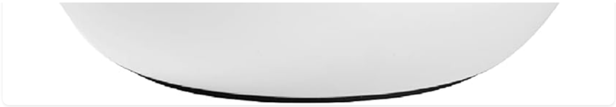
Image 1: Front view of the LINTRO Waterless Portable Essential Oil Diffuser, showing the power button and indicator lights.