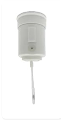
Image 3: Close-up view of the diffuser head with the oil pipe, which draws essential oil from the bottle.