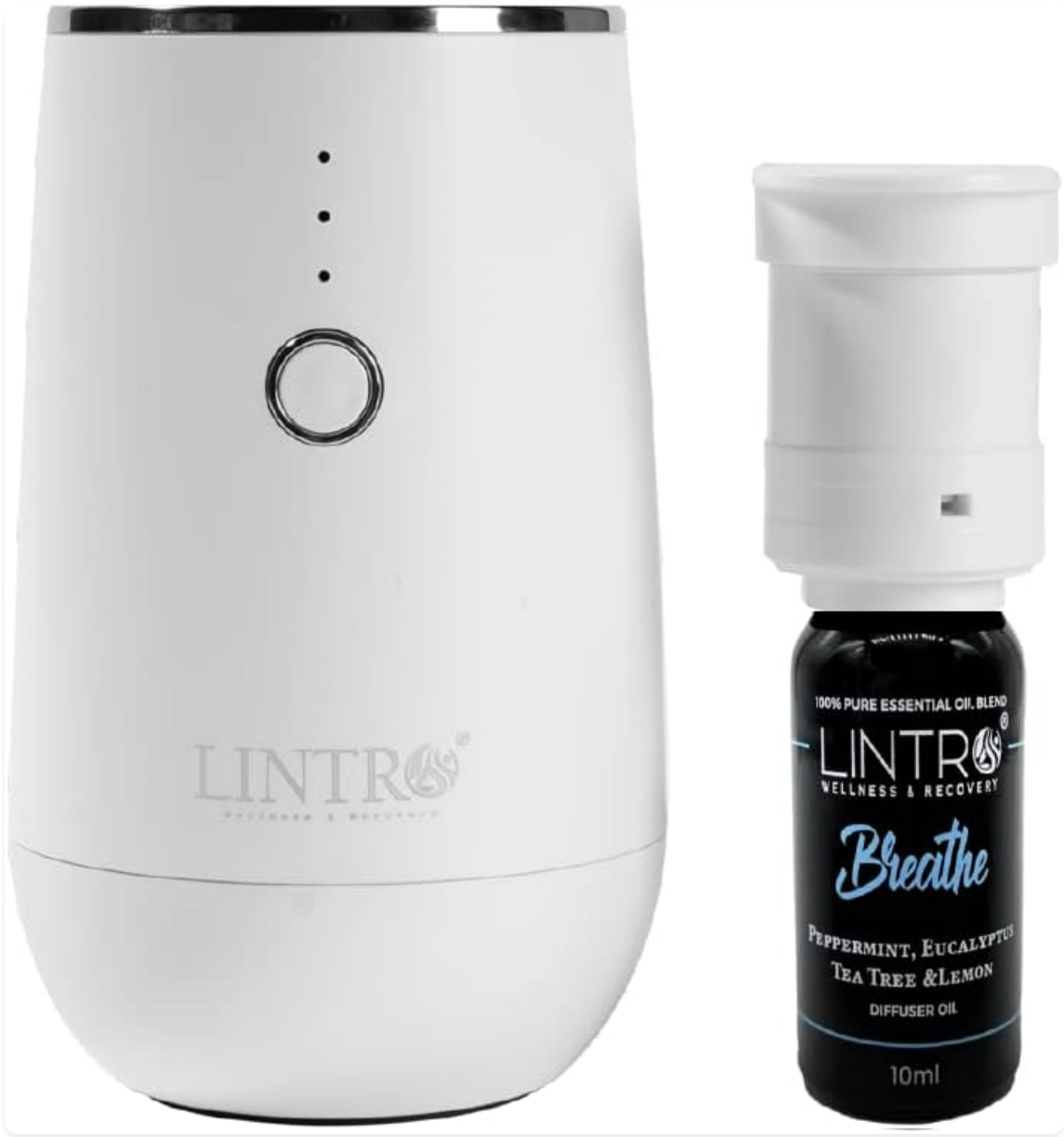
Image 2: The LINTRO diffuser alongside an essential oil bottle, demonstrating how the bottle attaches to the device.