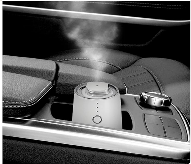
Image 4: The LINTRO diffuser shown fitting into a car cup holder and packed for travel, highlighting its portability.