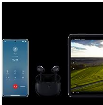
Figure 4.2: Dual-Device Connection

The Xiaomi Buds 3 can be connected to two Bluetooth devices simultaneously. This allows for seamless audio switching between, for example, your smartphone and a laptop without needing to manually disconnect and reconnect.