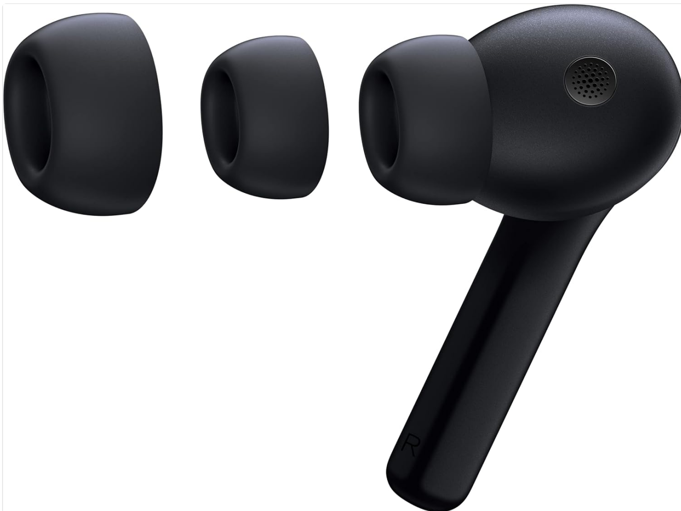
Figure 3.4: Included Ear Tips

Experiment with the different ear tip sizes (S, M, L) to find the most comfortable and secure fit for your ears.