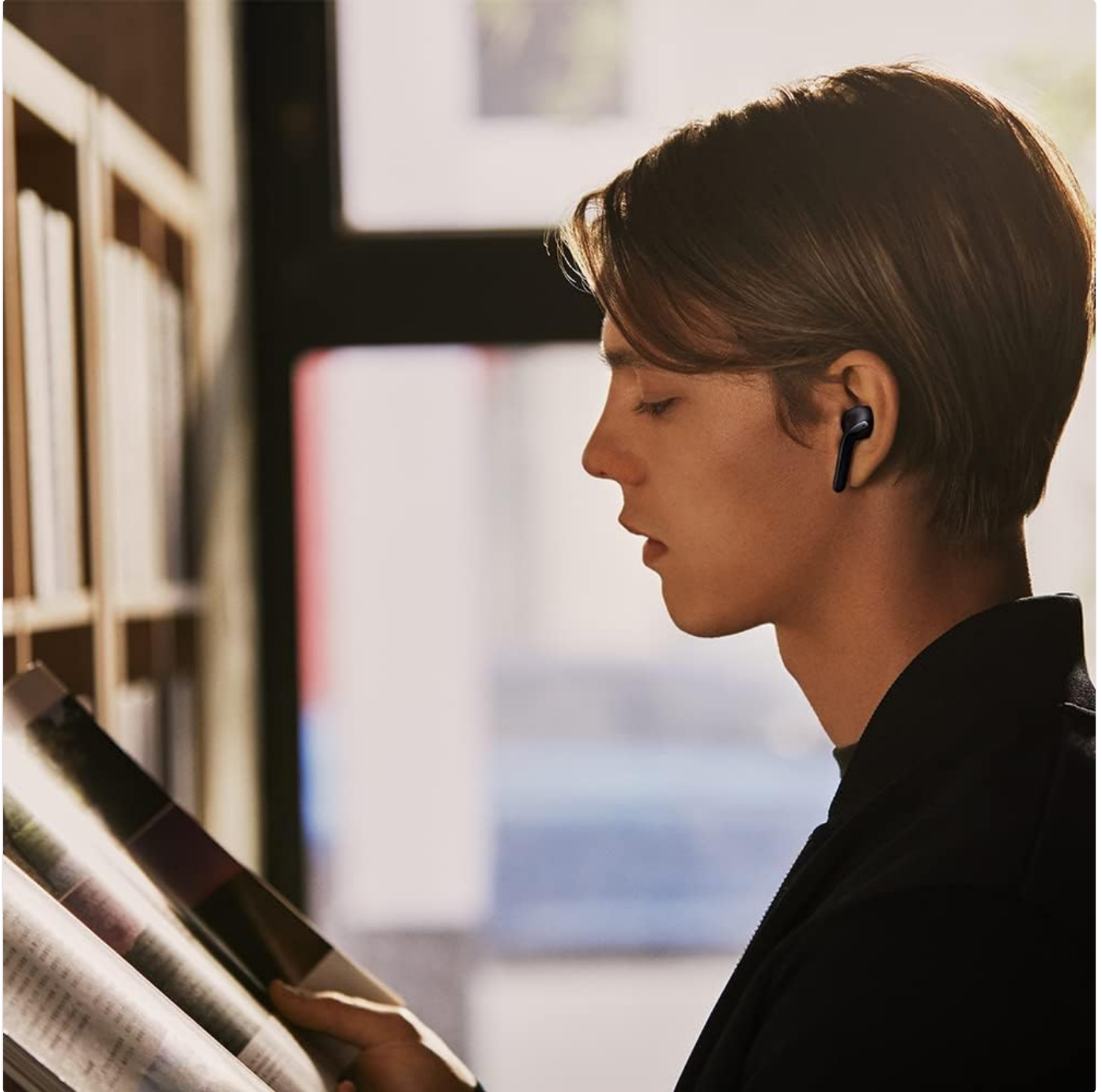
Figure 3.3: Proper Earbud Fit

Choose the ear tips that provide the best seal and comfort. Gently insert the earbuds into your ear canal and rotate them slightly until they fit snugly and securely.