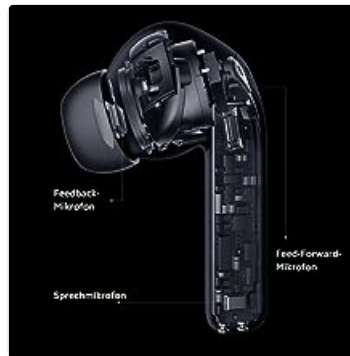
Figure 4.1: Microphone System for ANC and Calls

Switch between these modes by long-pressing the earbud stem.