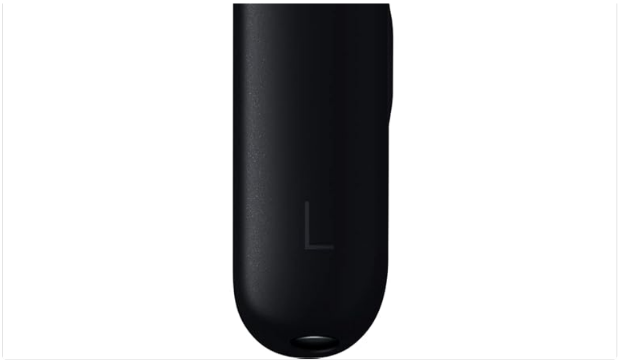
Figure 5.1: IP55 Water Resistance

The IP55 rating provides protection against sweat and light splashes, making the earbuds durable for active use.