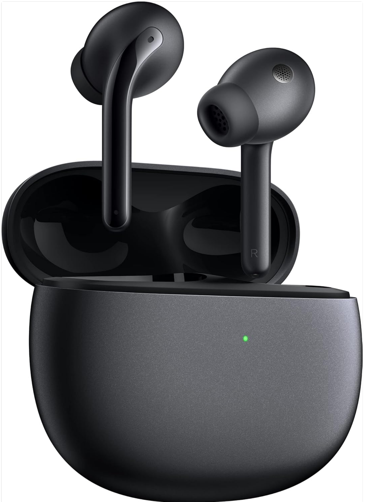
Figure 1.1: Xiaomi Buds 3 Earbuds and Charging Case

The Xiaomi Buds 3 come with a sleek charging case that protects and recharges the earbuds. The earbuds are designed for a comfortable and secure fit.