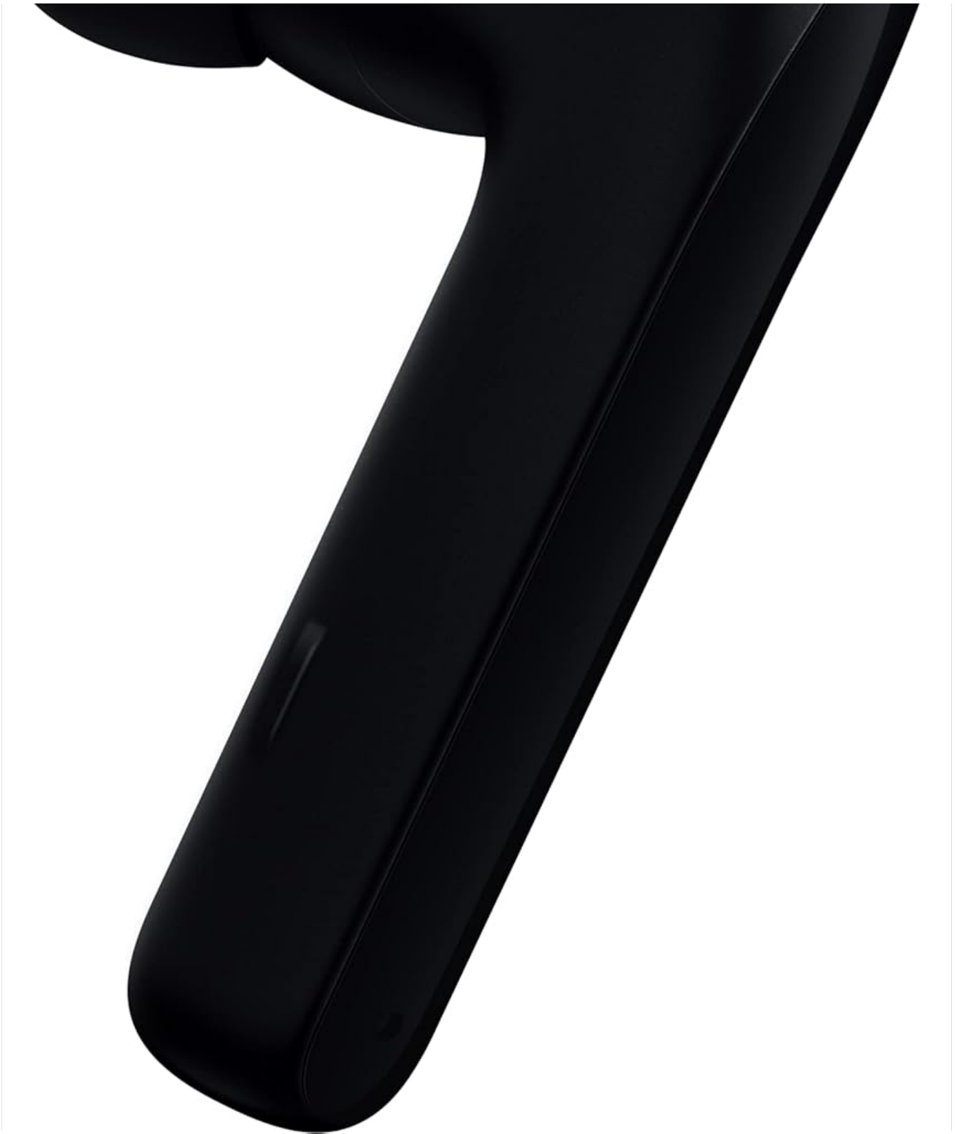
Figure 3.1: Charging Indicator Light

The LED indicator on the charging case will show the charging status. A solid light indicates charging, and it will turn off when fully charged.