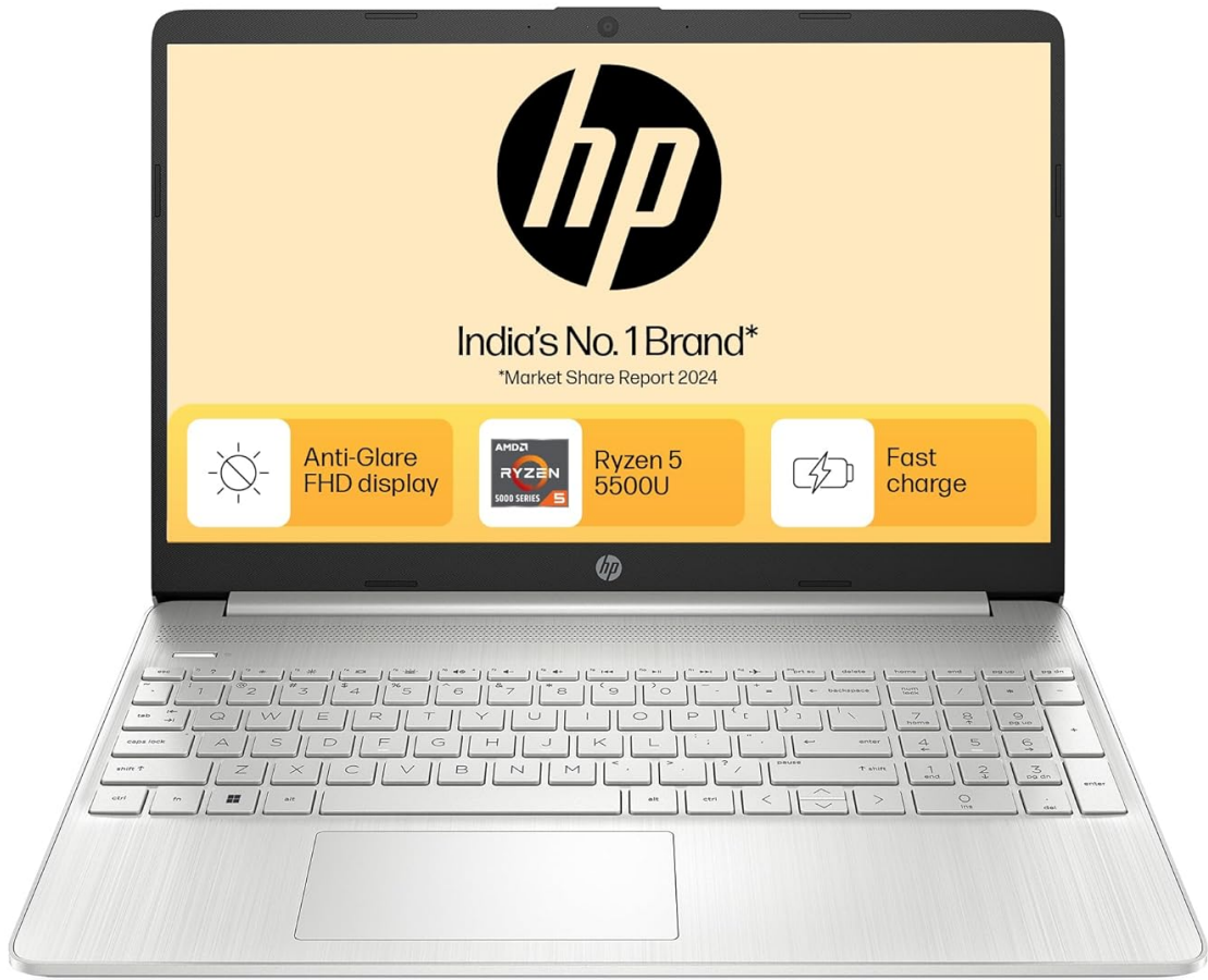
Image: Front view of the HP 15s laptop, highlighting its anti-glare FHD display, AMD Ryzen 5 5500U processor, and fast charge capability.