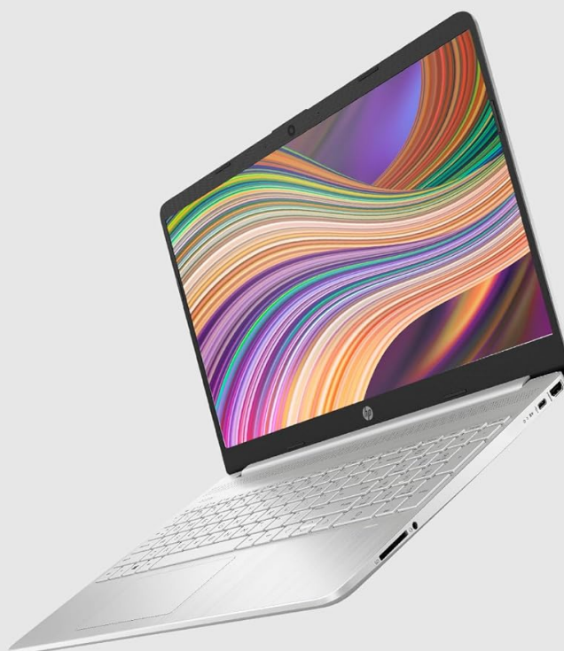
Image: Side view of the HP 15s laptop alongside a list of its core specifications including AMD Ryzen 5 5500U Processor, AMD Radeon Graphics, 8GB Memory, 512GB SSD Storage, Windows 11, Office 21, and Dual Speakers.