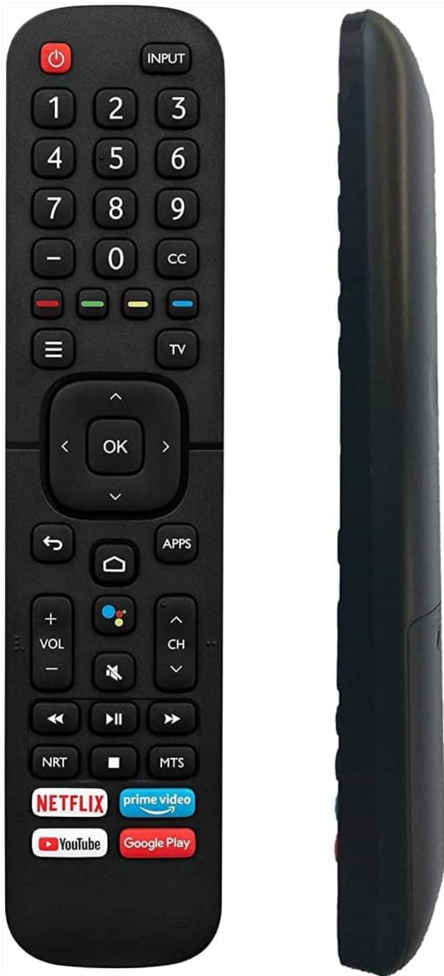
Image 1: Front and side view of the USARMT Universal Remote Control. The remote is black with various buttons for power, numbers, navigation, volume, channel, and dedicated app buttons for Netflix, Prime Video, YouTube, and Google Play.