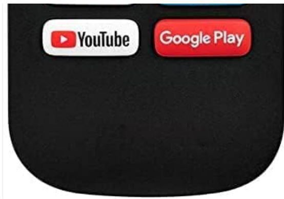
Image 2: Front view of the USARMT Universal Remote Control, highlighting the button layout. Key buttons include Power (red), Input, Number Pad (0-9), Navigation (Up, Down, Left, Right, OK), Volume Up/Down, Channel Up/Down, and quick access buttons for Netflix, Prime Video, YouTube, and Google Play.