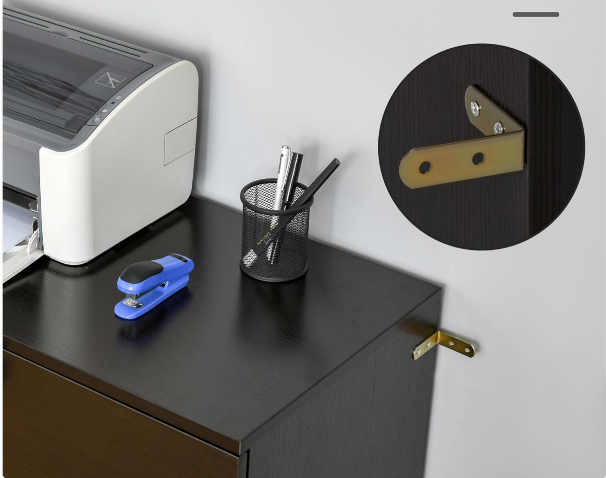
Image: An illustration of the file cabinet's main frame being assembled, showing the connection points for side and back panels.

Ensure stability while sliding out the drawer