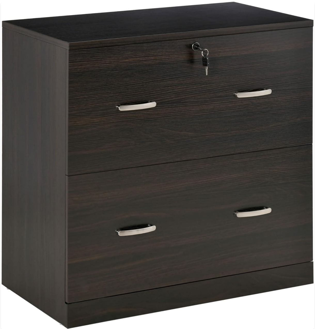
Image: The Vinsetto 2-Drawer File Cabinet, featuring two drawers and a top lock, presented in a walnut finish.