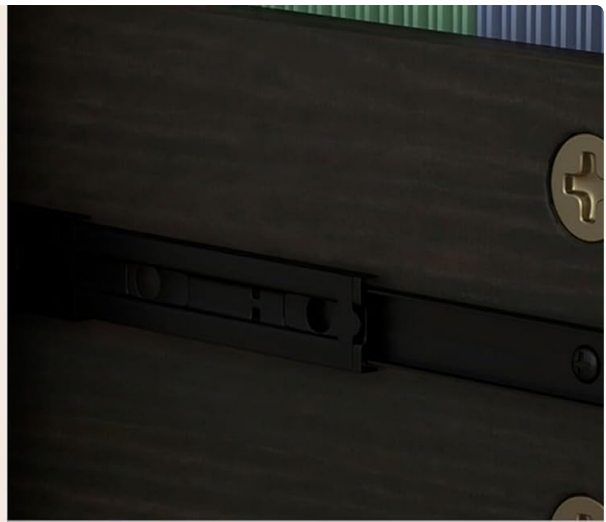
Smooth Slide Rails