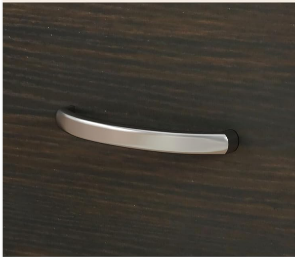
Convenient Metal Handle