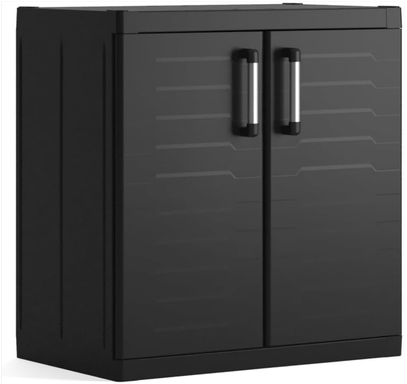
Figure 4.1: Front view of the assembled Keter Detroit XL Low Storage Cabinet.