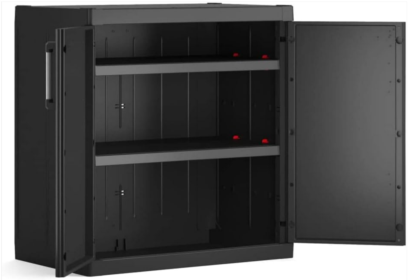
Figure 4.2: Interior view of the cabinet with doors open, highlighting the two adjustable shelves.