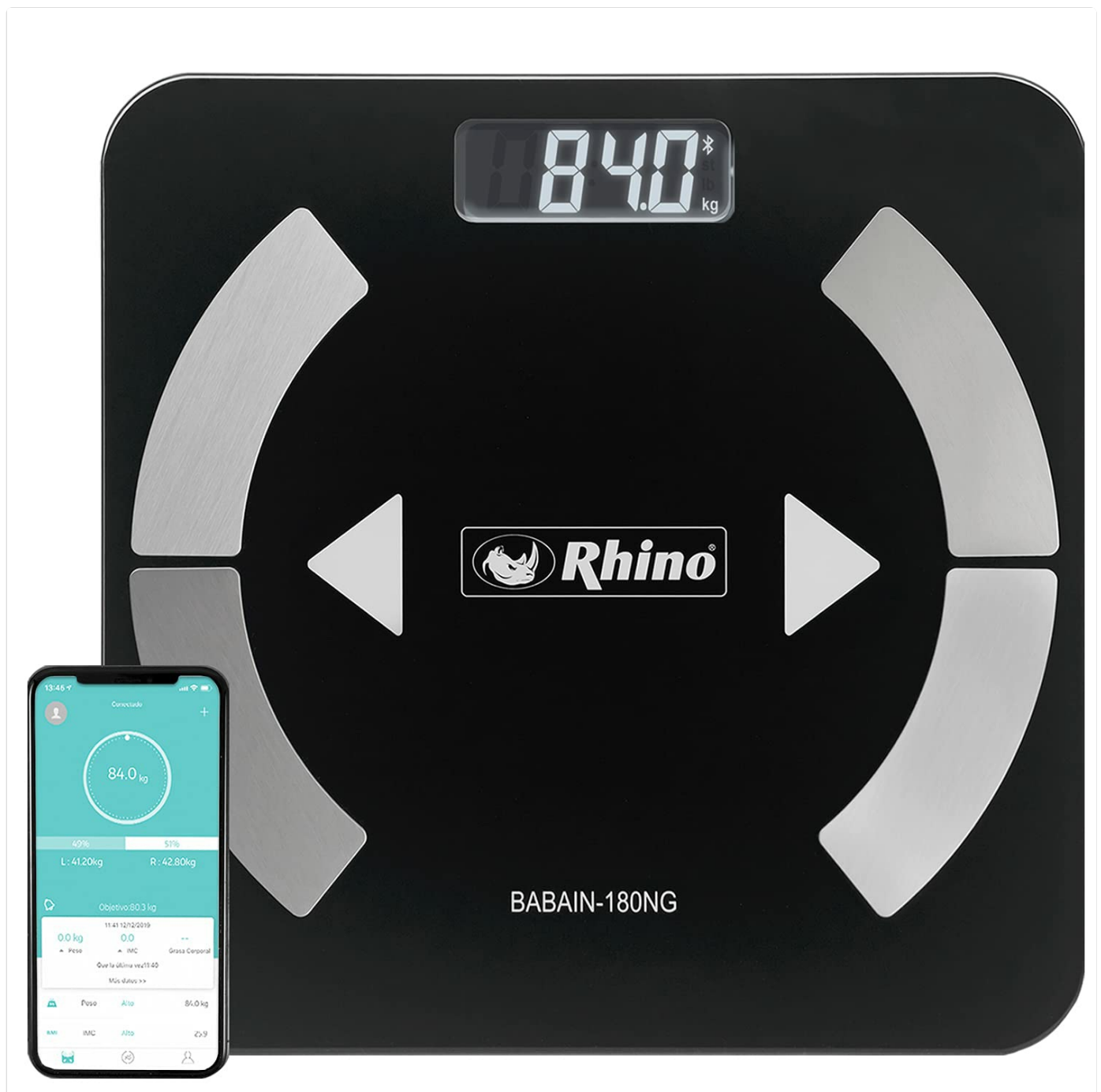
Figure 1: RHINO Smart Scale (Model BABAIN-180NG) and Fitdays App Interface.