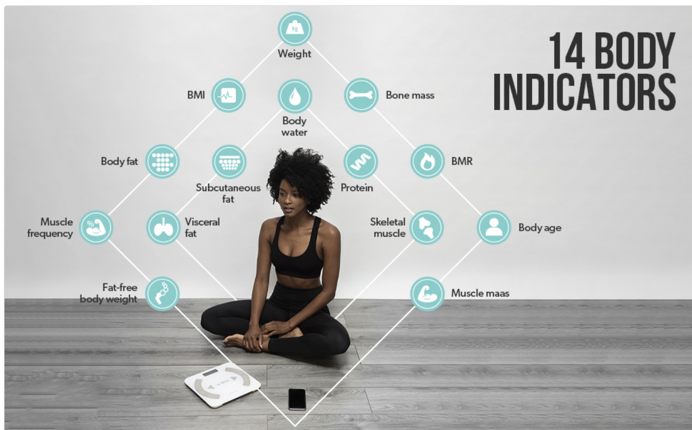
Figure 2: Overview of the 14 Body Indicators tracked by the scale.