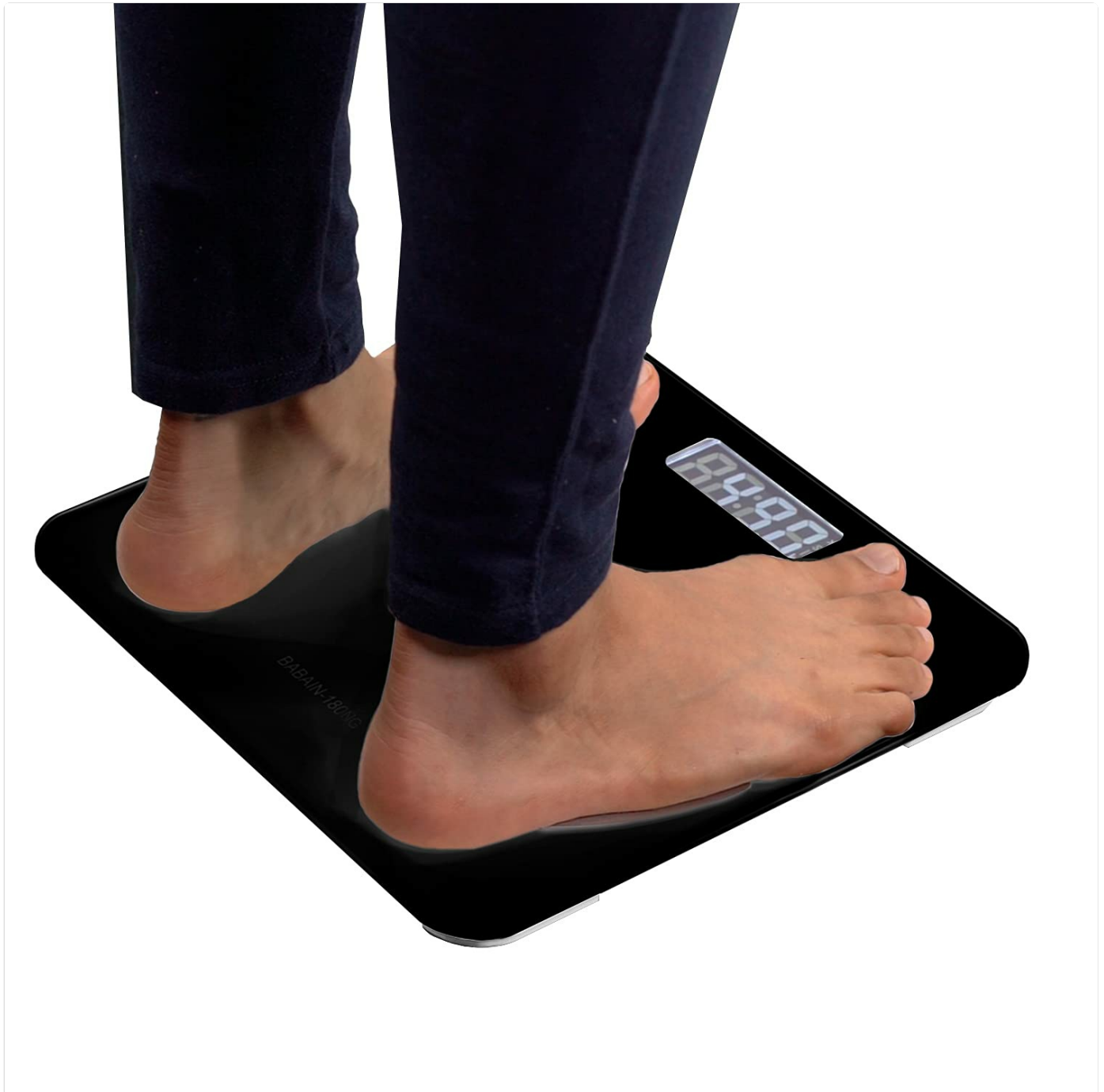
Figure 4: Proper foot placement for accurate readings.