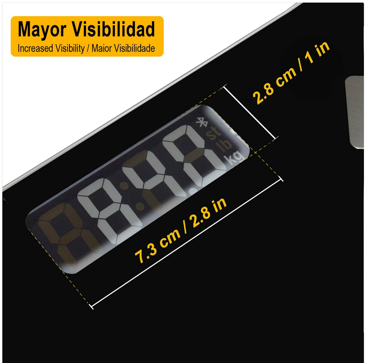
Figure 3: Backlit LED Display for clear readings.

Increased Visibility / Maior Visibilidade