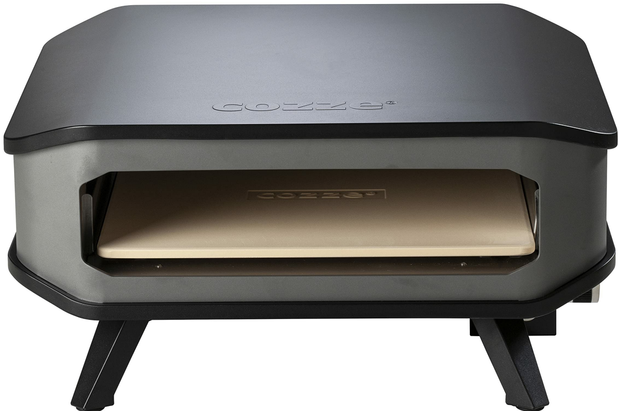
The Cozze 17-inch Gas Pizza Oven, ready for use.

Thank you for choosing the Cozze 17-inch Gas Pizza Oven. This manual provides essential information for the safe and efficient operation of your new outdoor pizza oven. Please read all instructions carefully before assembly, installation, and use. Keep this manual for future reference.