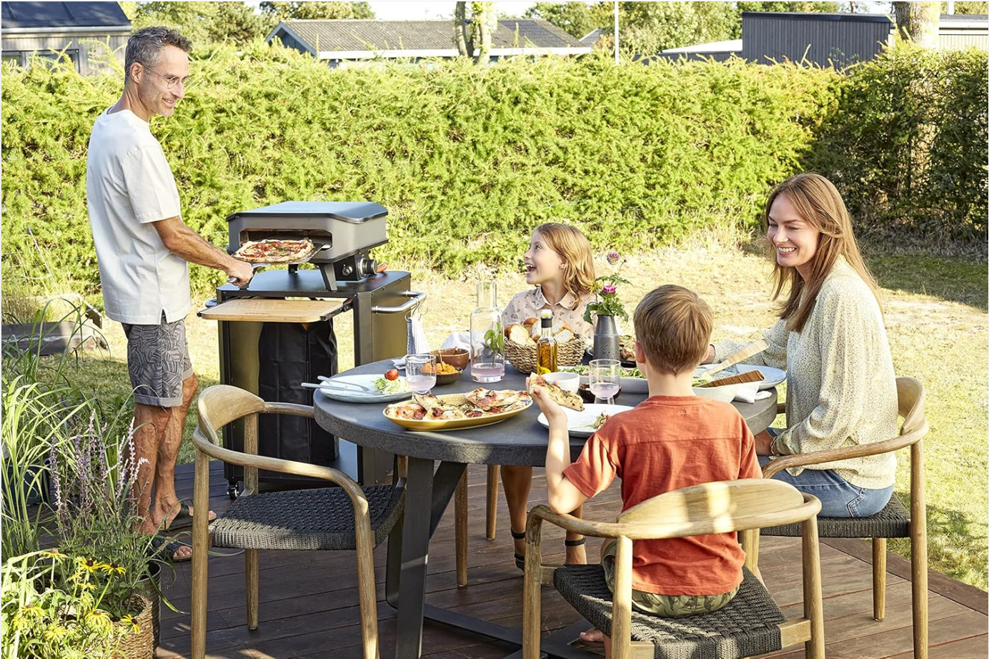
Cooking pizza in the Cozze oven during an outdoor gathering.