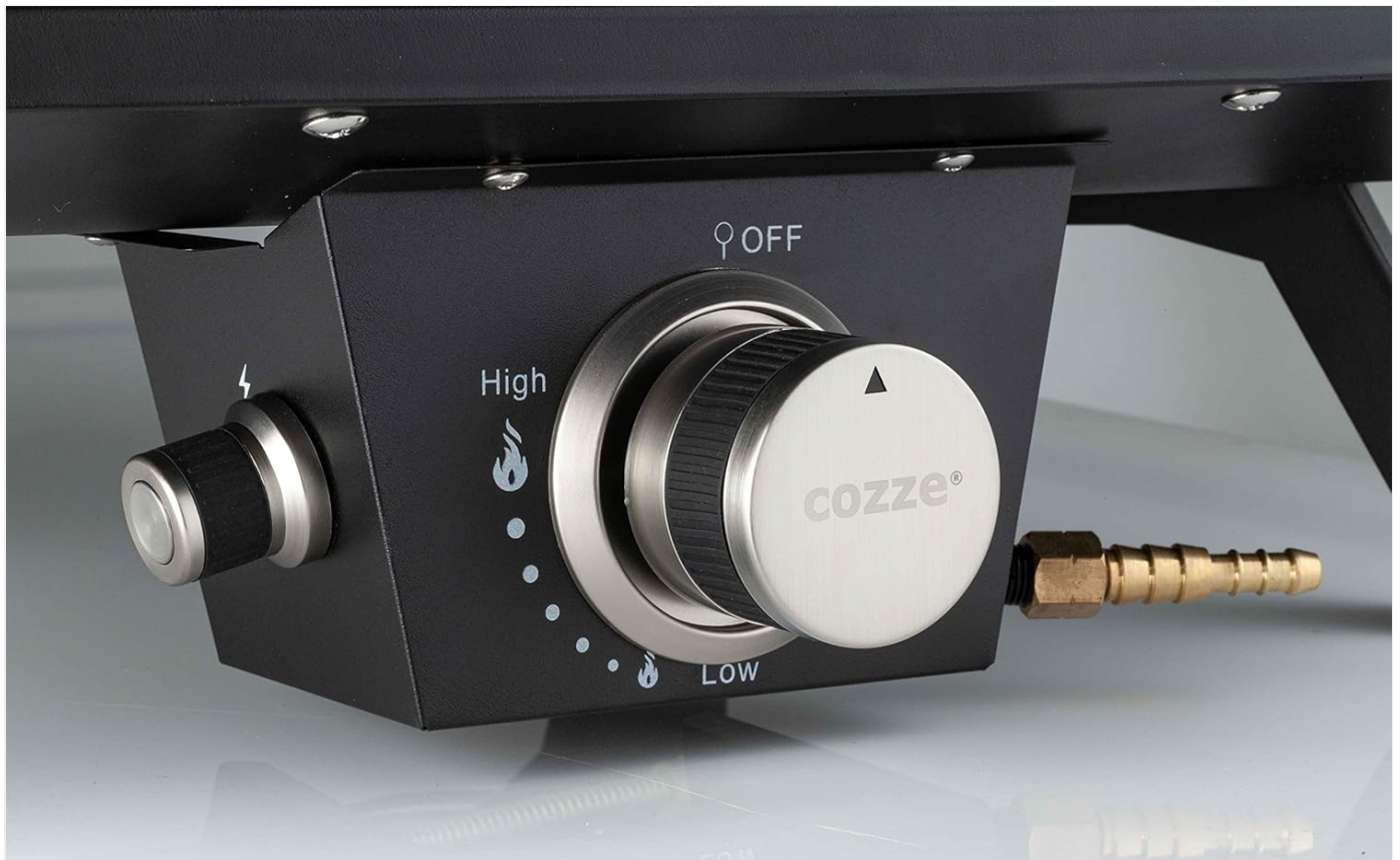
The control knob and gas connection point on the Cozze oven.