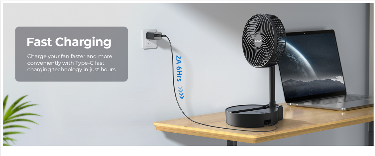
Image: The fan connected to a power source via its Micro USB port for fast charging.