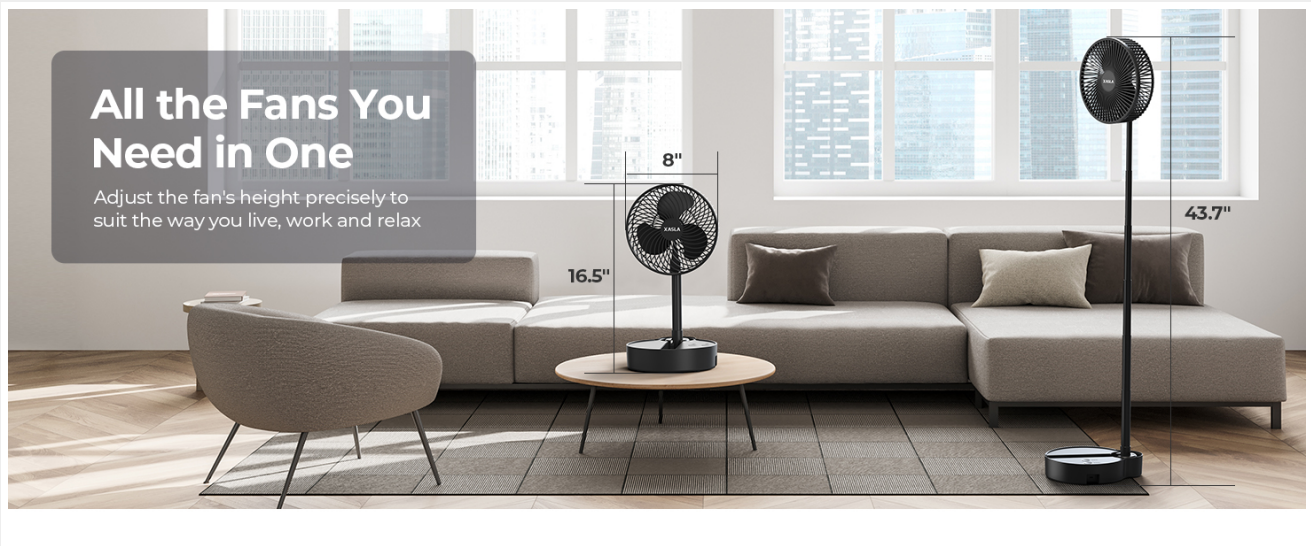
Image: Visual representation of the fan's adjustable height, from a compact desk fan to a full-size standing fan.