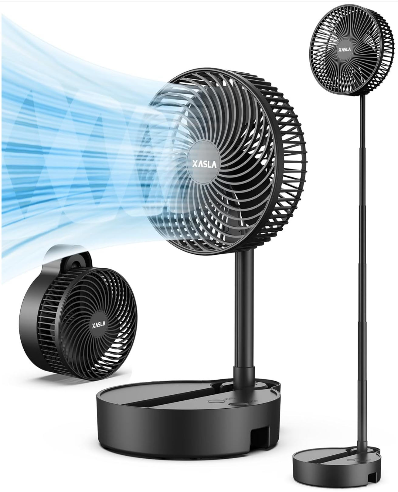
Image: The xasla 8-inch Portable Rechargeable Fan shown in its compact folded state, as a desk fan, and extended as a standing fan, demonstrating its versatility and portability.