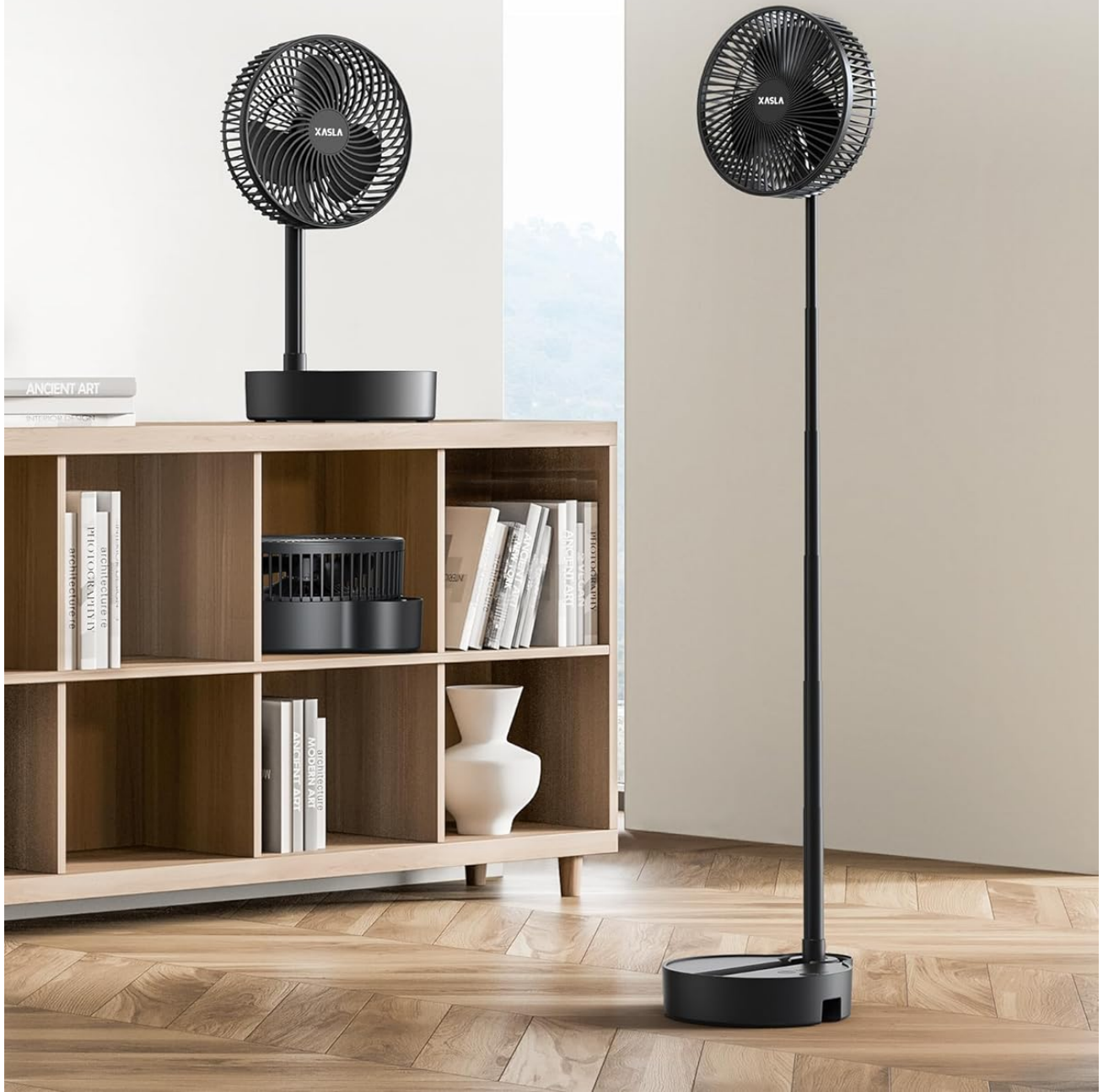
Image: The fan demonstrating its 'Multiple Fans in One' capability, easily transitioning between a compact desk fan and a tall standing fan.

Height adjustable and easy to move around