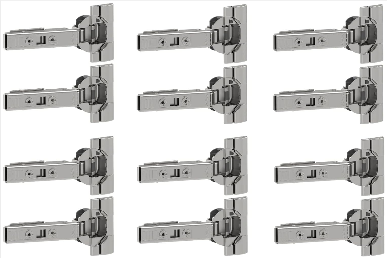
Figure 1: I-K-E-A UTRUSTA 110 Degree Hinges (12-pack).

This manual provides comprehensive instructions for the installation, operation, and maintenance of the I-K-E-A UTRUSTA 110 Degree Hinge with integrated damper. Designed for kitchen cabinet doors, these hinges ensure a slow, soft, and silent closing mechanism, contributing to an efficient and functional kitchen environment. The UTRUSTA hinge is a crucial component for achieving optimal workflow and space utilization in your kitchen.