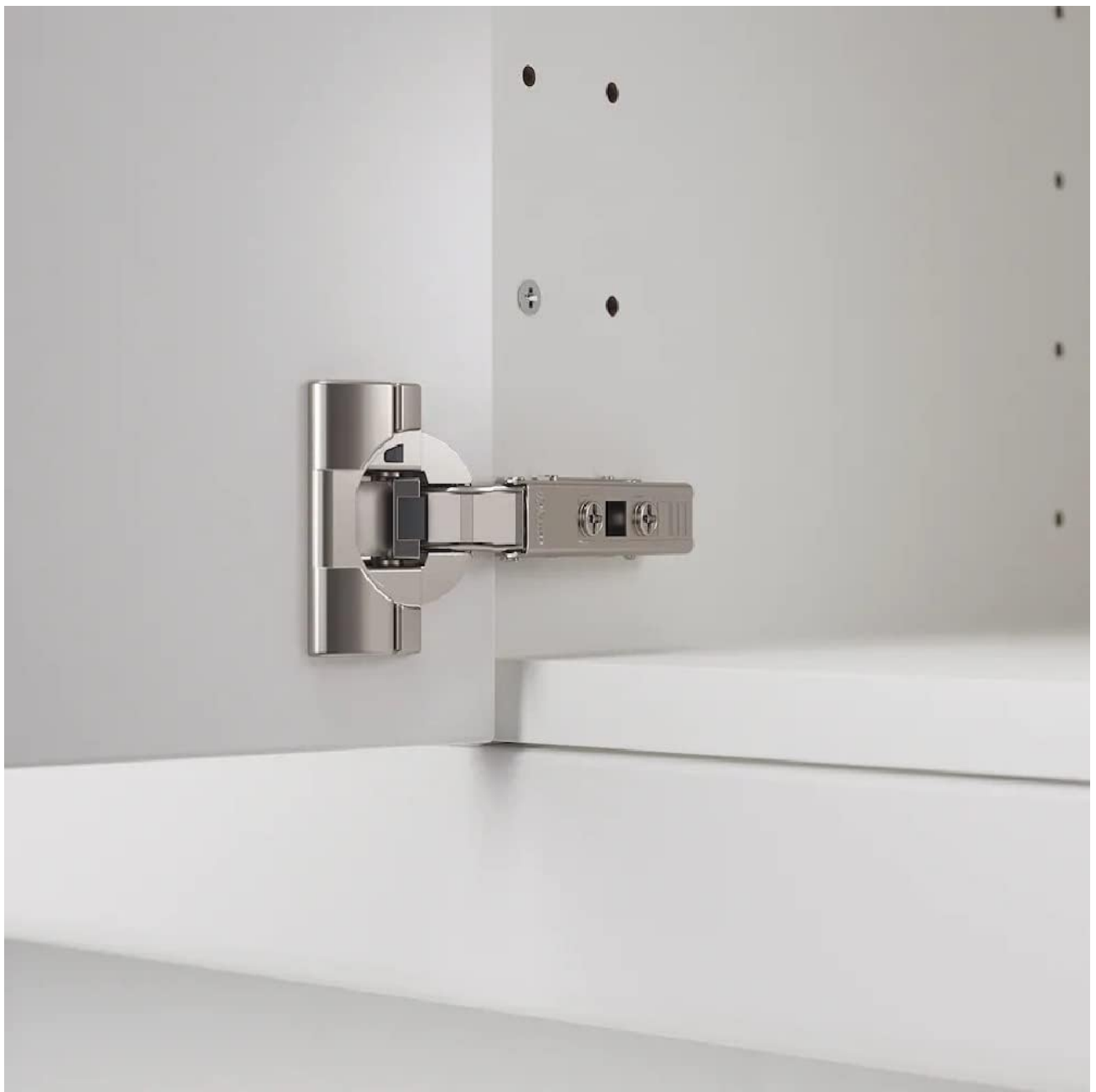
Figure 3: UTRUSTA Hinge installed on a cabinet, demonstrating its integration.