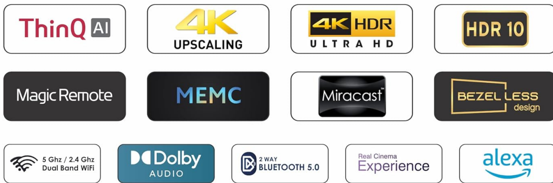
Image: Hyundai 43-inch Smart TV displaying WebOS home screen with various smart features like ThinQ AI, 4K Upscaling, HDR10, Magic Remote, MEMC, Miracast, Bezel-less design, Dual Band Wi-Fi, Dolby Audio, Bluetooth 5.0, Real Cinema Experience, and Alexa.