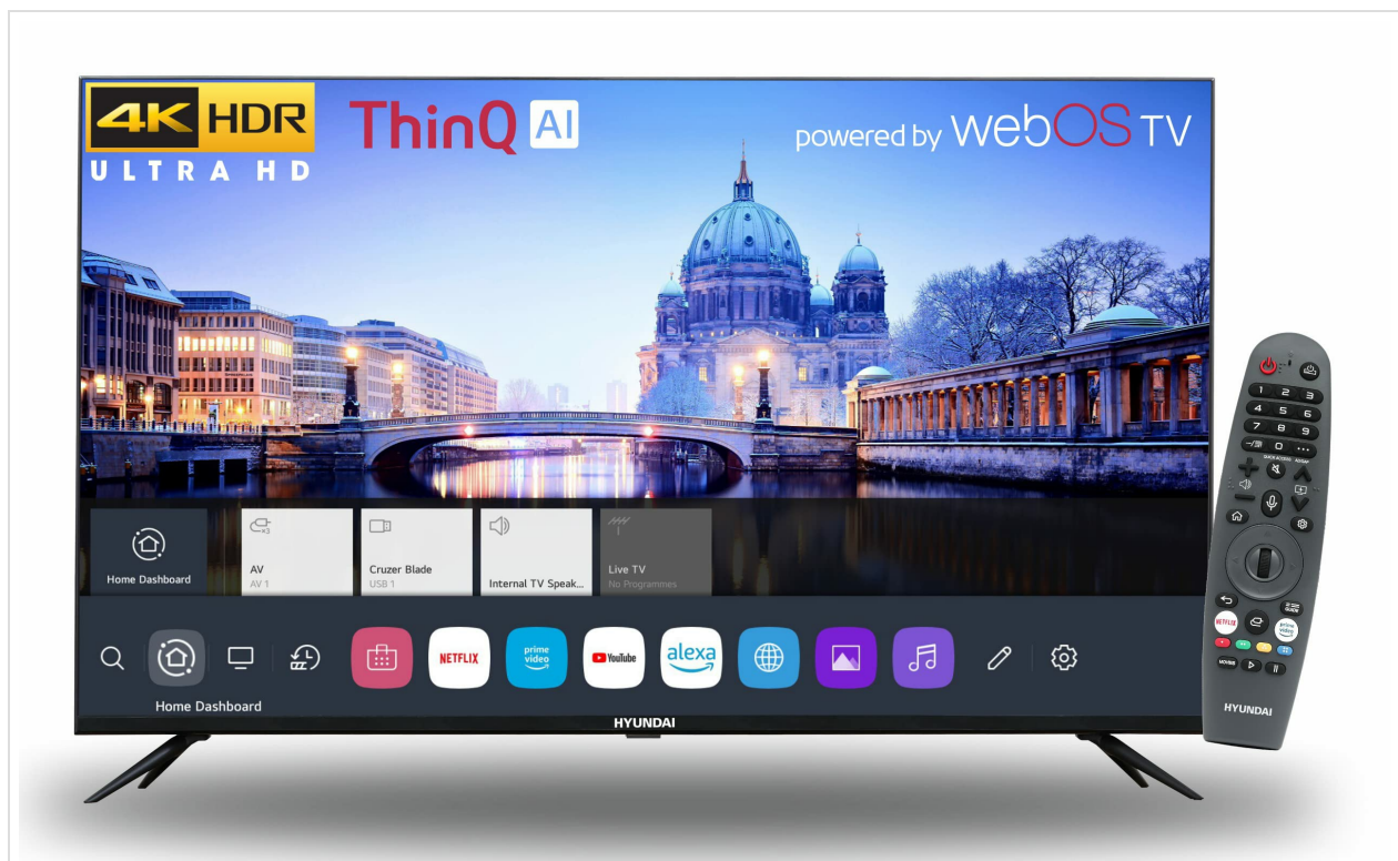
Image: Hyundai 43-inch 4K Smart LED TV front view with WebOS interface.

This manual provides essential information for the safe and efficient use of your new Hyundai 43-inch 4K Ultra HD Smart LED TV, model UHDHY43WSR4BYI5. Please read these instructions thoroughly before operating the television and retain them for future reference. This guide covers setup, operation, maintenance, and troubleshooting to ensure you get the best experience from your device.