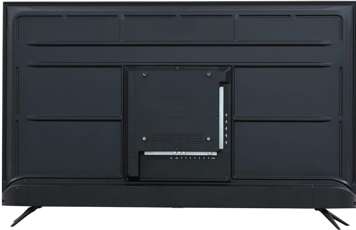
Image: Rear view of the Hyundai 43-inch Smart LED TV, showing the mounting points and general layout of the back panel.