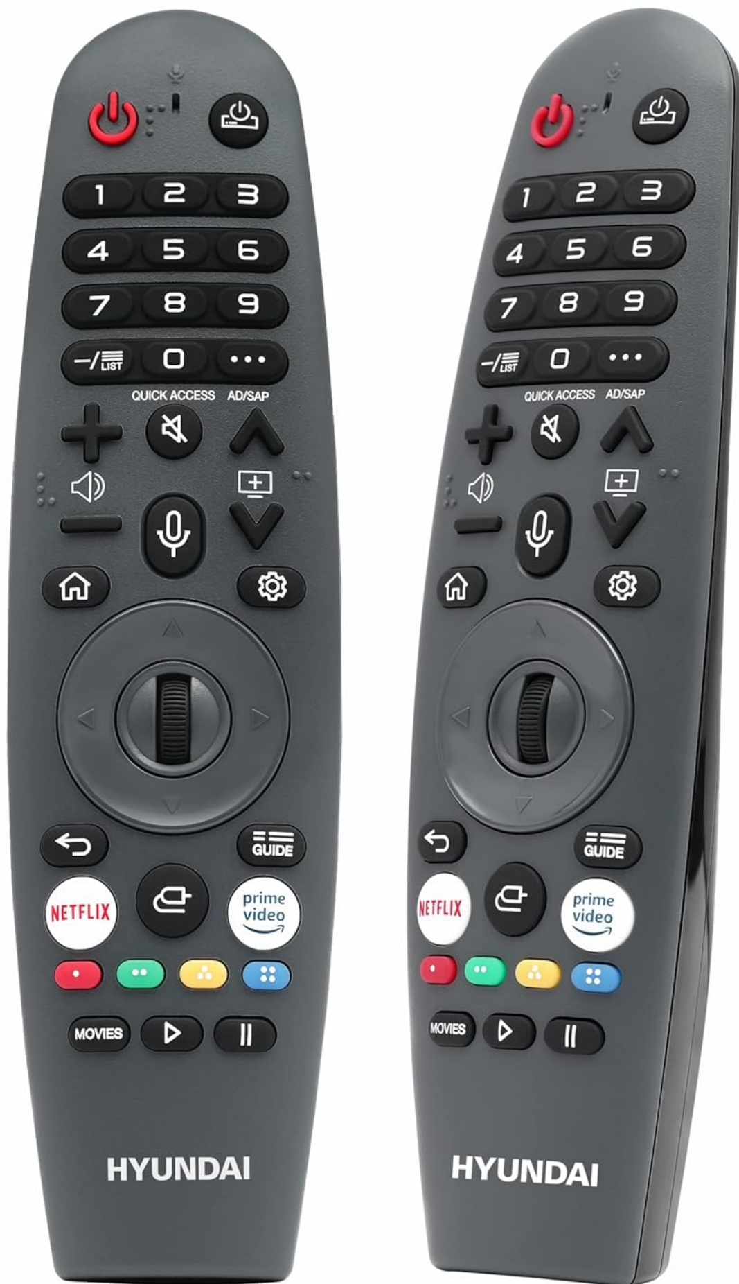
Image: Front and angled side view of the Hyundai Magic Remote, showcasing its ergonomic design and button