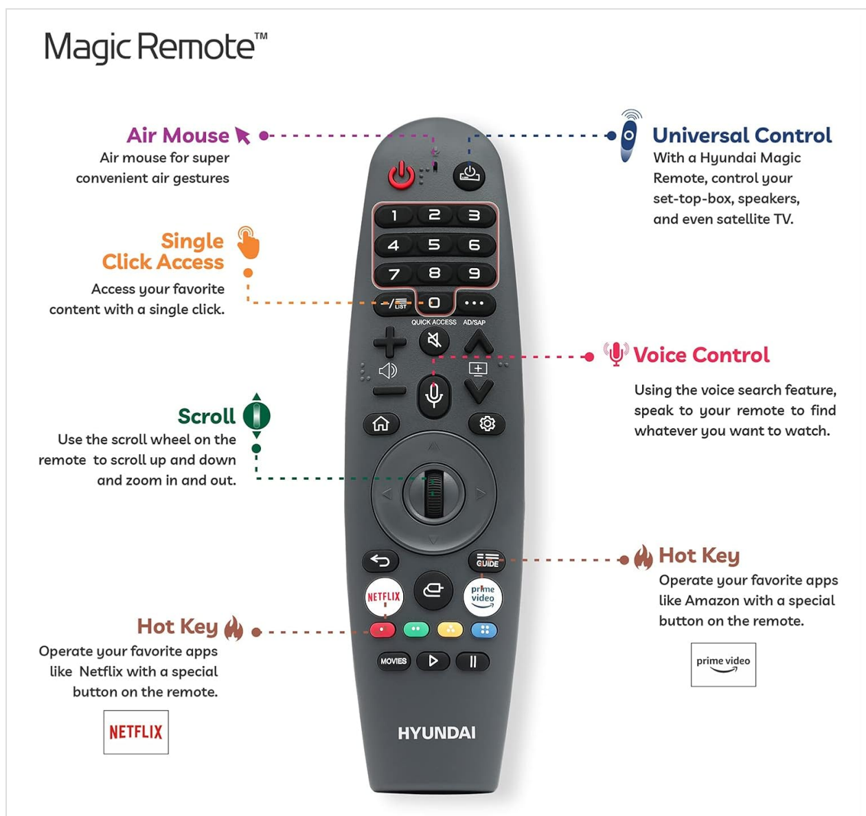
Image: Diagram detailing the features of the Hyundai Magic Remote, including Air Mouse, Single Click Access, Scroll wheel, Voice Control, Universal Control, and Hot Keys for Netflix and Prime Video.

Your Hyundai TV comes with a Magic Remote, offering intuitive control through pointing, clicking, scrolling, and voice commands.