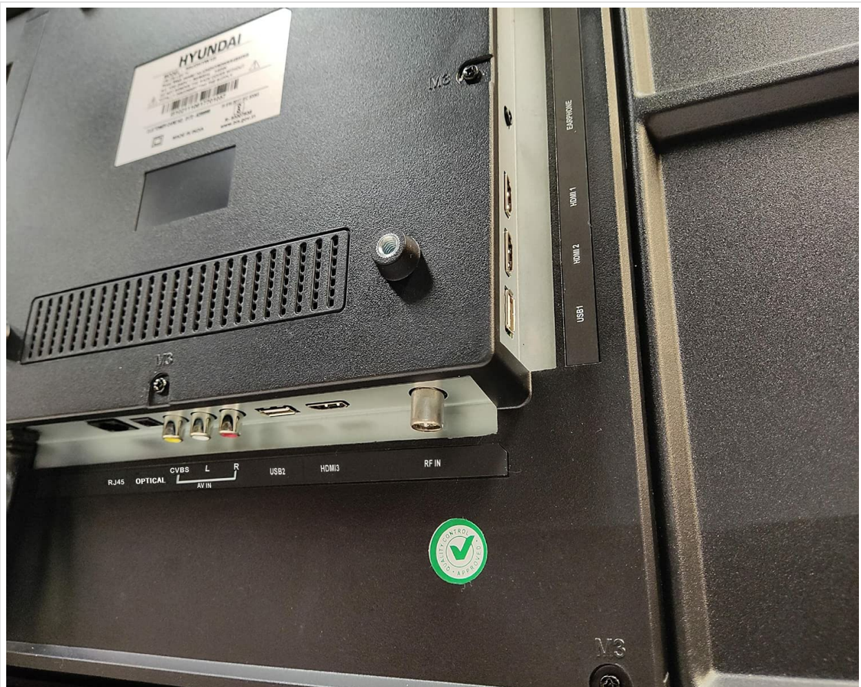
Image: Close-up view of the connectivity ports on the rear of the Hyundai 43-inch Smart LED TV, including HDMI, USB, RF IN, AV IN, Optical, and RJ45 Ethernet.