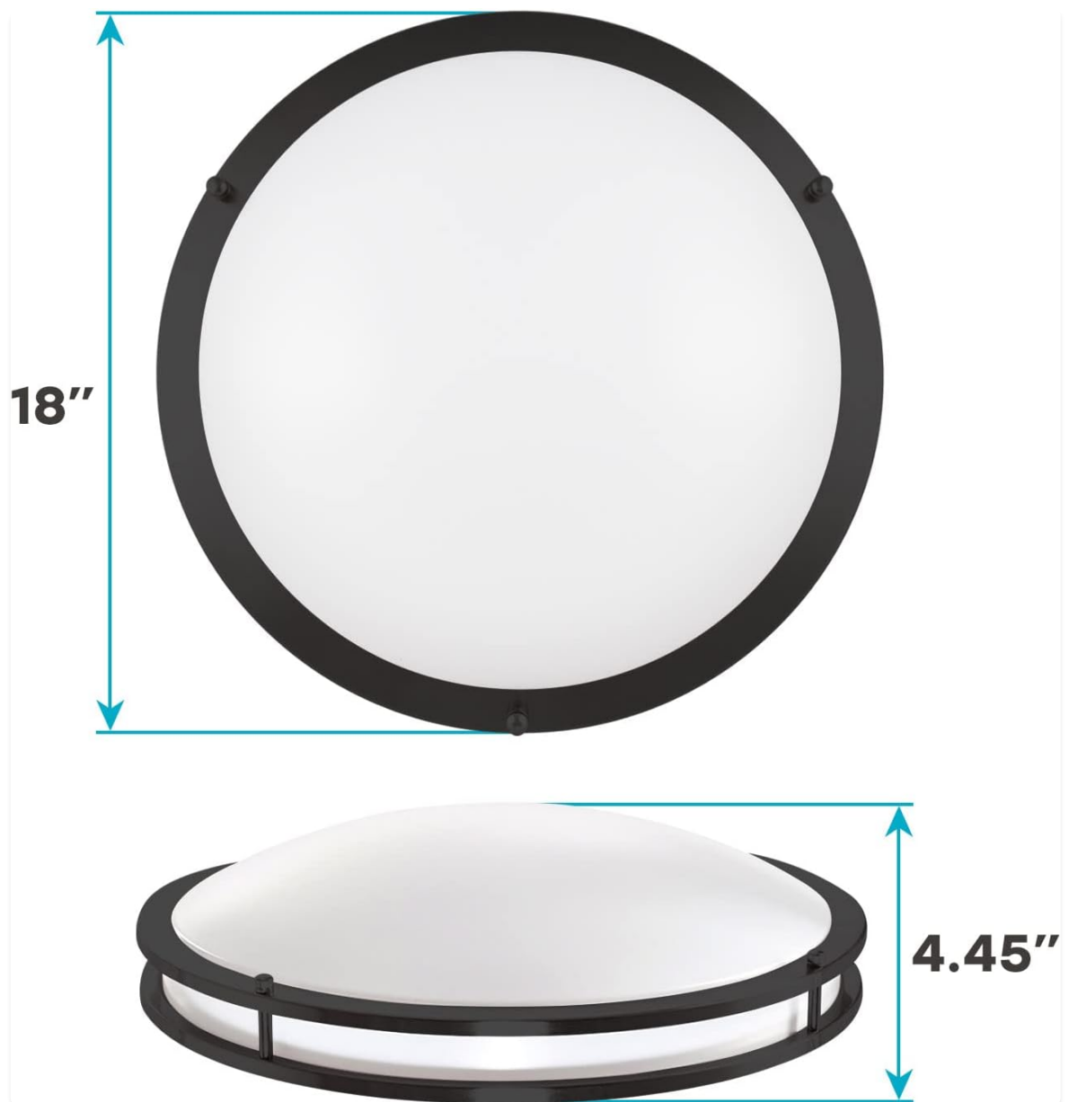
Image: A diagram illustrating the physical dimensions of the 18-inch flush mount ceiling light, showing a diameter of 18 inches and a height of 4.45 inches.