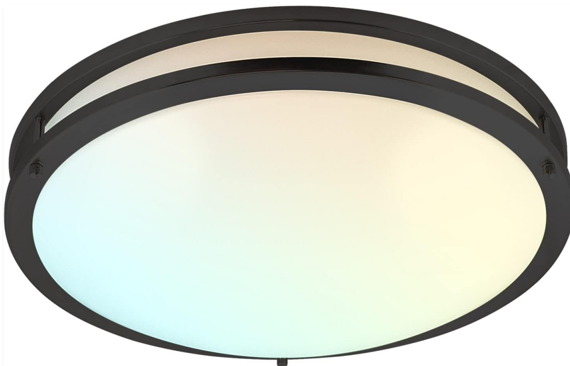
Image: The LUXRITE 18-inch LED flush mount ceiling light in matte black, showcasing its sleek, round design.

This manual provides detailed instructions for the installation, operation, and maintenance of your LUXRITE 18-Inch LED Flush Mount Ceiling Light. This modern fixture features a matte black finish, offers 5 selectable color temperatures (2700K, 3000K, 3500K, 4000K, 5000K), and is dimmable. Please read this manual thoroughly before installation and retain it for future reference.