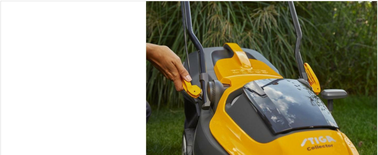
Figure 4.3: Removing the grass collector for emptying.