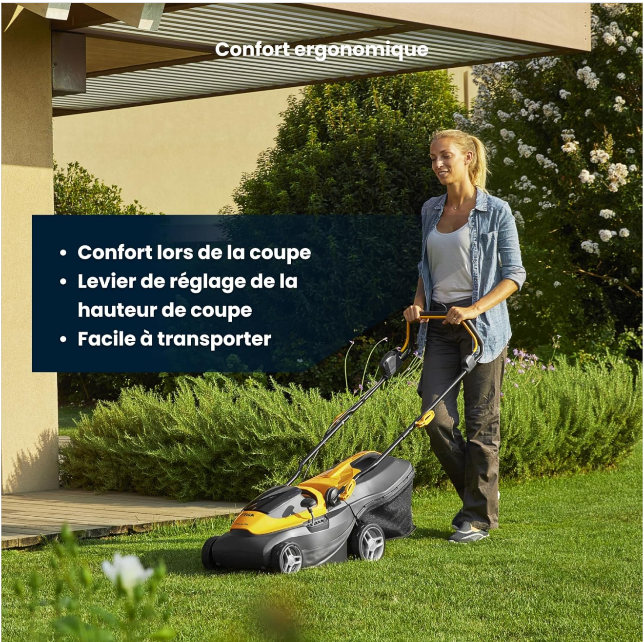
Figure 2.2: Ergonomic features of the lawn mower, highlighting comfort during operation and ease of transport.