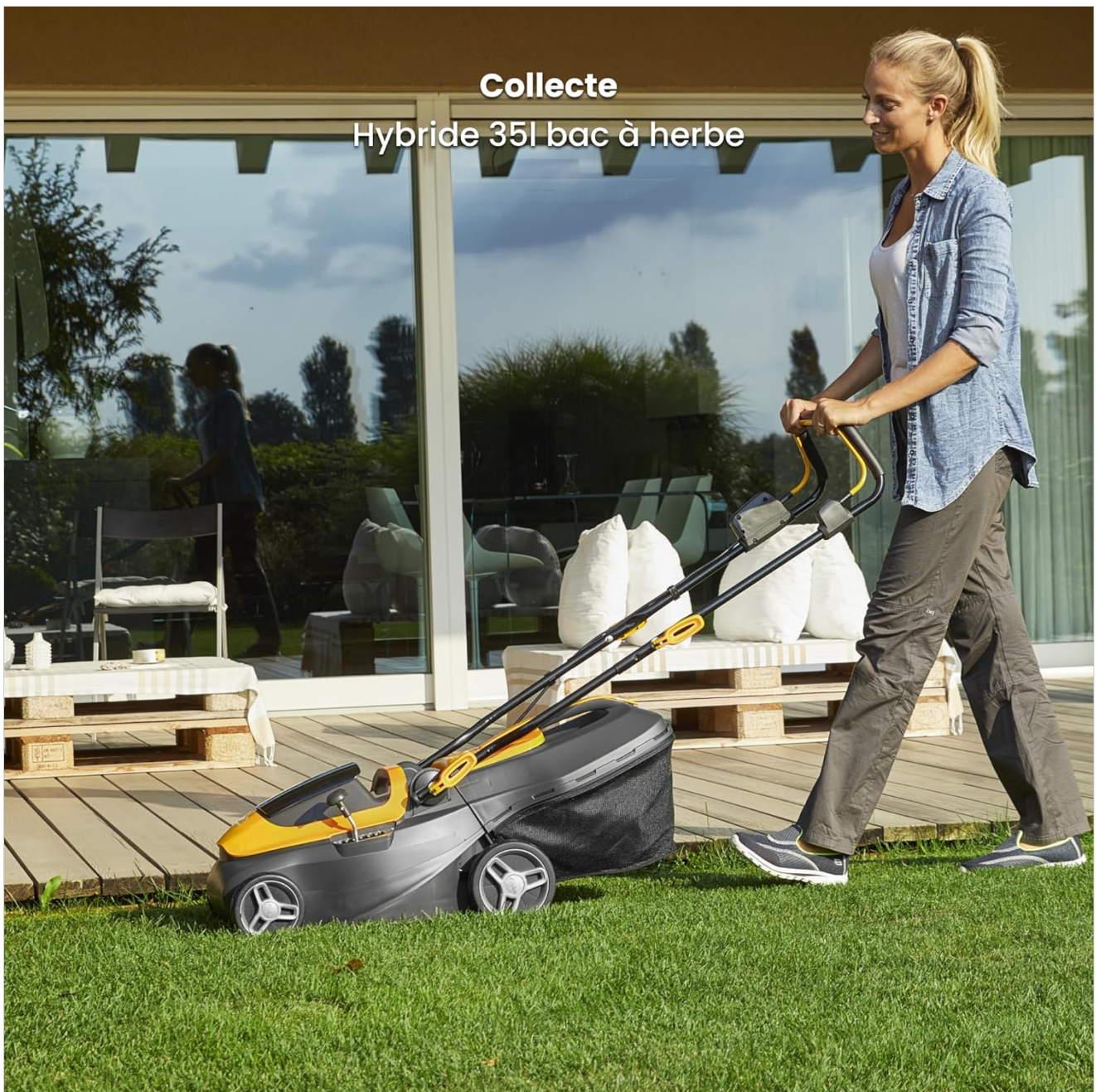
Figure 4.2: Operating the STIGA lawn mower for grass collection.