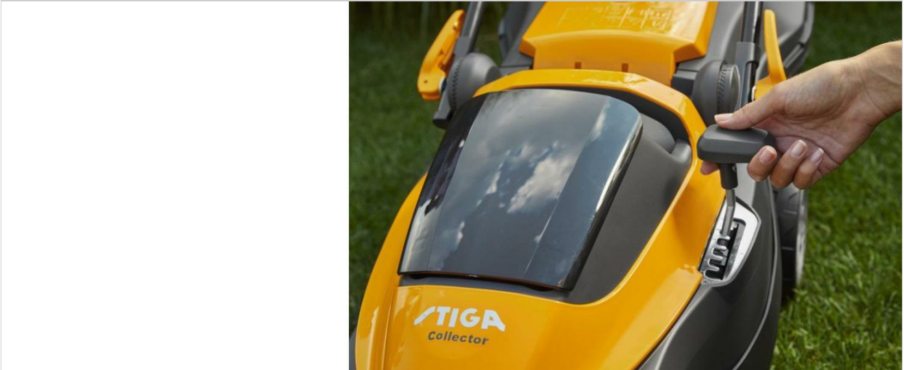
Figure 4.1: Adjusting the cutting height using the lever.