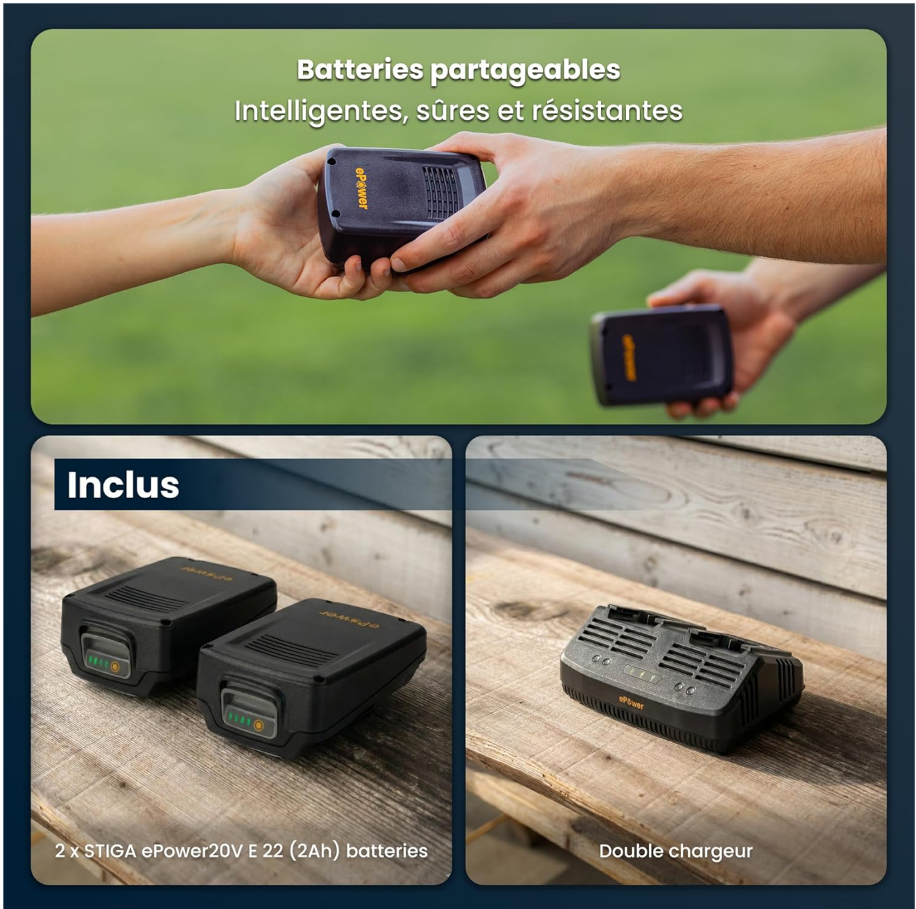
Figure 3.1: The included 2x STIGA ePower20V (2Ah) batteries and double charger.

6. Close the battery compartment cover securely.