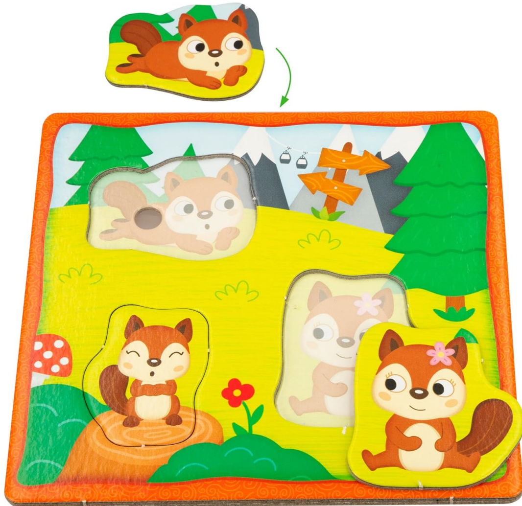
Image 3: Squirrel Puzzle Example. This image illustrates one of the puzzle boards featuring a squirrel family. It shows how the individual squirrel pieces fit into the designated cutouts on the board, demonstrating the matching aspect of the game.