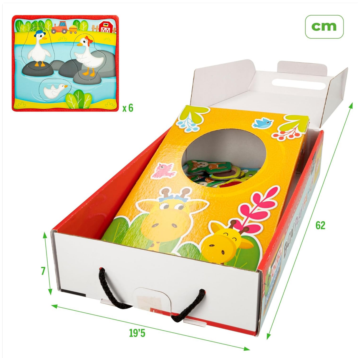
Image 2: Box Contents and Dimensions. This image shows the open game box with some puzzle pieces visible inside, alongside a separate puzzle board featuring ducks. Dimensions of the box (19.5 cm x 62 cm x 7 cm) are indicated, providing a clear idea of the product's size and internal layout.