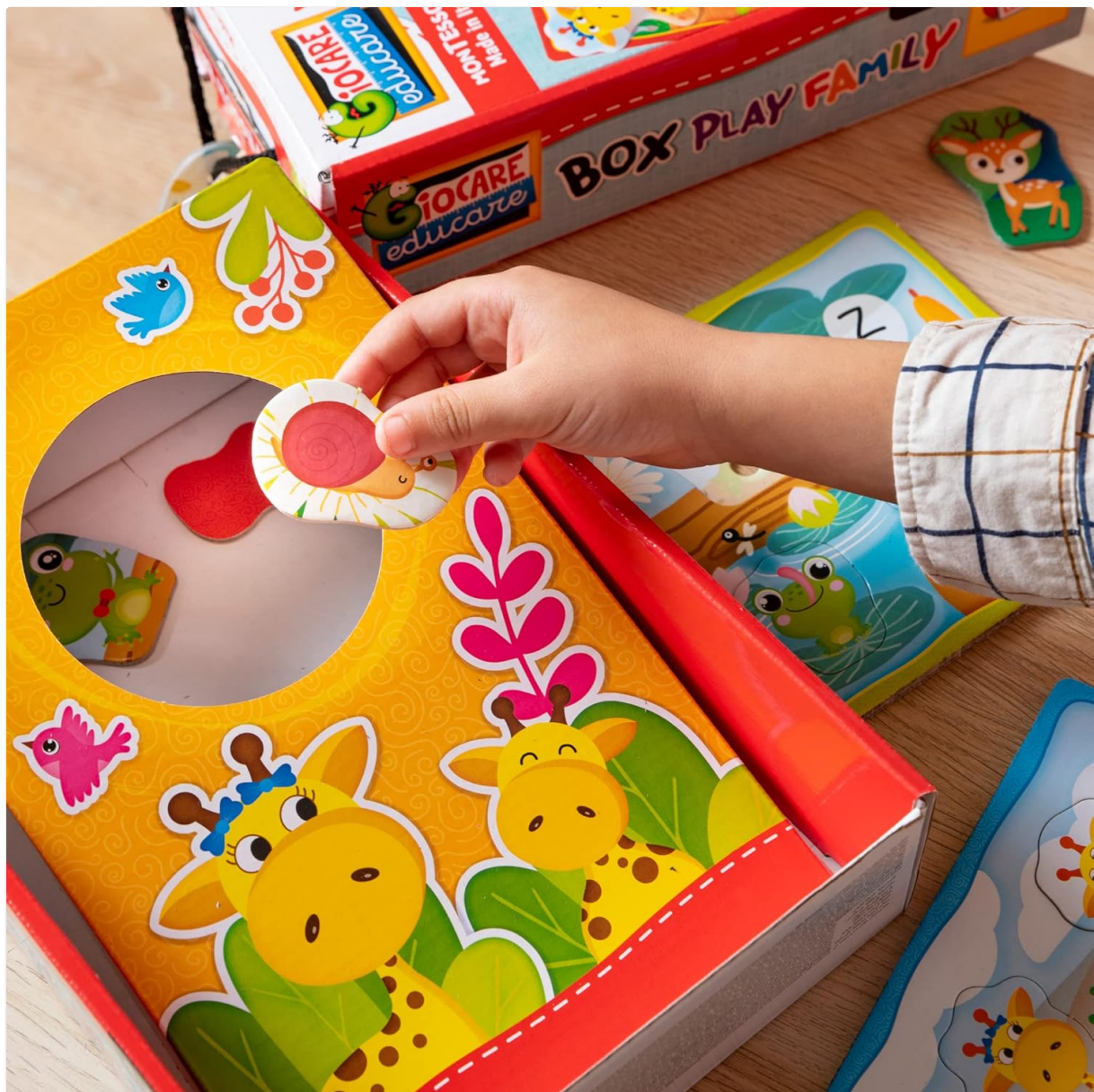
Image 4: Child Playing with Pieces. A child's hand is shown placing an animal puzzle piece into the game box, demonstrating the tactile interaction and engagement with the game components during play.