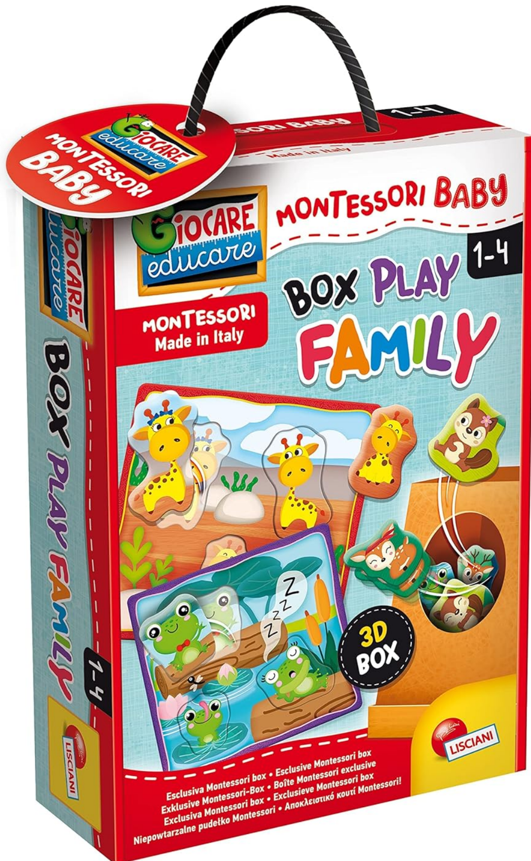
Image 1: Product Packaging. This image displays the complete Lisciani Montessori Baby Box Play Family product in its retail packaging, highlighting the "Montessori Baby" and "Box Play Family" branding, along with illustrations of the animal characters included in the game.