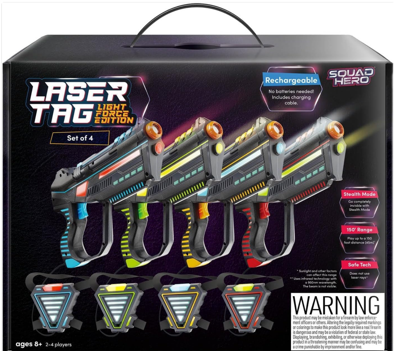
Image: The complete Squad Hero Laser Tag set, featuring four blasters and corresponding vests, ready for action.