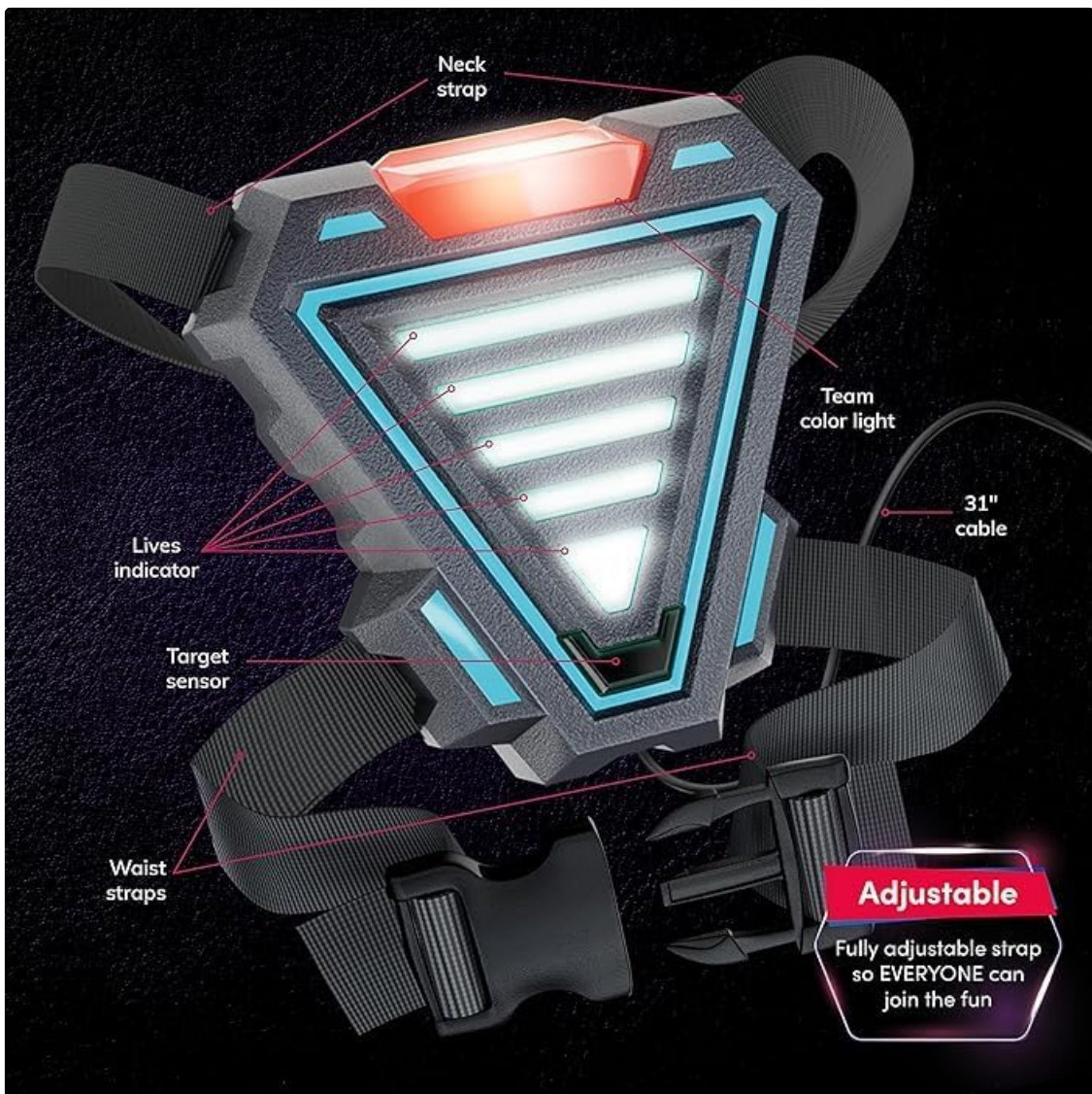
Image: Close-up of the laser tag vest, highlighting the neck strap, waist straps, lives indicator, and target sensor.