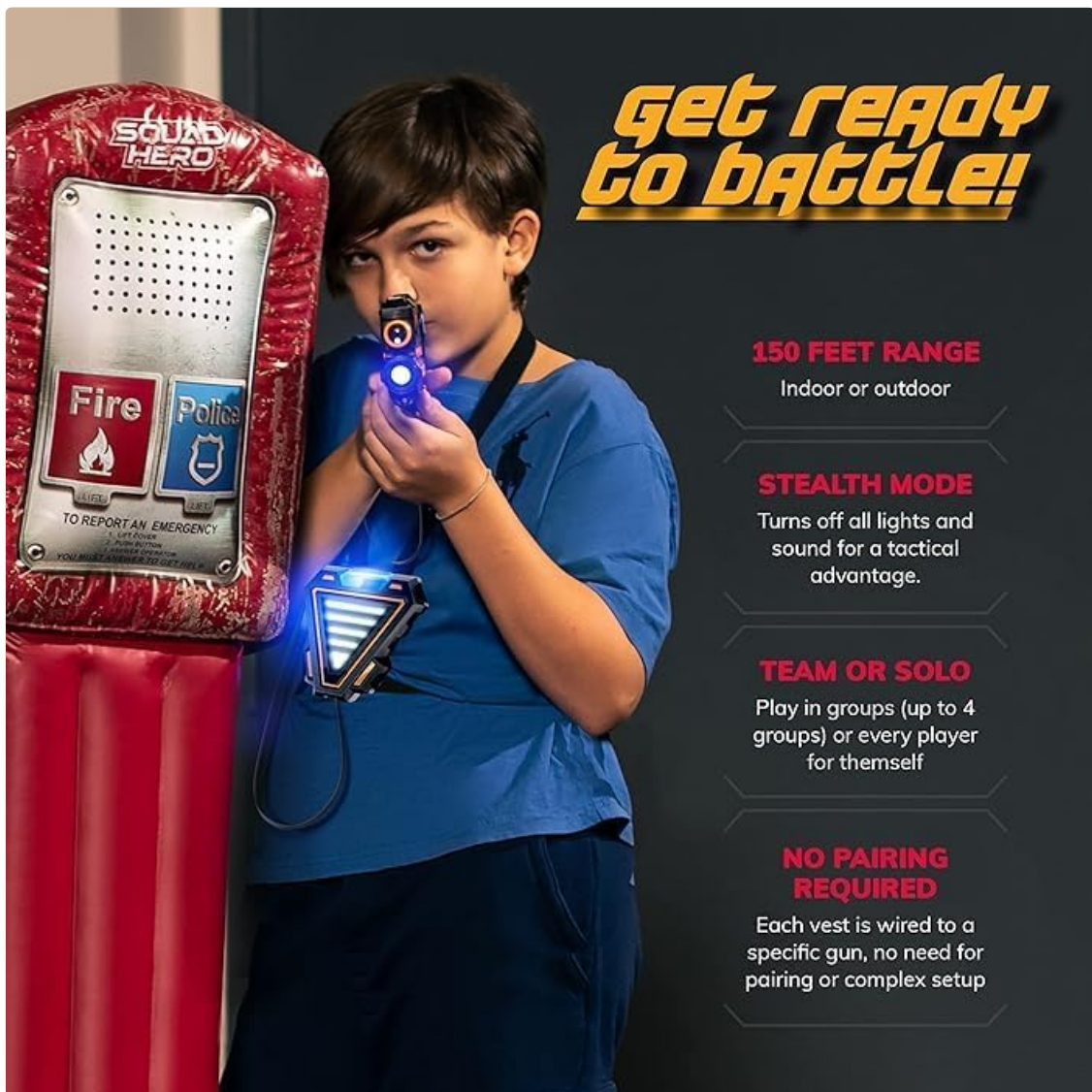
Image: A summary of advanced features including 150-foot range, Stealth Mode, Team or Solo play options, and the convenience of no pairing required.