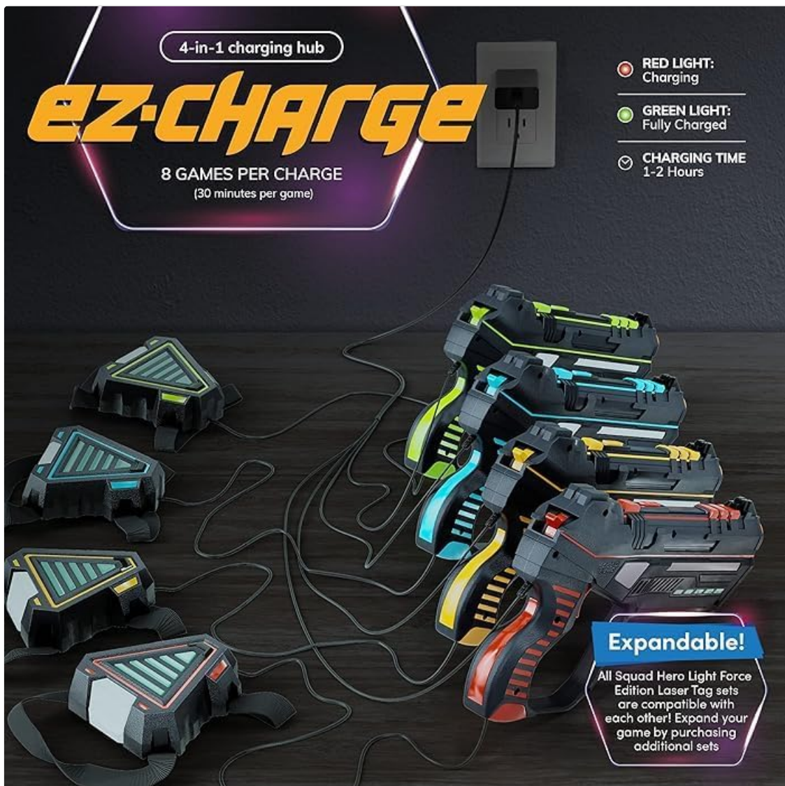
Image: The 4-in-1 charging hub connected to multiple blasters and vests, showing charging indicators.