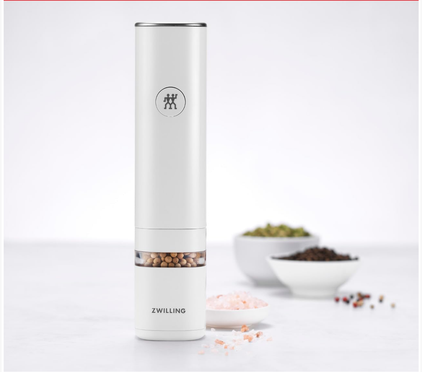
Figure 7: The mill in action, grinding spices at the press of a button.