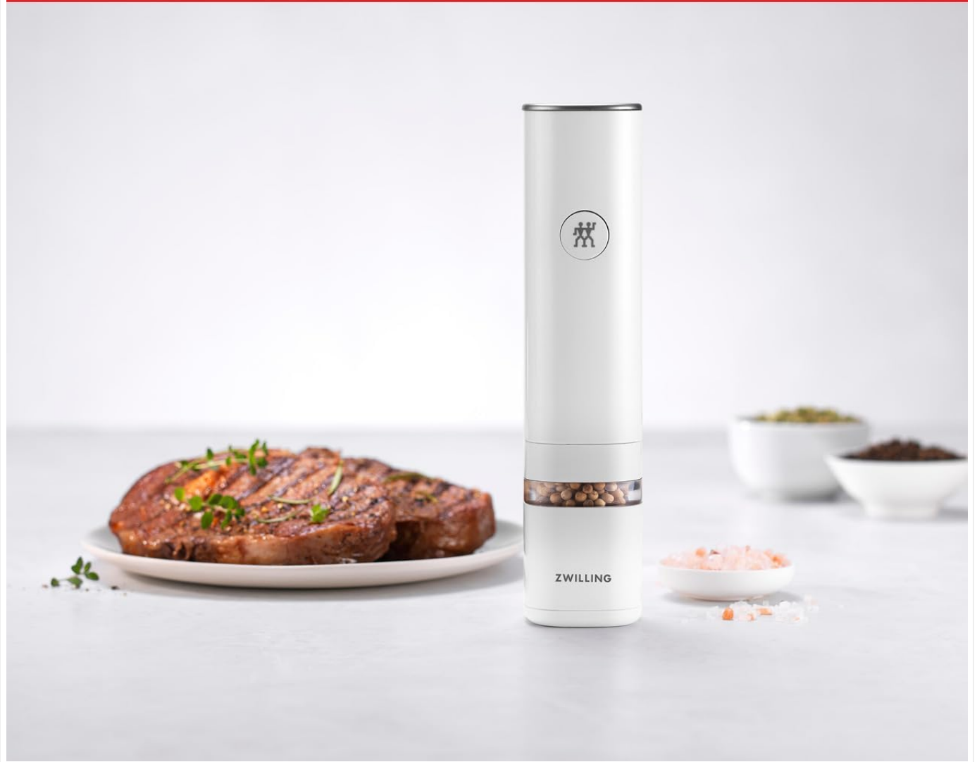
Figure 6: Using the mill to grind spices with the automatic light activated.

To fill: Twist the base to the unlock position, separate, load the spices of your choosing