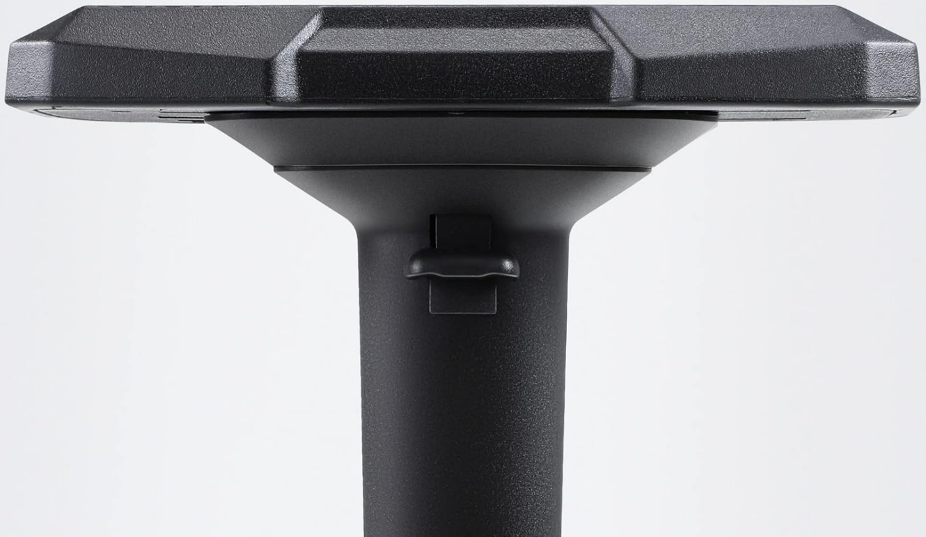
Image: This image visually demonstrates the four-dimensional adjustments of the armrest. It shows the armrest pad moving up/down (height), front/back, left/right, and rotating, highlighting the flexibility to customize its position without needing to press a button for rotation.