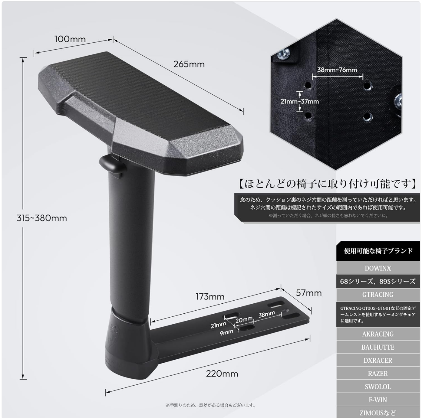
Image: This diagram illustrates the dimensions of the Dowinx 4D Armrest and provides a guide for measuring screw hole distances to ensure compatibility with various chair models. It shows the armrest pad dimensions (100mm x 265mm), height range (315-380mm), and base plate dimensions (220mm length, 173mm arm support, 57mm width, with screw hole distances of 21mm, 9mm, 20mm, 38mm). A detailed inset shows screw hole spacing for chair cushions, ranging from 38mm to 76mm in width and 21mm to 37mm in depth.

Note on Accessories: For environmental protection, hex wrenches and screws may not always be included. If you require these, please contact Dowinx customer service.