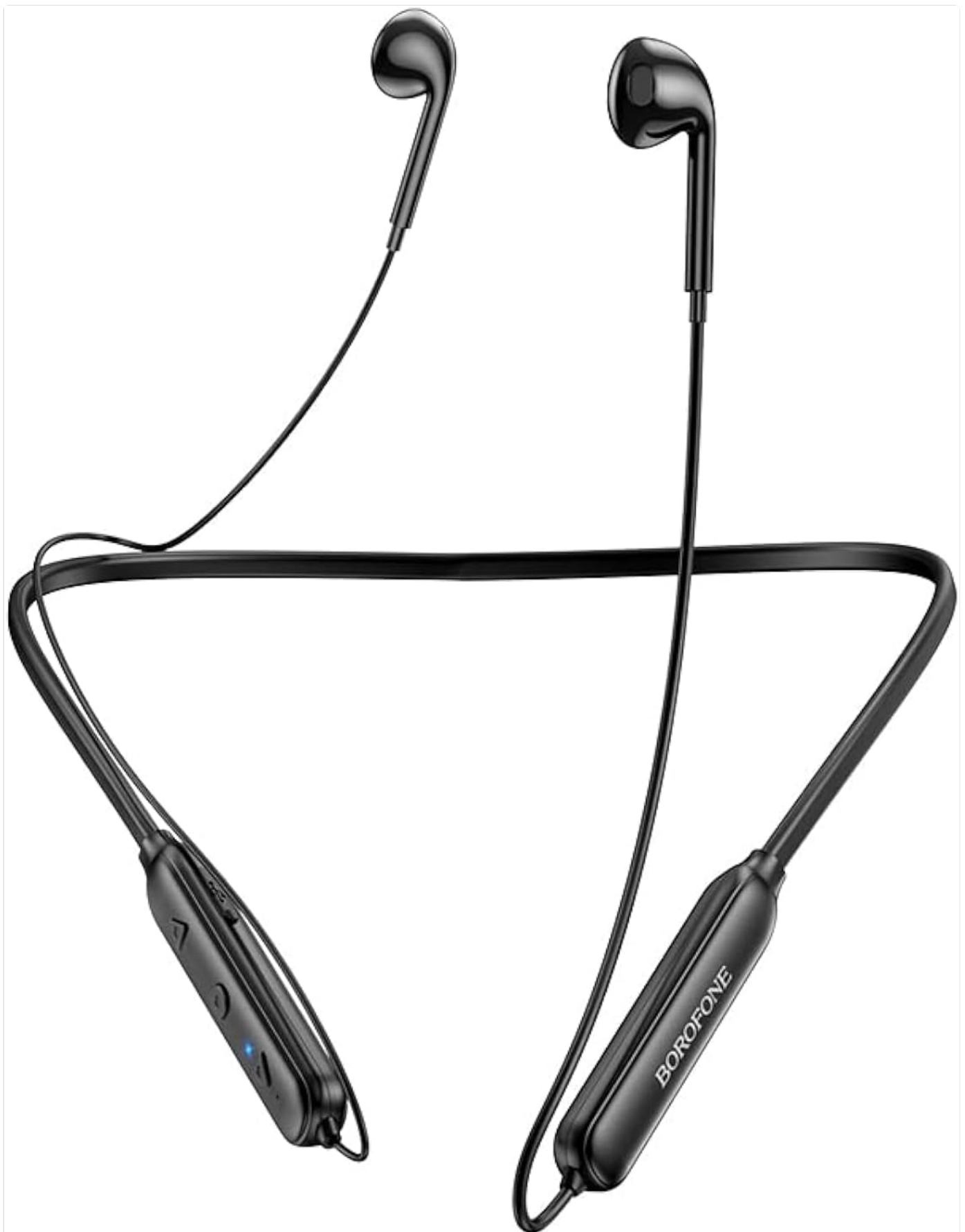
Figure 3.1: Front view of the Borofone BE52 Bluetooth Sports Earphones, showcasing the neckband and in-ear design.