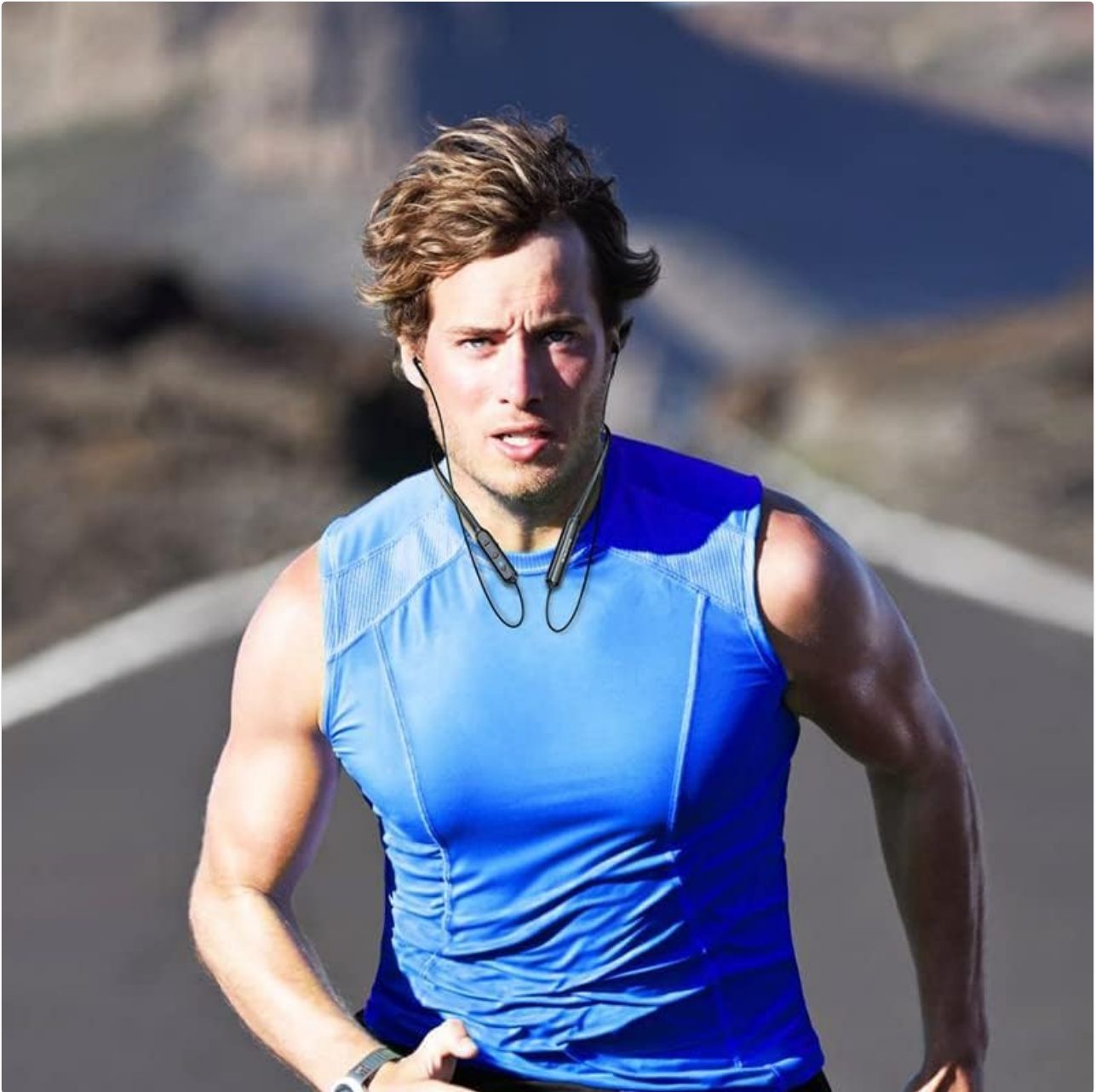
Figure 5.1: A man wearing the Borofone BE52 earphones during a run, demonstrating their suitability for sports activities.