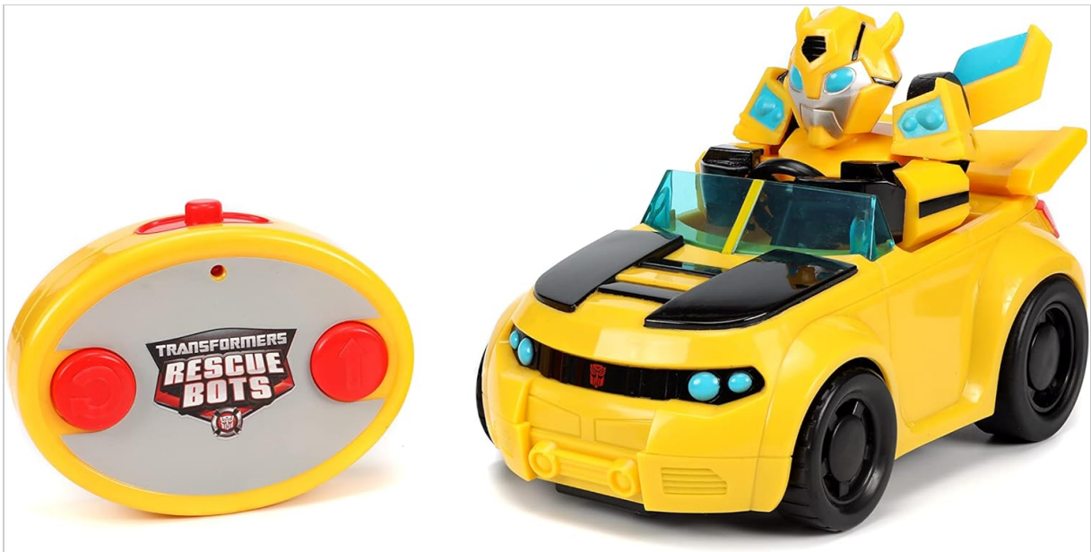
Image 2.1: The Bumblebee RC car and its accompanying remote control unit.