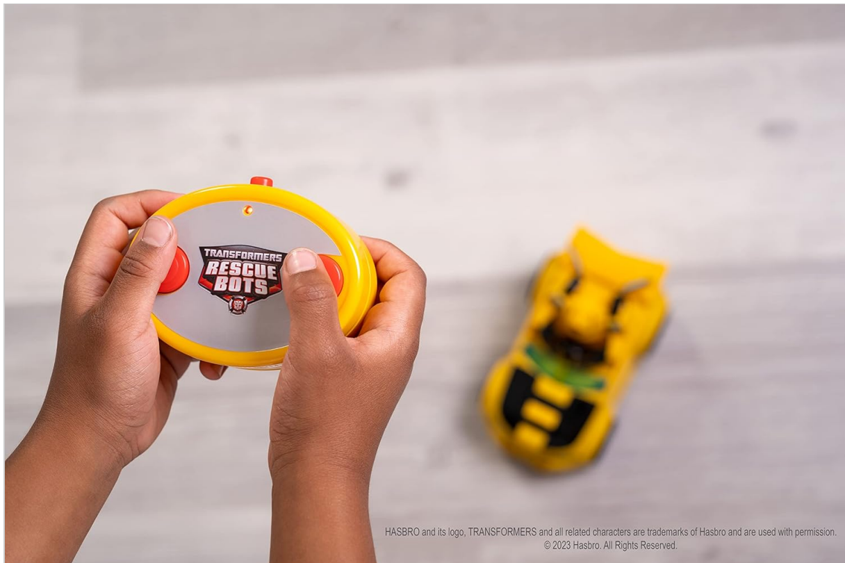
Image 4.1: The two-button remote control for the Bumblebee RC car.