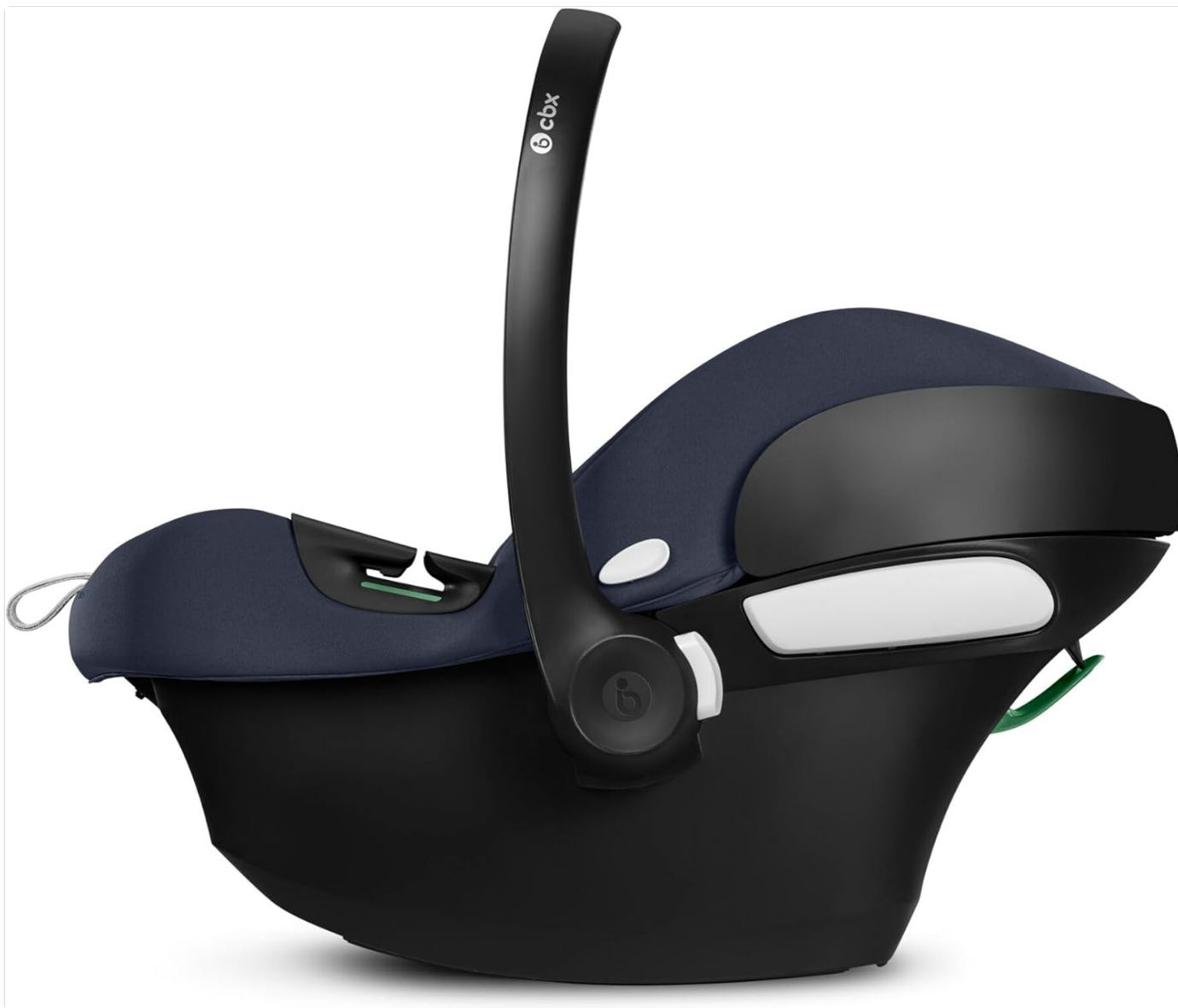
Image: The car seat with its ergonomic carry handle.