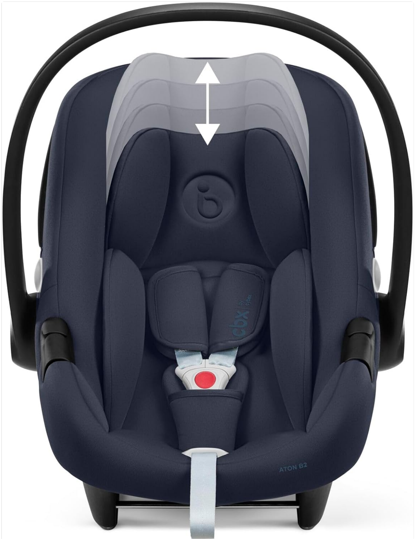
Image: Adjusting the headrest and harness height for optimal fit.