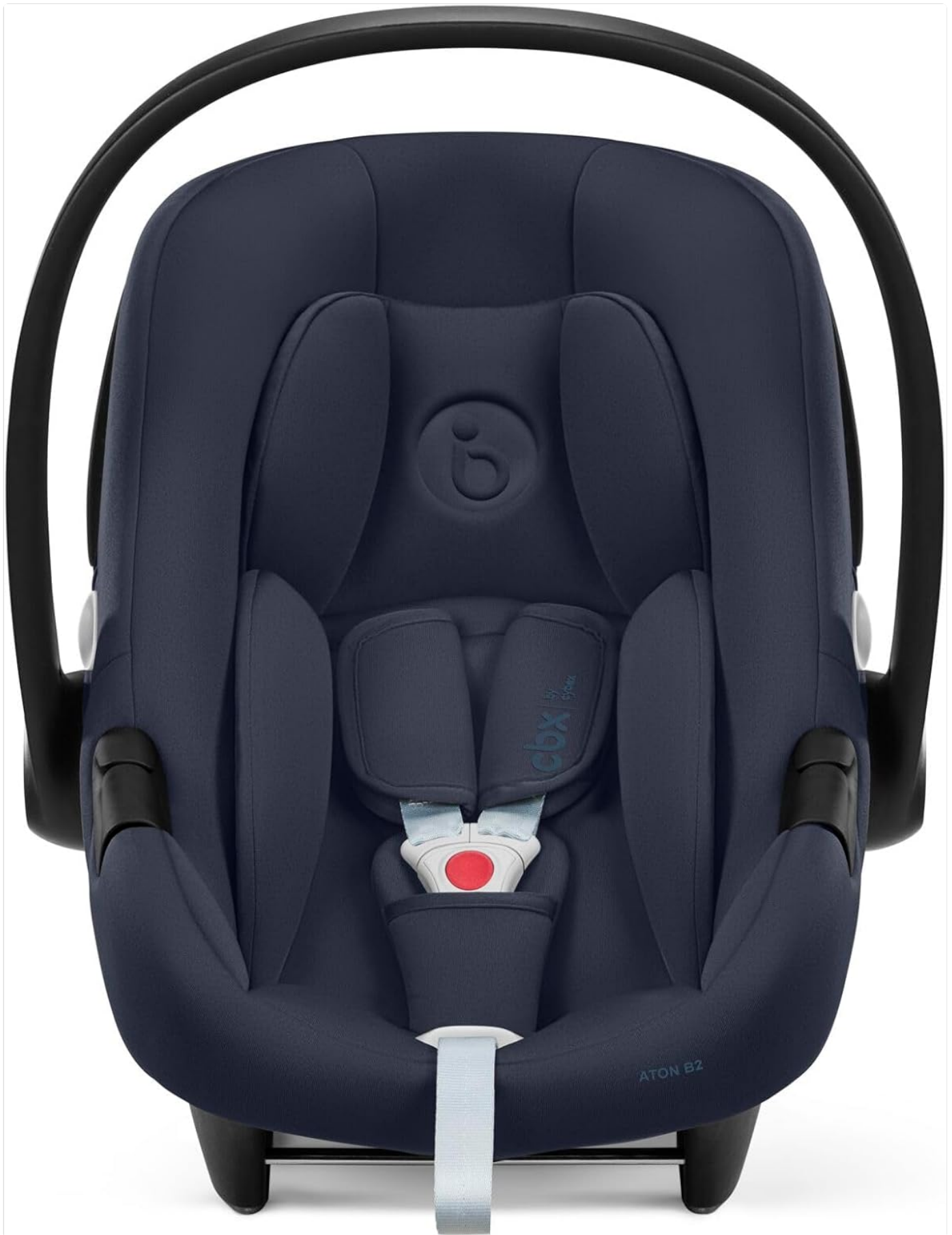
Image: Front view of the car seat showing the harness and newborn insert.