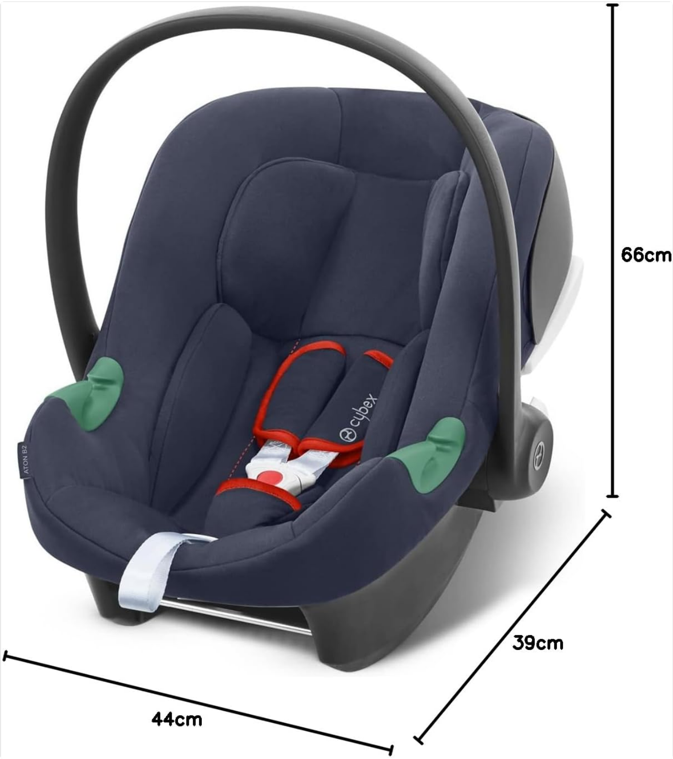
Image: Dimensions of the Cybex Aton B2 i-Size car seat.

If you encounter issues not covered here, please contact Cybex customer support.