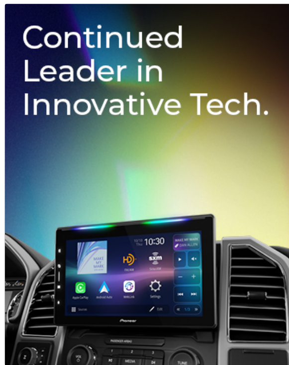
Image: A car interior view showing the Pioneer head unit installed, displaying a navigation application on its screen.