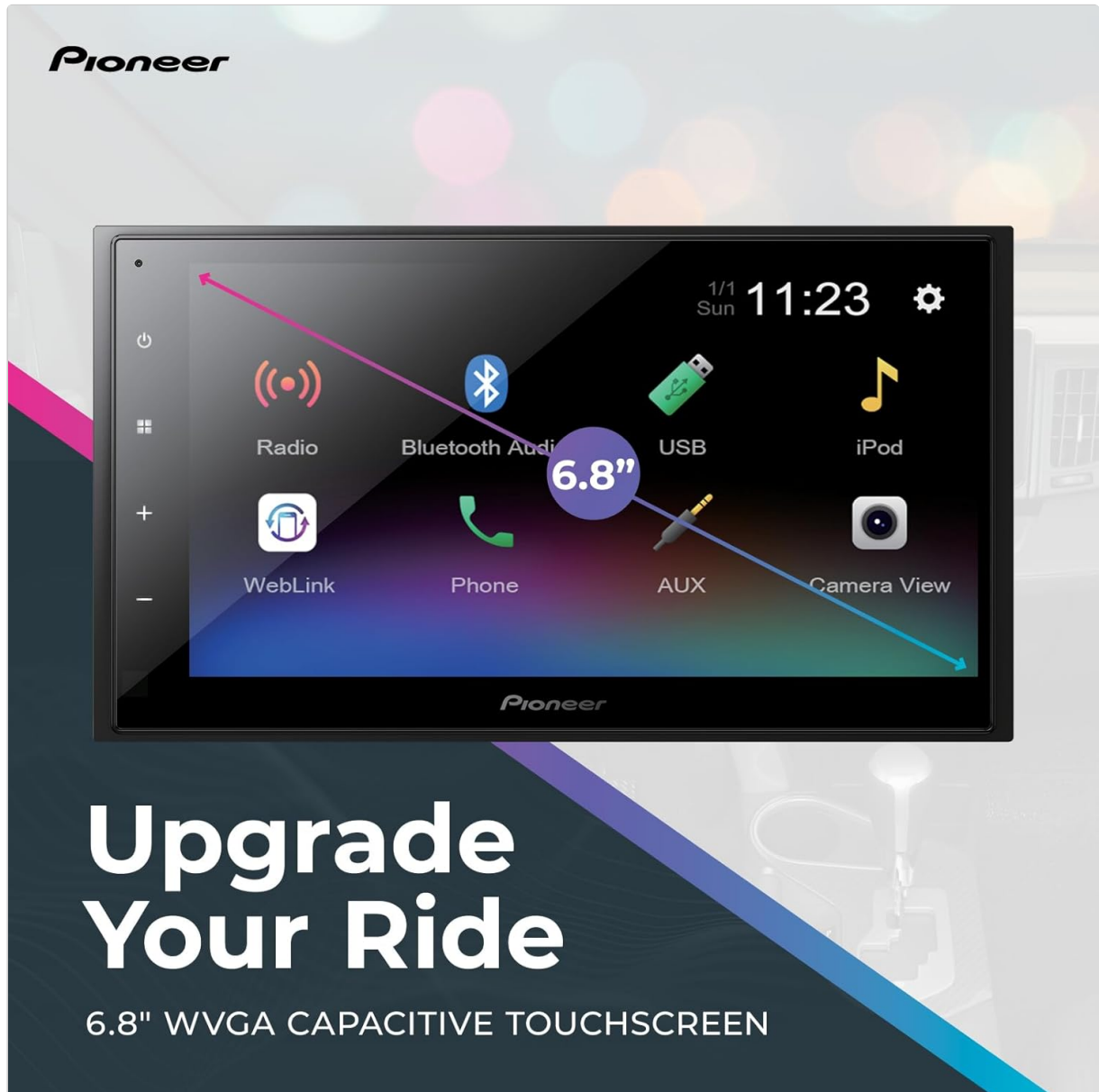
Image: The Pioneer DMH-342EX Digital Multimedia Receiver unit, showing its 6.8-inch touchscreen and physical buttons on the left side.