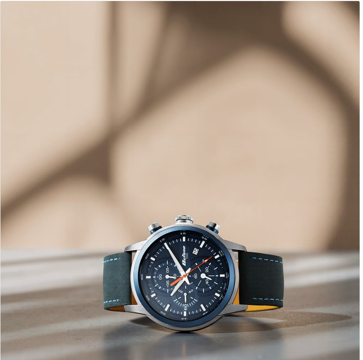
Angled front view of the watch, highlighting the polished silver-tone case and the texture of the leather strap.