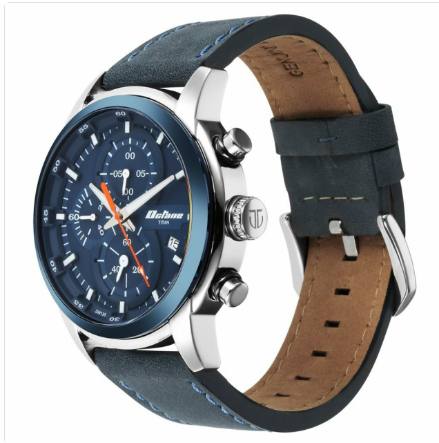
The watch resting on a flat surface, showing its profile and strap details.