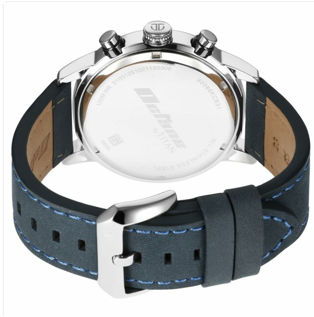
Rear view of the watch with the leather strap unbuckled, showing the case back and strap construction.