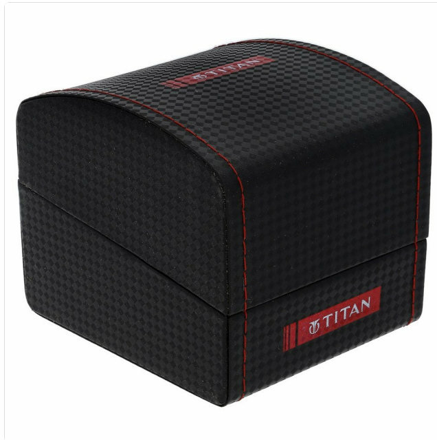
The watch's packaging box, indicating the product's presentation.