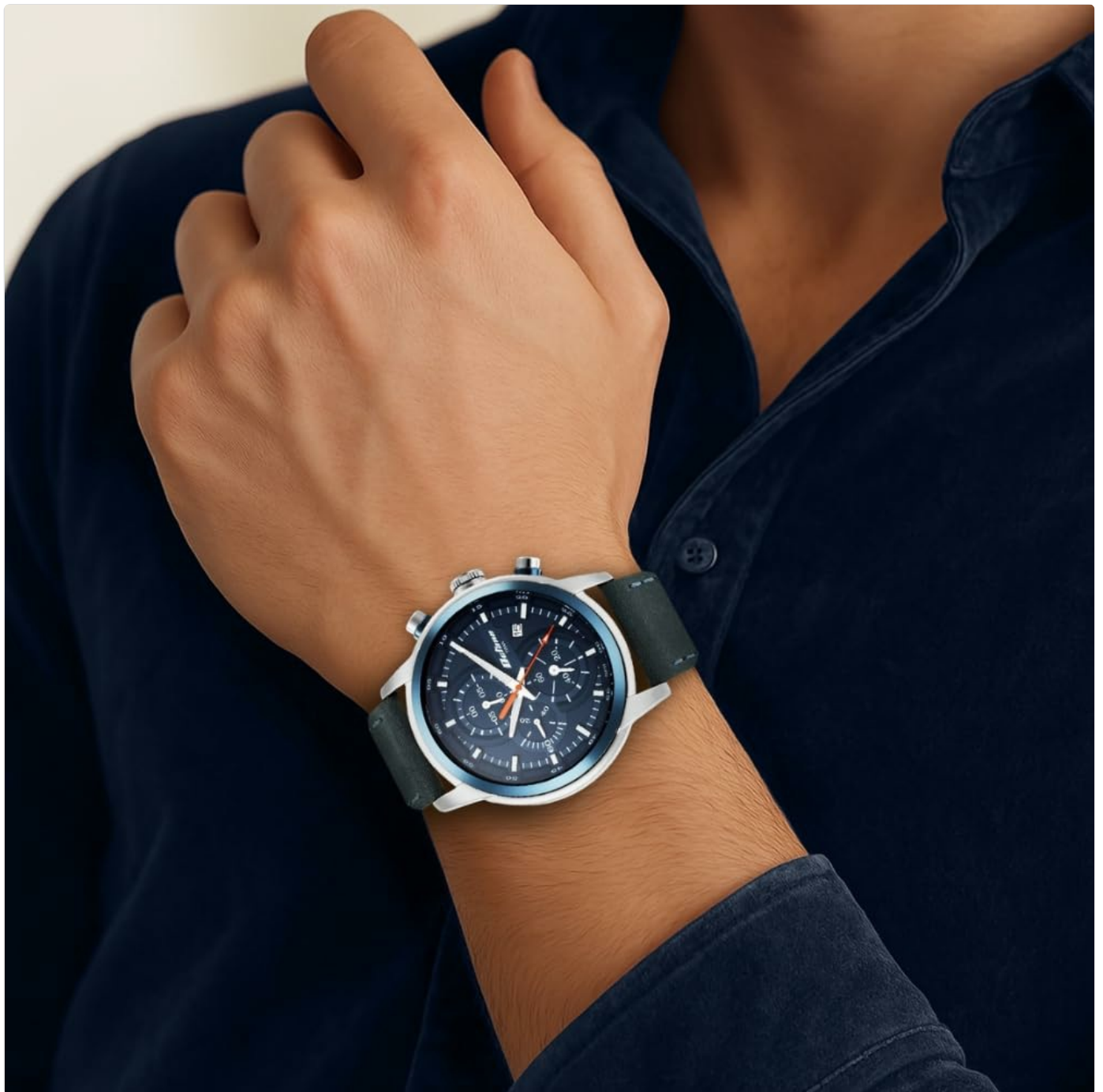
Side view illustrating the watch's crown and two chronograph pushers on the right side of the case.