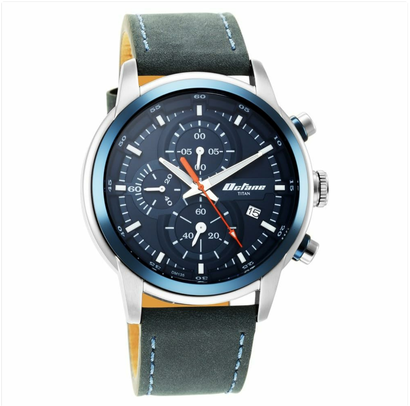
Front view of the Titan Octane Chronograph Watch, showcasing its blue dial, three sub-dials, and blue leather strap with light blue stitching.