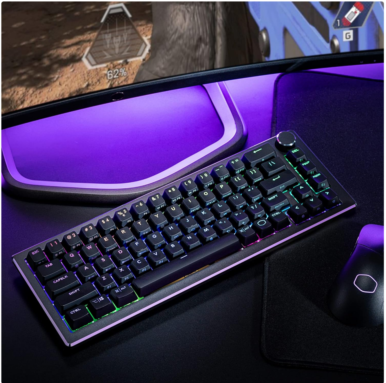
The Cooler Master CK721 keyboard is shown in a gaming setup, demonstrating its vibrant RGB backlighting in action. The compact size allows for more desk space.