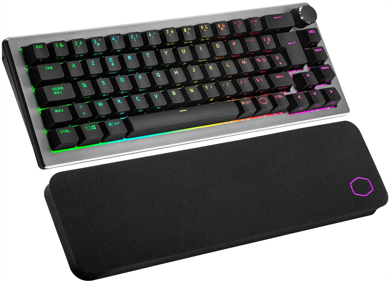
The Cooler Master CK721 Mechanical Gaming Keyboard shown with its included foam wrist rest. This image highlights the compact 65% layout and the overall design of the keyboard.